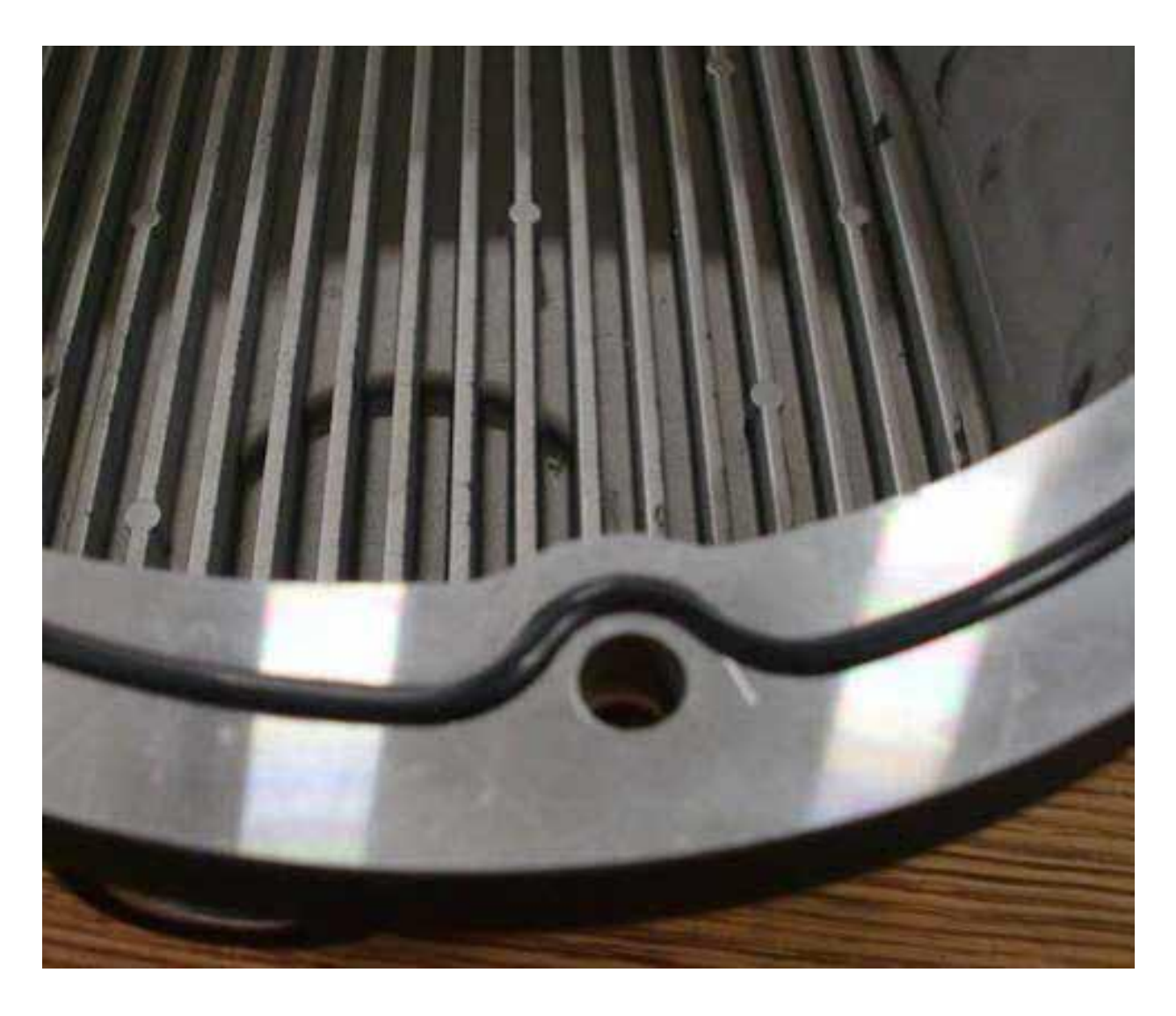
10. Install the supplied O-ring onto the aFe differential cover.