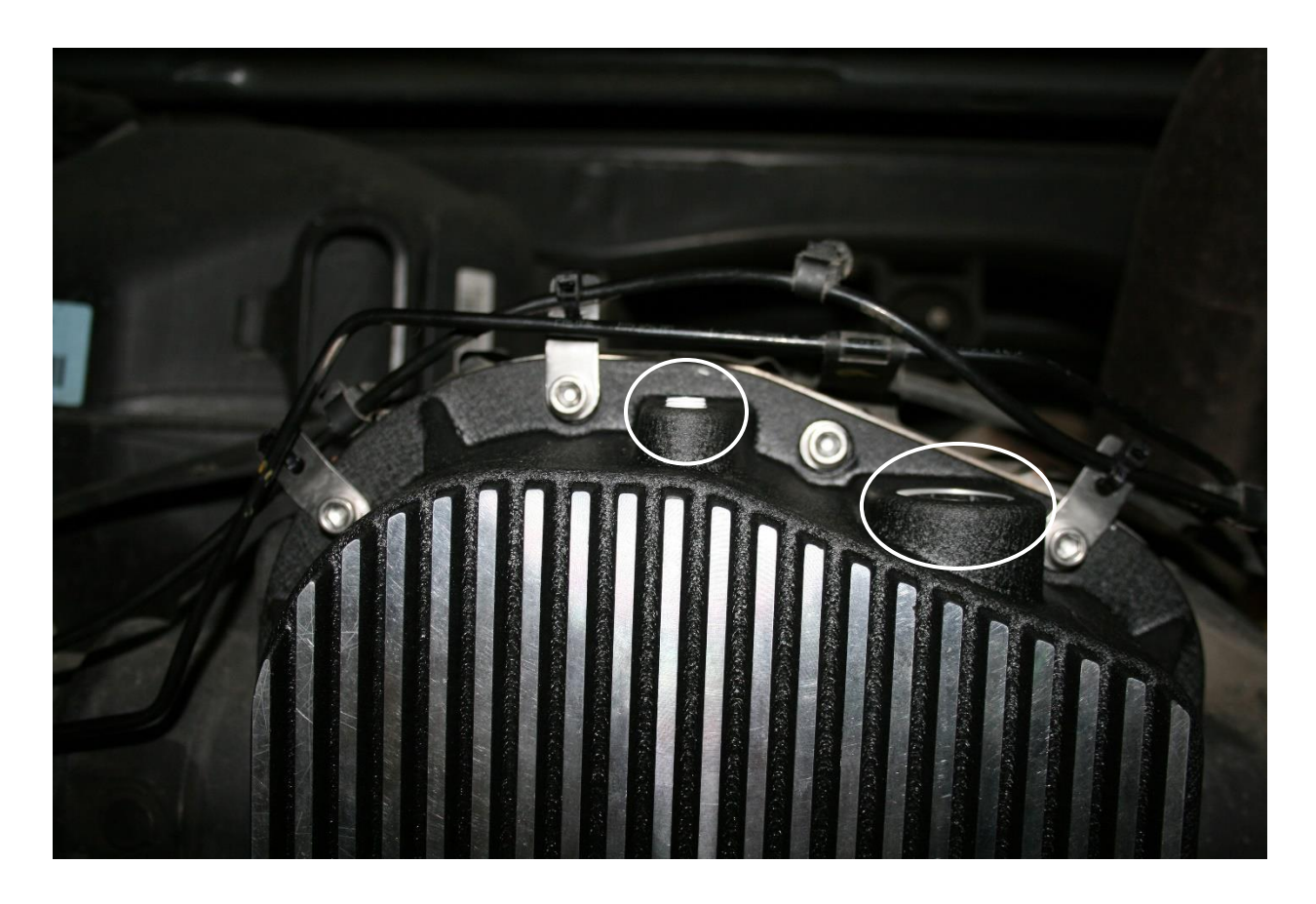
21. If not otherwise utilizing the port, apply Teflon pipe sealant and install the supplied 1/8" NPT plug into the top of the cover.