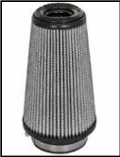
Pro DRY S Air Filter