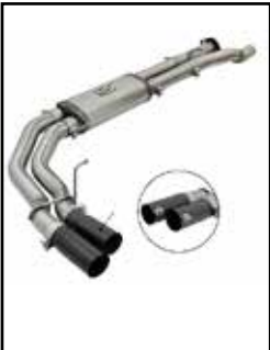
Side Exit Exhaust System

P/N: 49-43091-B (Blk. Tips) 49-43091-P (Pol. Tips)