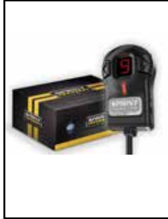
Sprint Booster V3

P/N: 48-43020-HC (Street) 48-43020-HN (Race)