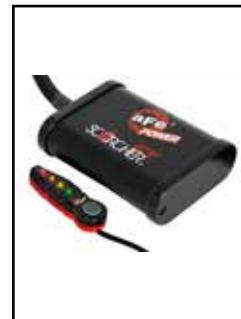
SCORCHER GT Module

P/N: 49-43045-B (Blk. Tips) 49-43045-P (Pol. Tips)