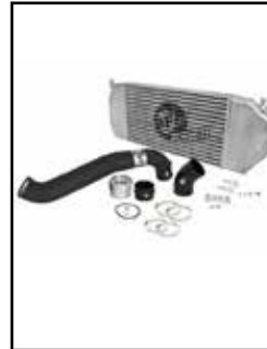
Intercooler w/ Tube