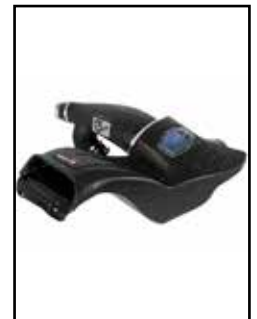
Momentum GT Air Intake

P/N: 51-73115 (PDS) 54-73115 (P5R) 75-73115 (PG7)