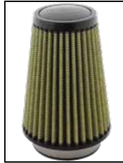
Pro-GUARD 7 Air Filter