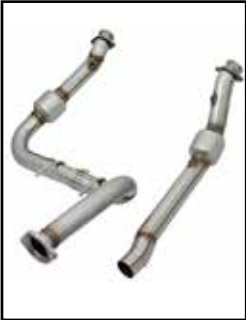
Twisted Steel Downpipes

P/N: 48-43020-HC (Street) 48-43020-HN (Race)