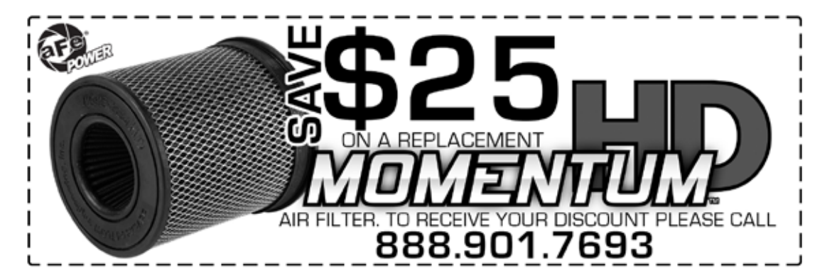
To purchase any of the items above, view airflow charts, dyno graphs, photos, and video; please go to aFepower.com.