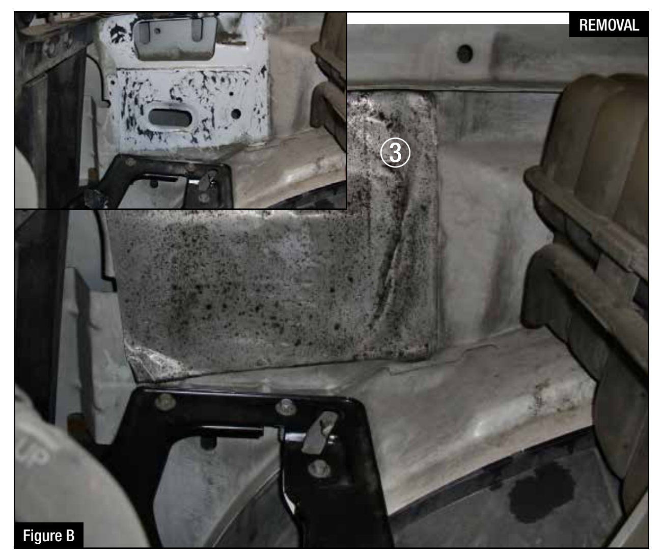
Refer to Figure B for steps 4