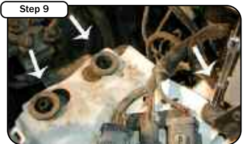
Remove the 8mm bolt that secures the cruise control (see arrow). Insert the plastic spacers into the rubber gromets. On the 04-05 models there is no cruise control bracket. A m6 screw and washer is provided.