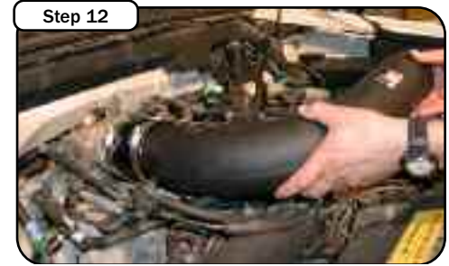
Install the smaller end of the intake tube into the throttle body coupler and insert other end into the hump coupler on the housing. Tighten down clamps on both couplers.