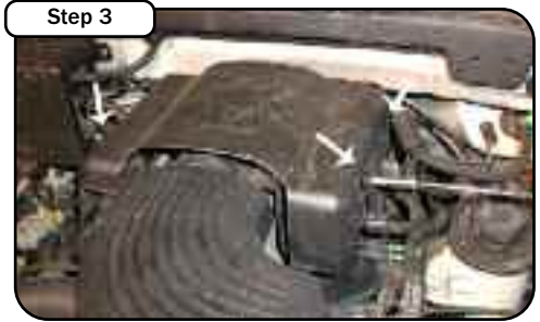
Remove the three 10mm bolts holding the throttle body cover..