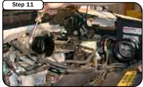
Install the hump coupler and clamps on the air filter housing and install the 3" straight coupler and clamp on the throttle body