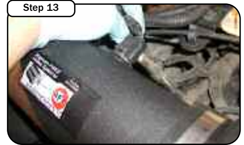
Install the rubber grommet into the IAT sensor location. Reinstall the IAT sensor and reconnect harness. At this time plug the MAF sensor into the harness and secure harness on the side of the housing with the included mounting holes. If you do not have a IAT sensor use the provided grommet and cap to seal the opening.