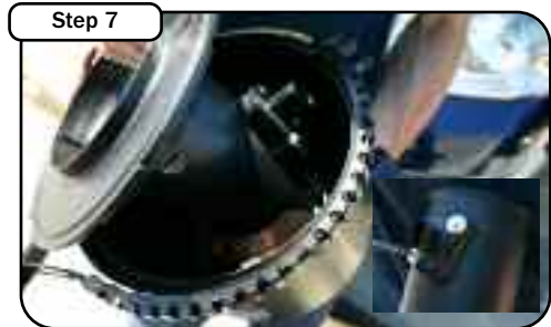
Separate the filter canister by unfastening the band clamp and removing the air filter. Disconnect the harness from the MAF sensor. Unbolt the MAF Sensor from the filter base and the short wire harness set aside for later use