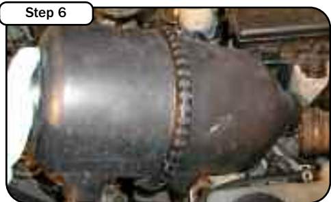
Lift air filter housing by pulling straight up it is held in place with 2 rubber gromets. On the back side of the canister is the MAF harness. Unplug harness from vehicle and remove. Save items for future use if needed.