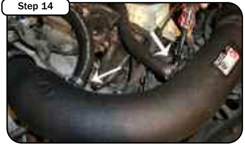
Install the 3/4" idle air bypass hose and the 5/8" breather hose on the intake tube and tighten down clamps. If you do not have a idle air bypass valve seal with the provided 3/4" vacuum cap. Install air filter and tighten down the clamp.