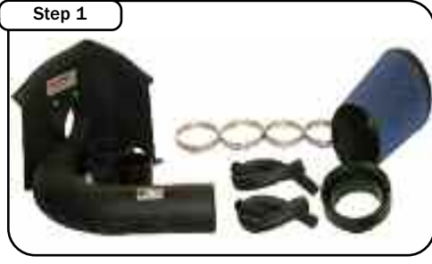
Complete kit with parts.

P.O. Box 1719 Corona, CA 92878 Support: 877-512-8111 www.aFeFilters.com