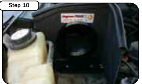
Insert the air filter housing into the engine bay and bolt down the housing to the bottom bracket with the supplied nuts and bolts. Re install the 8mm bolt that secures the cruise control.