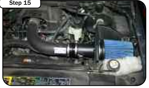
Place enclosed CARB EO sticker on a clean/smooth surface near the intake system. EO identification label is required to pass the smog test inspection. Your installation is now complete. Close hood slowly to verify hood clearance. Check and retighten connections and filter after a few hours of operation.