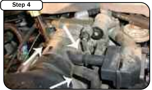
Loosen the factory hose clamp on the throttle body, and the 3/4" idle air bypass hose and the 5/8" breather hose. On some 04-05 models the IAB is not present.