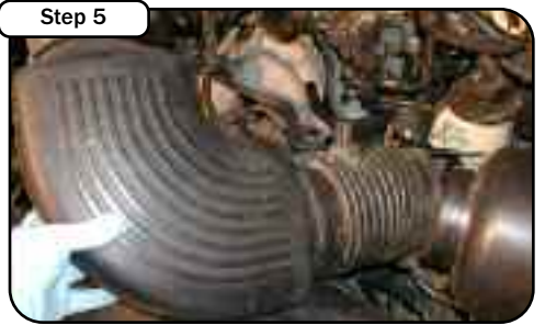
Unplug the IAT sensor and remove the intake duct from the engine. On some 04-05 models the IAT sensor is not present.