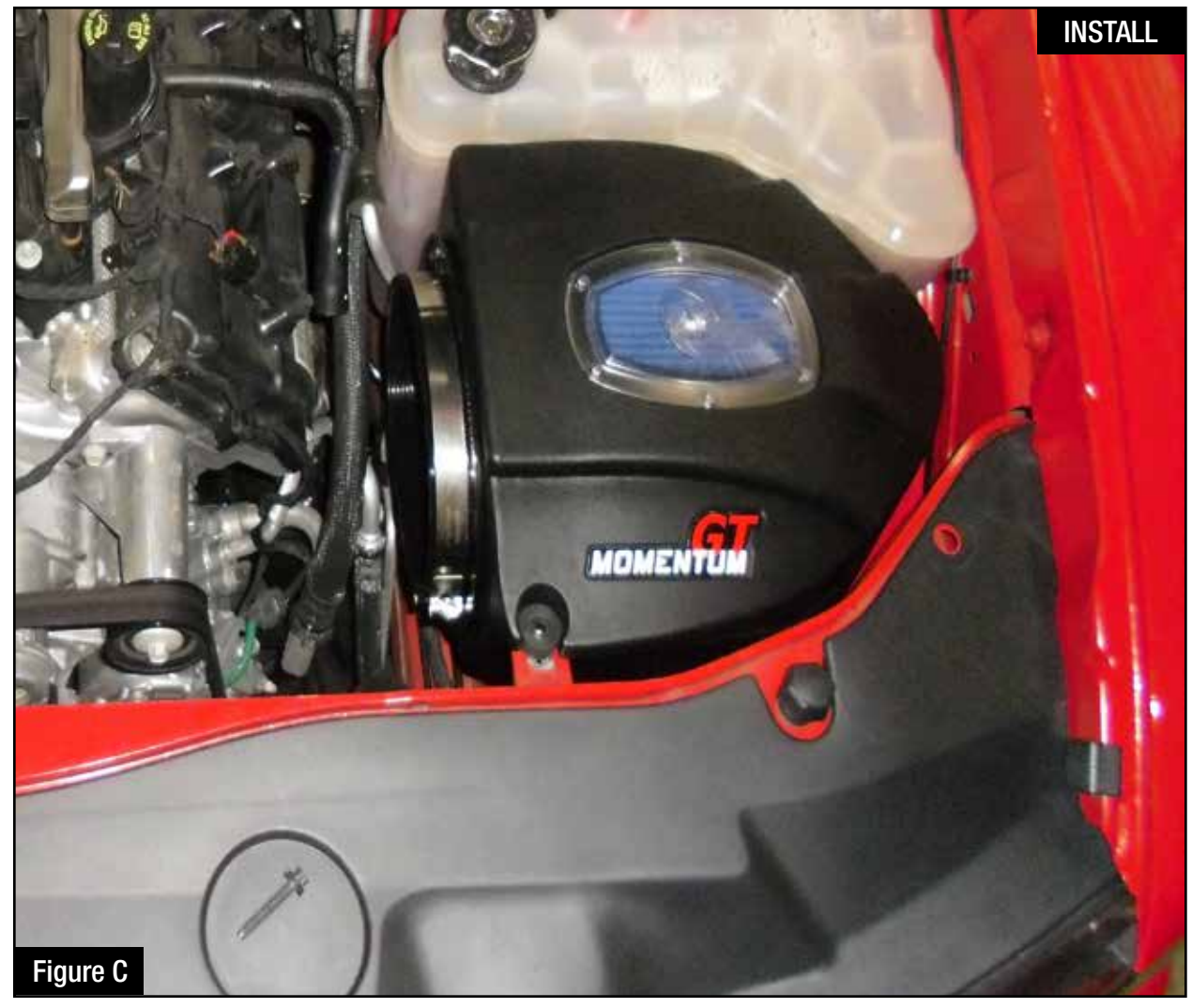
Refer to Figure C for Steps 4-5

Step 4: Re-install housing into the vehicle and make sure the inlet scoop connects to the headlight hole. Step 5: Install the other components for the intake per the intake system instruction sheet.