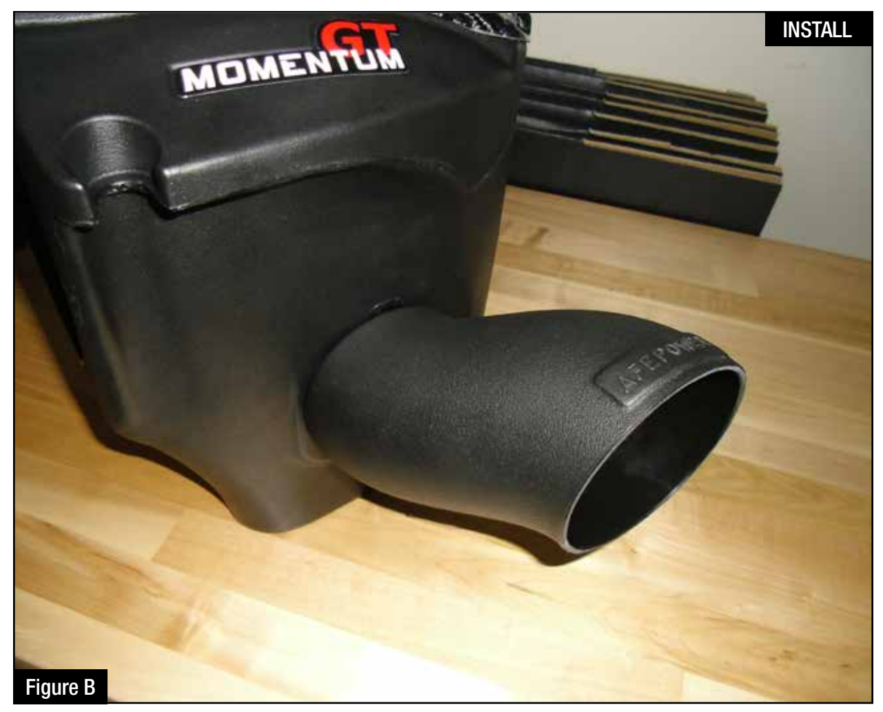
Refer to Figure B for Step 3