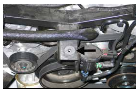
9. Install the provided nut insert into the air box mounting grommet hole as shown.