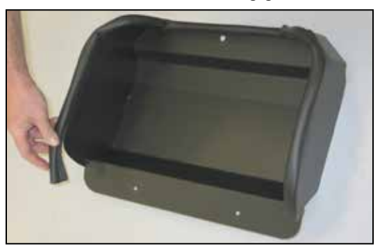
8.Install the provided edge trim onto the heat shield as shown.