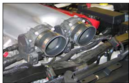
12. Install the silicone hoses (084091) onto the throttle bodies and secure with the provided hose clamps.