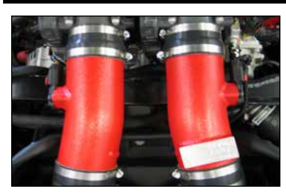
23. Reconnect the mass air sensor electrical connections.