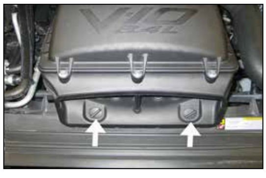
4. Unscrew and remove the two air box fastener nuts shown.