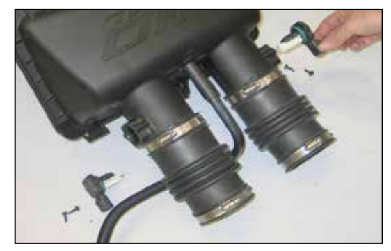
15. Remove the mass air sensors from the factory air box as shown.