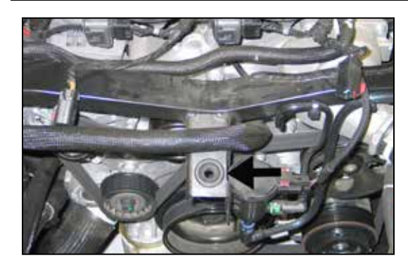
7. Remove the rubber mounting grommet shown.