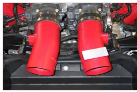
19. Align the intake tubes so that they are straight and even coming out of the throttle bodies, then tighten the heat shield mounting bolts and tube mounting bolts.