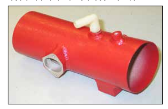
14. Install the 90° vent fitting into the left side K&N<sup>®</sup> intake tube as shown.