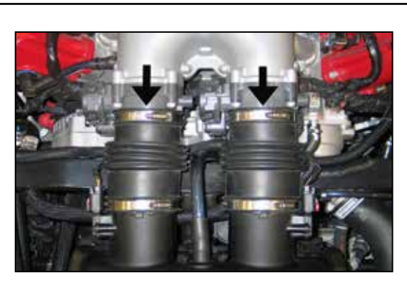
3. Loosen the two hose clamps which secure the stock intake tubes to the throttle bodies.