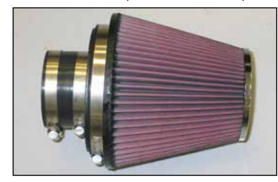
21. Install the silicone hoses (08698) onto the filter adapters and secure with the provided hose clamps.