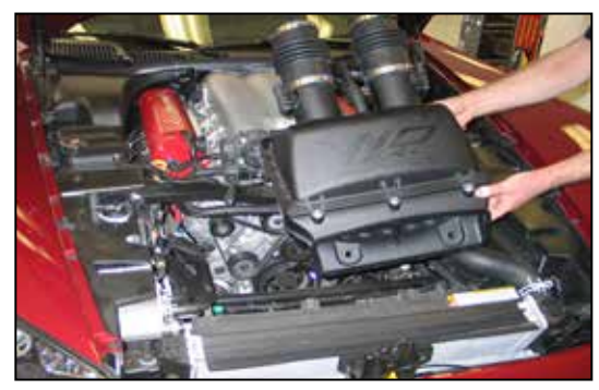
6. Dislodge the air box assembly from the mounting grommet and remove the air box from the vehicle. NOTE: K&N Engineering, Inc., recommends that customers do not discard factory air intake.