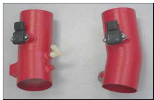
16. Install the mass air sensors into the K&N® intake tubes and secure with the provided hardware.