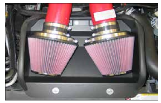
22. Install the filter assemblies onto the intake tubes and secure with the provided hose clamps. NOTE: It may be necessary to readjust the intake tube alignment for proper filter fit. NOTE: During mild weather conditions, K&N Engineering, Inc., recommends installing the provided Drycharger® filter wraps (RF-1048DK). If you have any concerns, return the vehicle to stock using the factory equipment. Please be aware the Drycharger® is water repellent, not water proof. Depending on conditions and usage the water repellent treatment is good for 1 to 2 years. See the parts list to reorder a new Drycharger® if necessary.