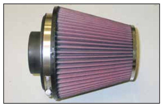
20. Install the filter adapters into the K&N® air filters and secure with the provided hose clamps.