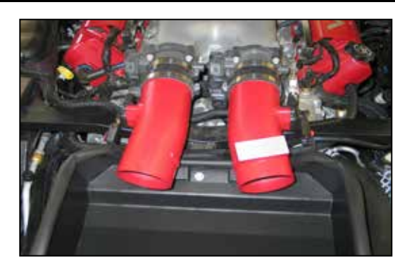
18. Install the right side K&N® intake tube into the silicone hose at the throttle body and then secure the tube to the mounting bracket with the provided hardware.

\label{eq:NOTE:Donot completely tighten at this time.} \\