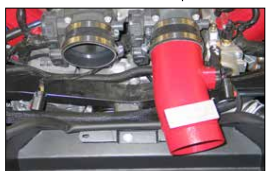
17. Install the left side K&N® intake tube into the silicone hose at the throttle body while connecting the crank vent line to the vent fitting. Secure the tube to the bracket with the provided hardware.

\label{eq:NOTE:Donot completely tighten at this time.} \\