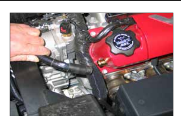
5. Cut the tie wrap which secures the vent hose to the valve cover port. Then unhook the crank case vent hose as shown.