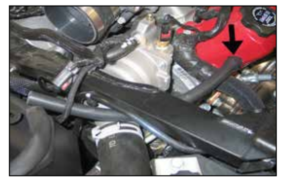
13. Install the provided crank case vent hose onto the valve cover port as shown and secure with the provided tie wrap.