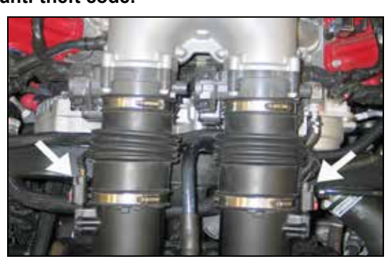
2. Release the locking tabs and then disconnect the two mass air sensor electrical connections.

NOTE: Disconnecting the negative battery cable erases pre-programmed electronic memories. Write down all memory settings before disconnecting the negative battery cable. Some radios will require an anti-theft coded to be entered after the battery is reconnected. The anti-theft code is typically supplied with your owner's manual. In the event your vehicles' anti-theft code cannot be recovered, contact an authorized dealership to obtain your vehicles anti-theft code.