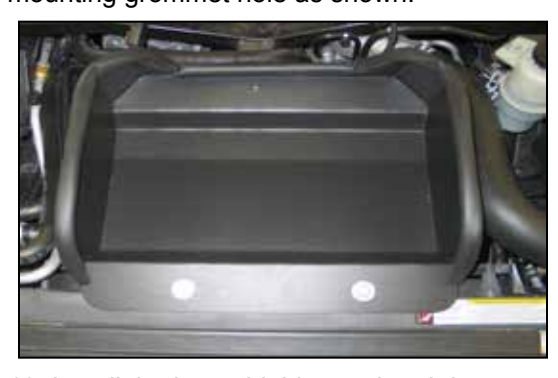
Install the heat shield onto the air box mounting location and secure with the provided hardware. NOTE: Do not completely tighten at this time.