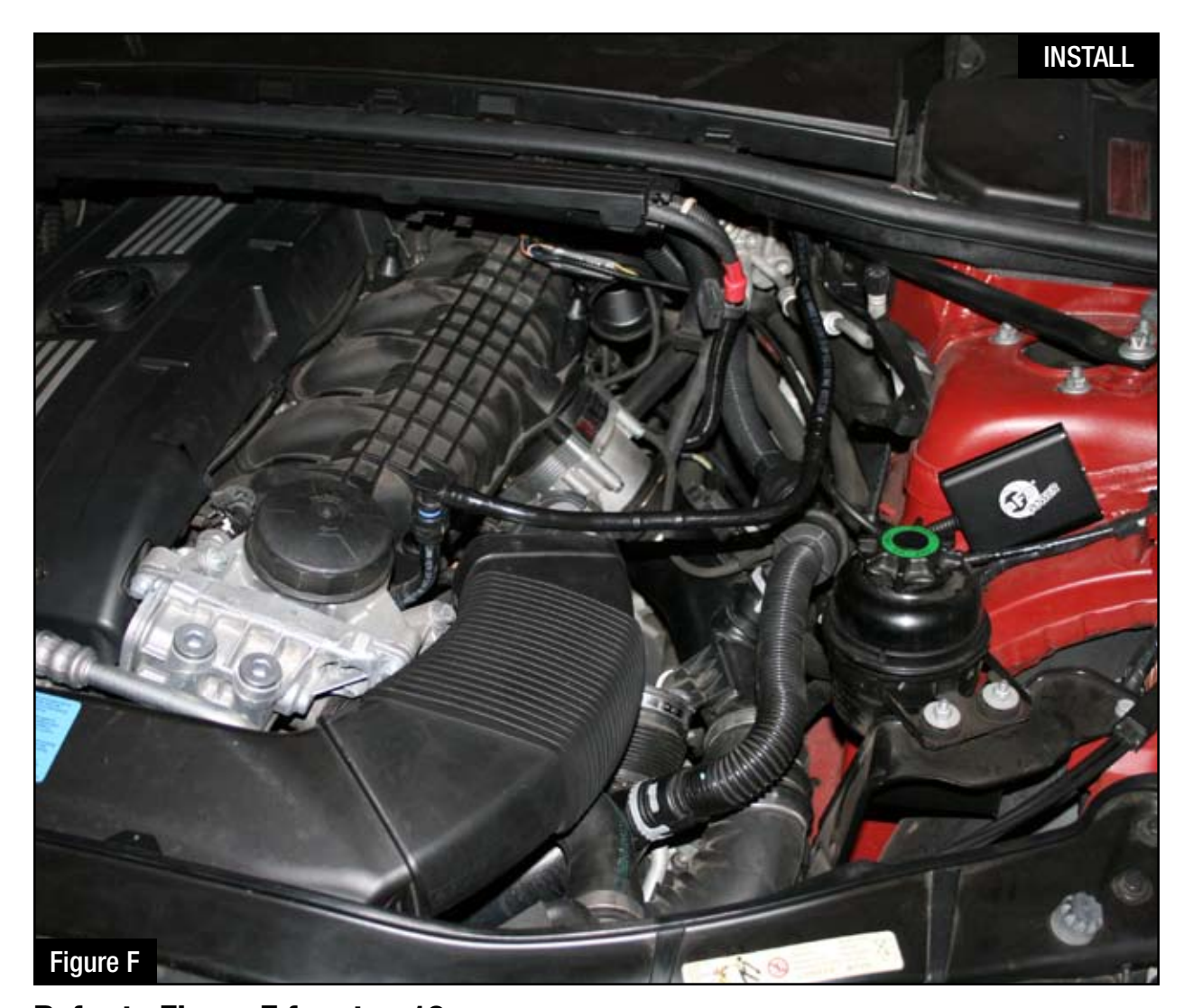
Refer to Figure F for step 12

12. Re-install your factory intake system if you removed it. Your installation is now complete! Thank you for choosing aFe Power!