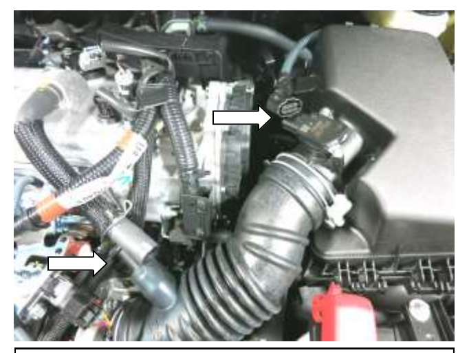
c. Unclip and disconnect the MAF (mass air flow ) sensor electrical connector and disconnect the vent hose from the air intake hose.