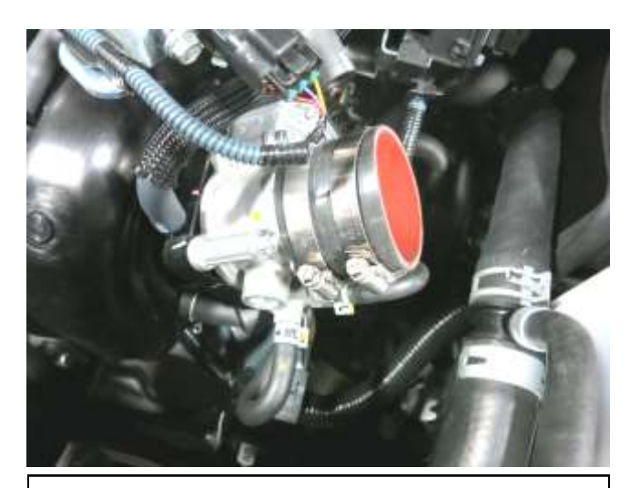
g. Install the supplied coupler and #40 hose clamps on the throttle body.