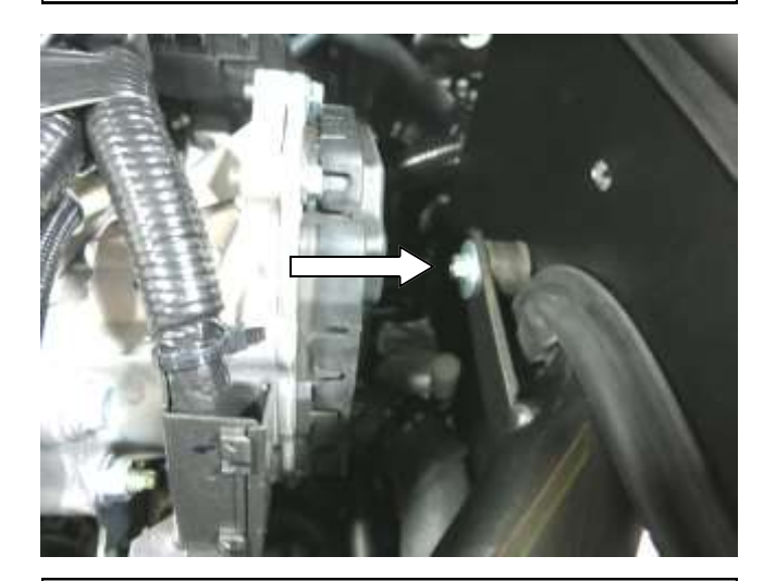
i. Secure the AEM intake tube to the rubber mounted stud with the supplied M6 nut and washer.