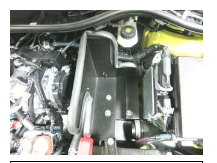
d. Drop the complete heat shield assembly into the engine compartment. Secure the wiring harness bracket to the back of the heat shield and then secure the heat shield to the engine compartment with the three M6 bolts removed in step 2 g.