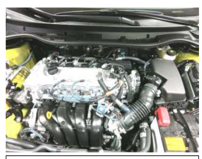
b. Remove the engine cover by gently pulling it up from the engine.