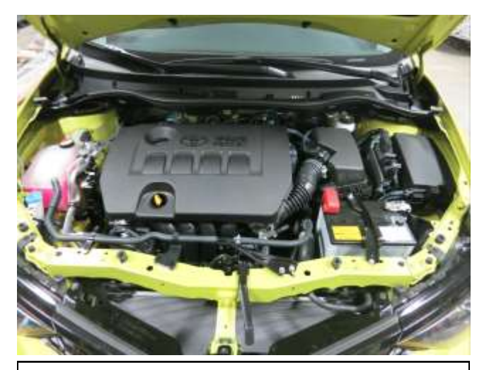
m. Stock air intake system.