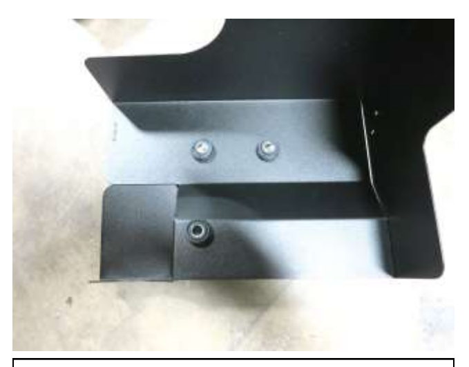
b. Install the grommets and metal sleeves onto the AEM heat shield as shown.