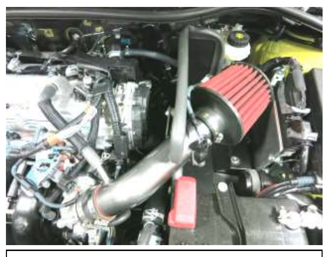
I. Reconnect the vent hose to the intake tube and tighten all hose clamps .