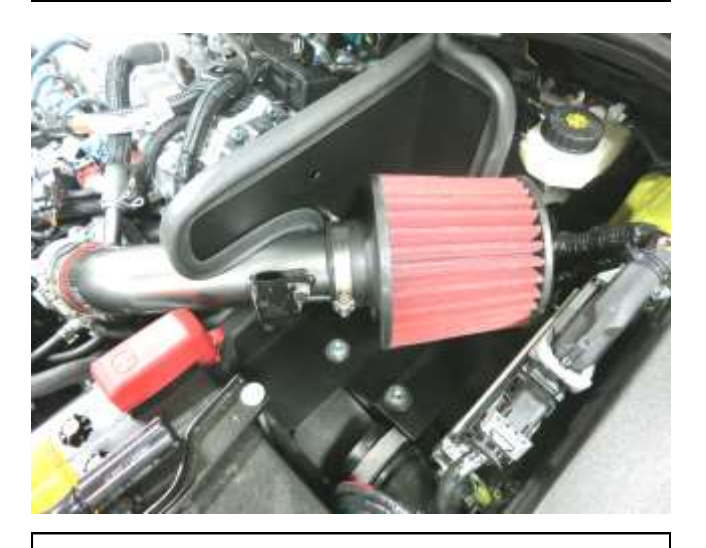
j. Install the AEM filter onto the intake tube as shown.