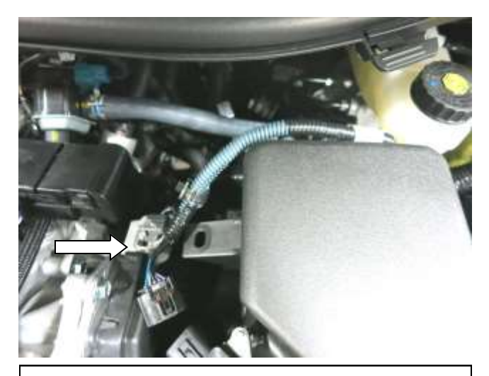
e. Release the clip that secure the MAF sensor wiring harness to the air box.