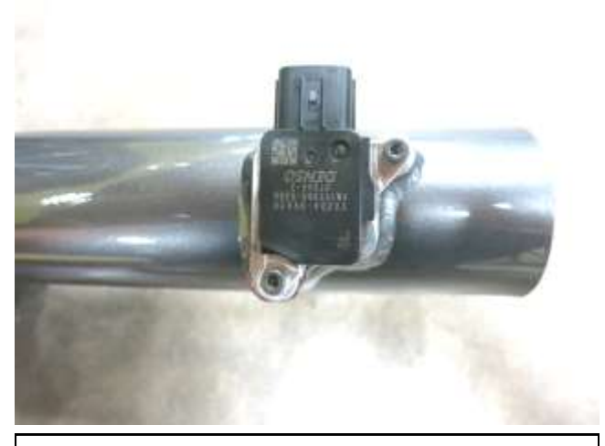
f. Remove the MAF sensor from the factory air box and transfer it onto the AEM intake tube, secure with 4MM bolts supplied.