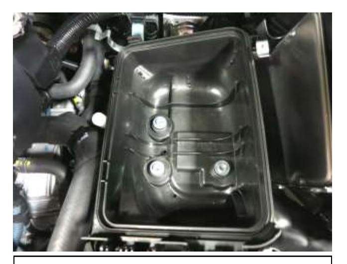
g. Remove the three M6 bolts that secure the lower air box to the engine compartment.