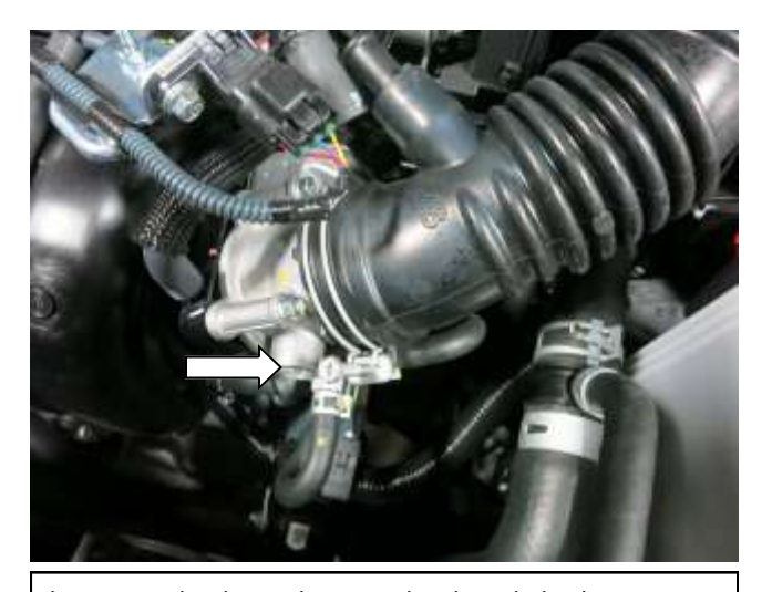
d. Loosen the hose clamp at the throttle body .