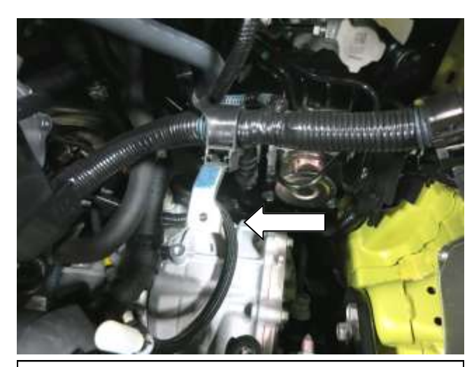
h. Remove the M6 bolt that secures the wiring harness to the lower air box and remove the lower air box.