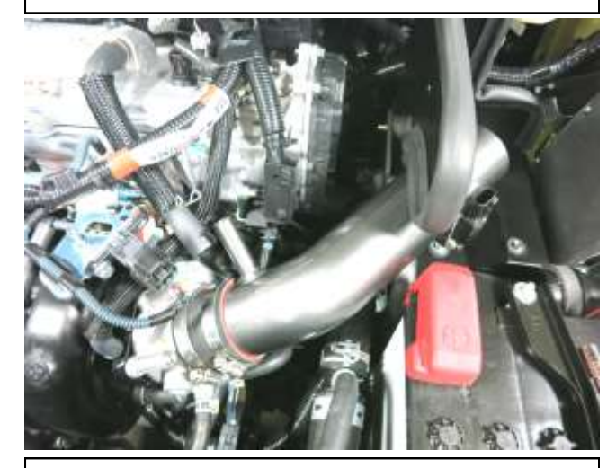
h. Install the complete intake tube assembly to the coupler and line up bracket with the rubber mounted stud.