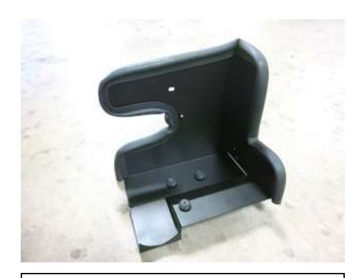
c. Install the supplied rubber edge trim on the AEM heat shield as shown.