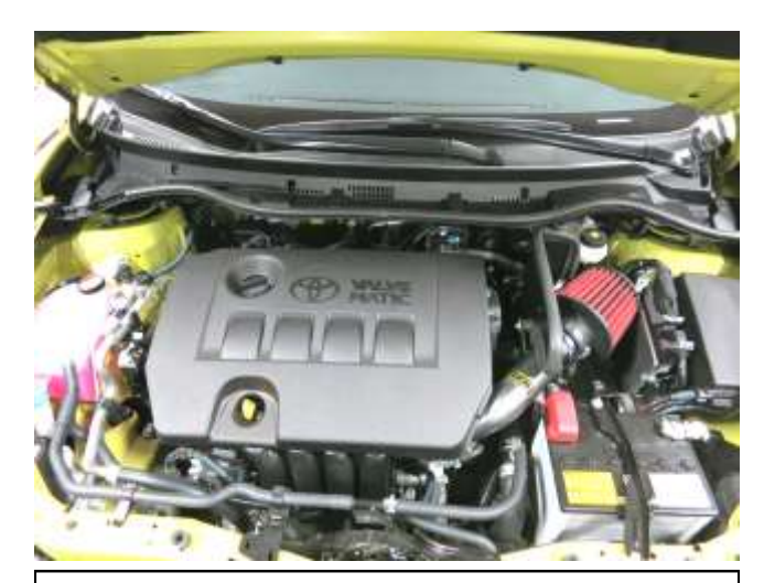
n. AEM 21-776C intake system installed.