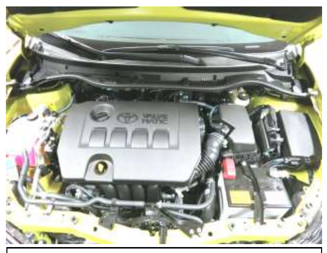
a. 2016 Scion iM with factory air intake system.