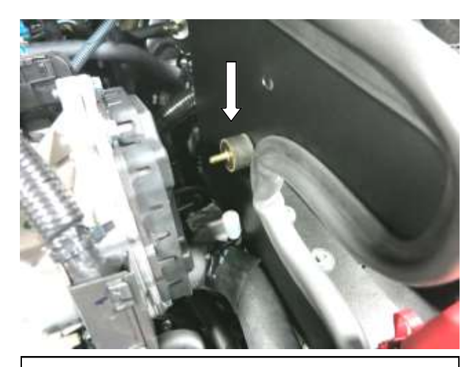
e. Install the supplied rubber mounted stud to the AEM heat shield as shown.