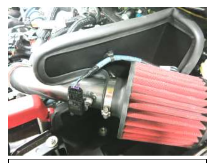
k. Reconnect the MAF sensor and secure the wiring harness clip to the heat shield as shown.