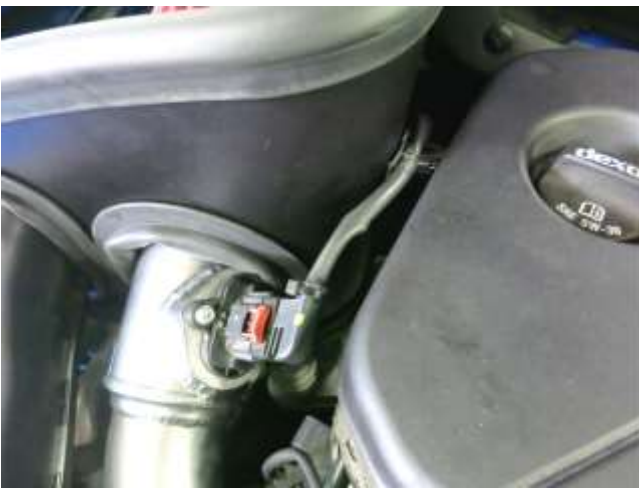
m. Connect the MAF harness and lock by sliding the red tab and clip the MAF harness wire tie to the heatshield.