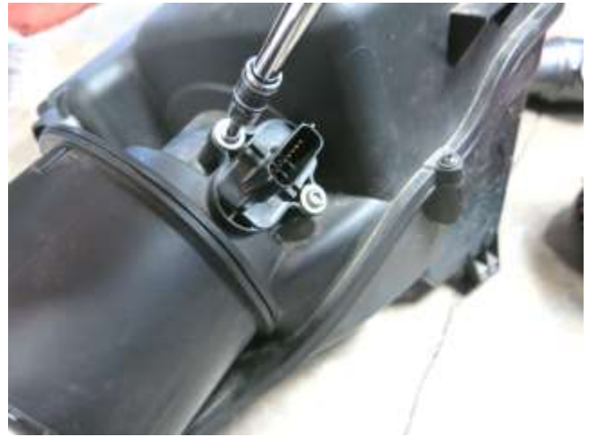
h. Using a T25 Torx bit, remove the MAF from the air box. These screws will not be reused. Note: Do not discard any of your stock equipment.