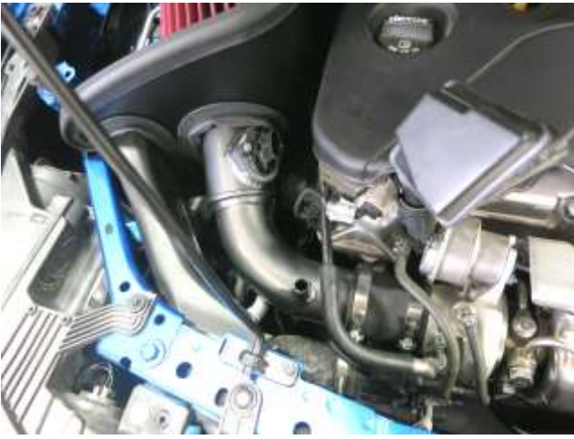
k. Adjust the tube orientation for best fit, ensuring the air filter does not contact any part of the vehicle, and torque the tube-side hose clamp to 30 in-lb.