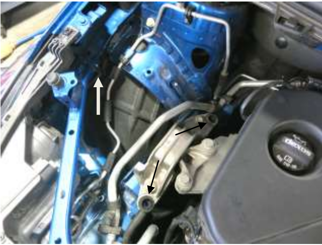
g. Ensure the two rubber grommets in the engine mount are still installed. If they have been removed with the air box, reinstall them at this time. The third rubber grommet located along the inner fender (denoted by the white arrow) will not be reused and can be kept on the air box.