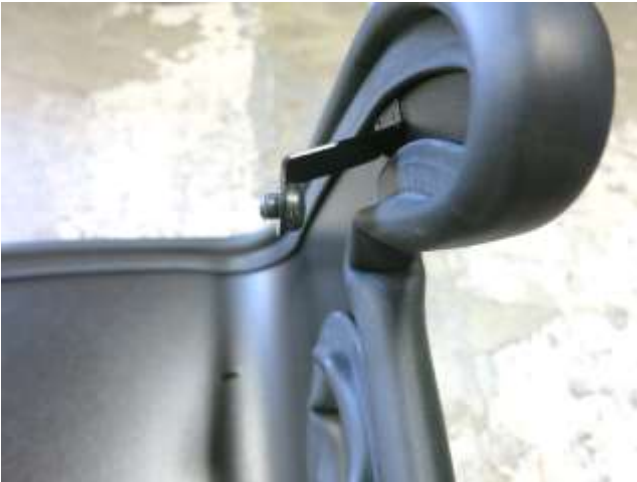
c. Install the rubber grommet plug into the tab on the head shield in the orientation shown.