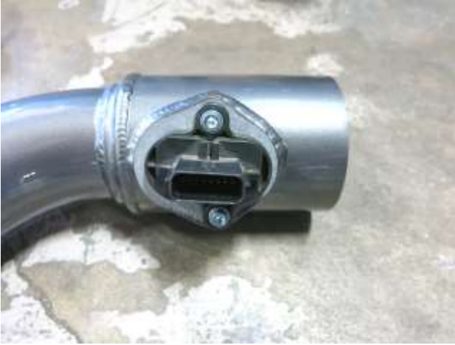
a. Install the MAF sensor into the AEM intake tube using the provided screws and washers.

a. When installing the intake system, do not completely tighten the hose clamps or mounting hardware until instructed to do so.