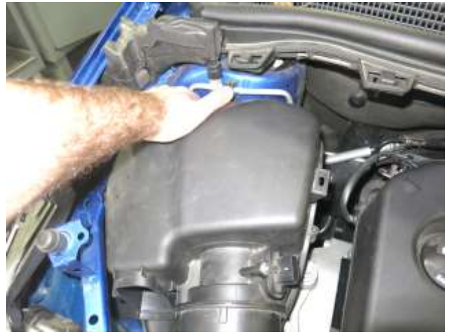
f. Release the air box from its rubber grommets by pulling it up and out of the engine bay while disconnecting the intake hose from the turbo.