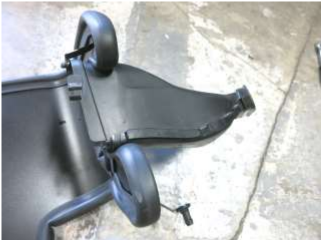
d. Carefully insert the cold air duct into the cut out in the heat shield as shown by rotating it into position. Ensure the tab and grommet are retaining the duct as intended.