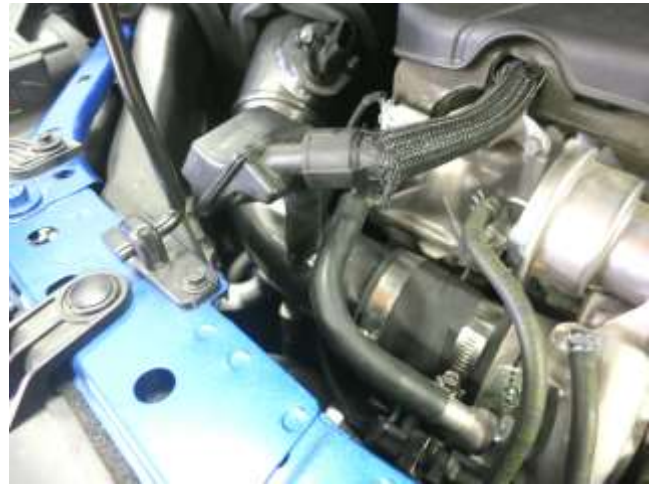
l. Install the PCV hose onto the intake tube.