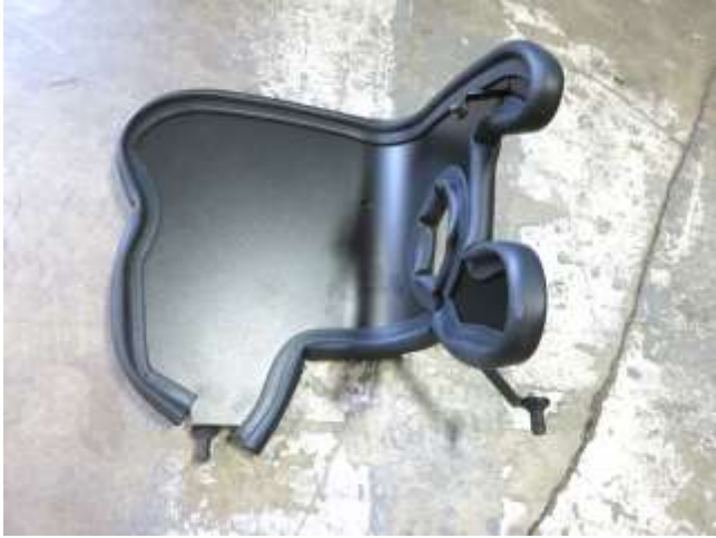
b. Install the hardware and edge trim to the heat shield as shown. Note: Some trimming of the edge trim will be required.