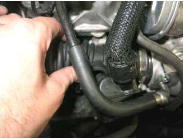
e. Gently disconnect the PCV reservoir by pinching the intake hose while pulling the reservoir free.