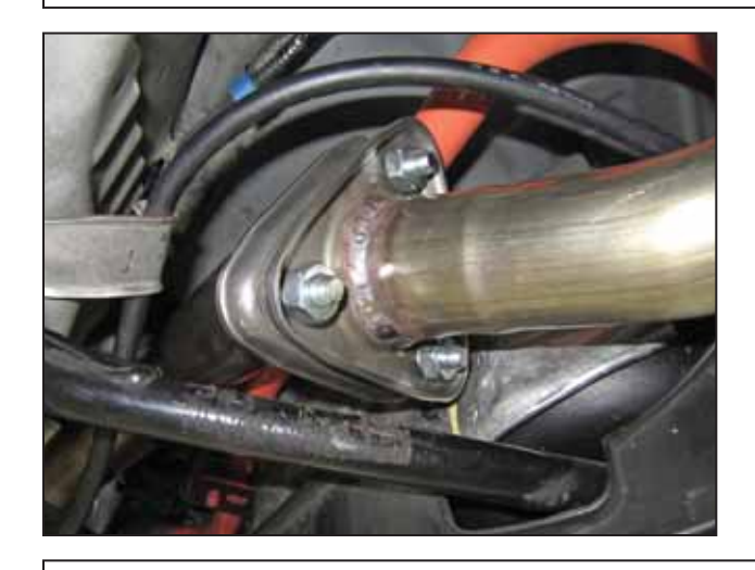
h. Install the supplied gasket (RM-CB84) between the AEM® mid pipe, and rear section. Hold it in place with the 3 supplied M10 bolts (RHBA-M10X125X25) and nuts (RHNA-M10X125).