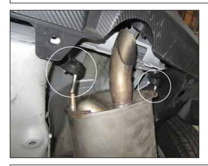
c. Remove the rear section by disengaging the two rubber mounts.