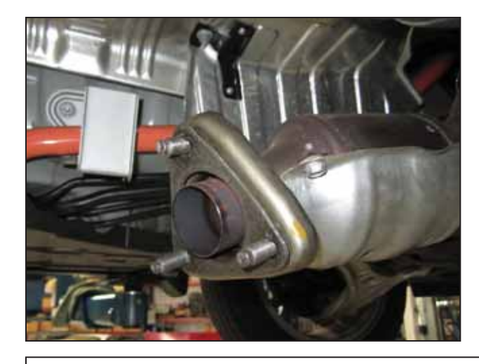
f. Install the supplied gasket (RM-CB84) on the OEM catalytic converter as shown.