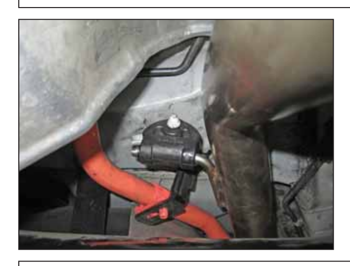
d. Engage the third rubber mount as shown.