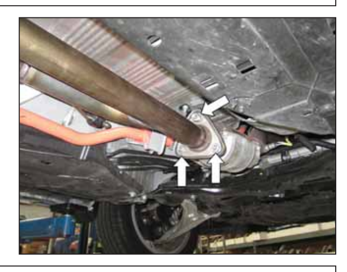
i. Secure the mid pipe to the OEM catalytic converter with the three supplied M10 nuts (RHNA-M10X125).