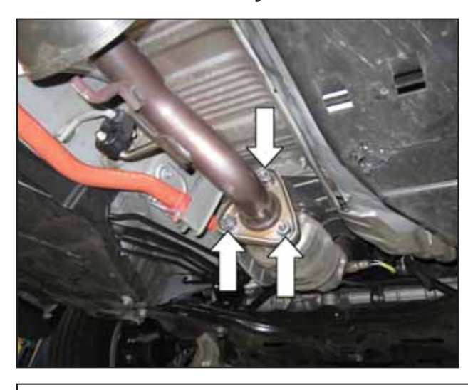
a. Remove the 3 nuts securing the OEM mid pipe to the catalytic converter.