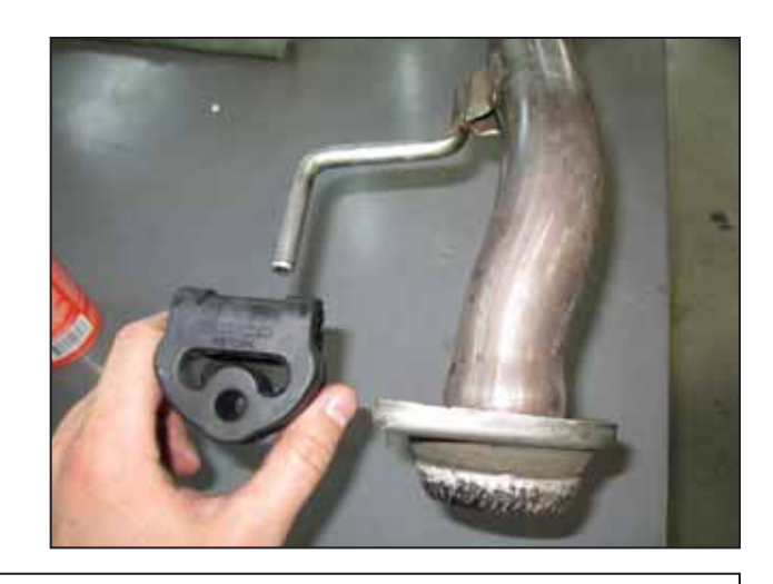
f. Remove the rear most rubber mount from the mid pipe as shown. Silicone spray will help with the removal.