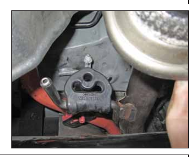
d. Disengage the rear most rubber mount on the mid pipe by sliding it off of the mount on the vehicle's side.