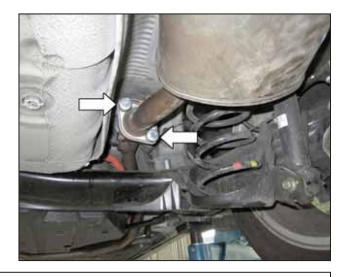
b. Remove the 2 bolts securing the OEM rear section to the mid pipe.