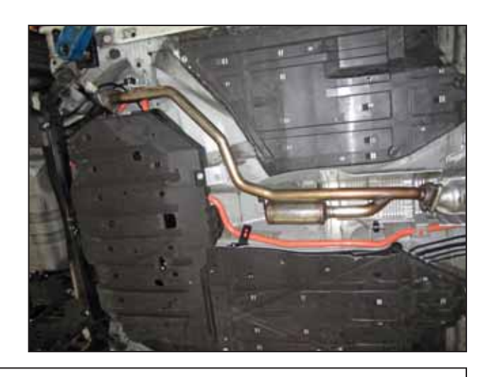
g. Install the AEM ^{\rm @} mid pipe (83034) as shown by engaging the two rubber mounts.