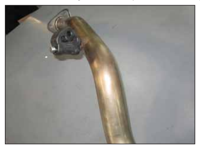
b. Install the OEM rubber mount removed in step 2f, onto the rear section of the AEM® exhaust (83035) as shown.

a. When installing the exhaust system, do not completely tighten the mounting hardware until instructed to do so.