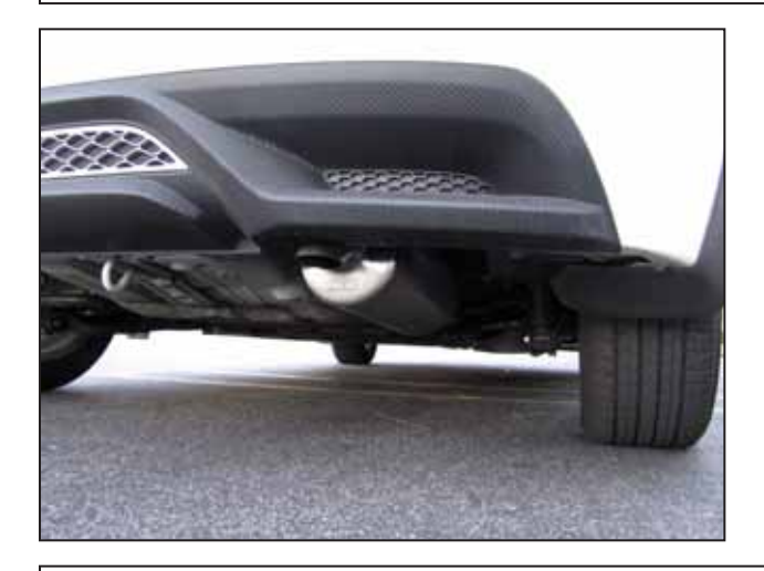
j. Align for best fit, and then tighten all bolts and nuts.