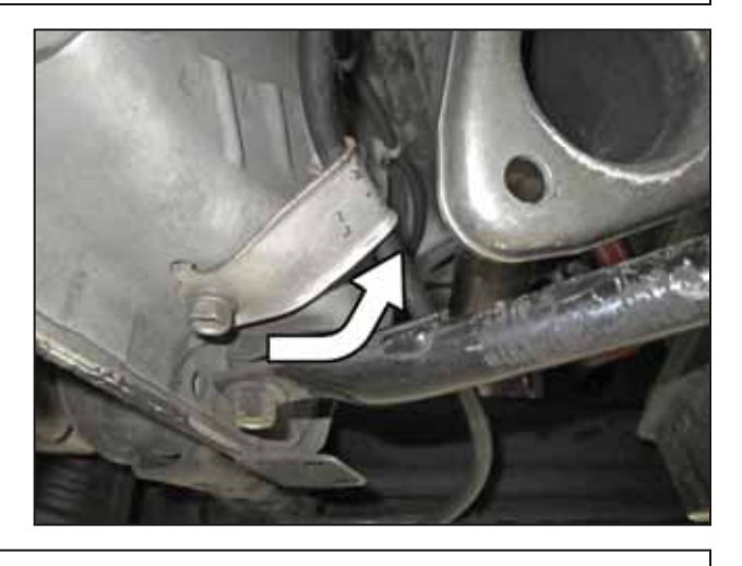
e. Bend the emergency brake bracket up out of the way as shown.