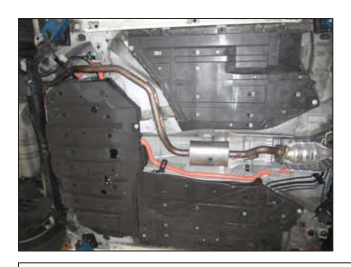
e. Disengage the remaining two rubber mounts and remove the mid pipe from the vehicle.