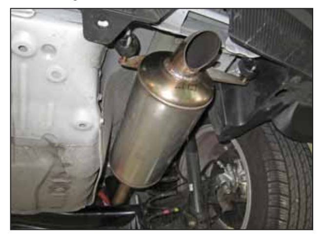
c. Install the rear section of the AEM® exhaust (83035) as shown, by engaging the two rubber mounts at the muffler.