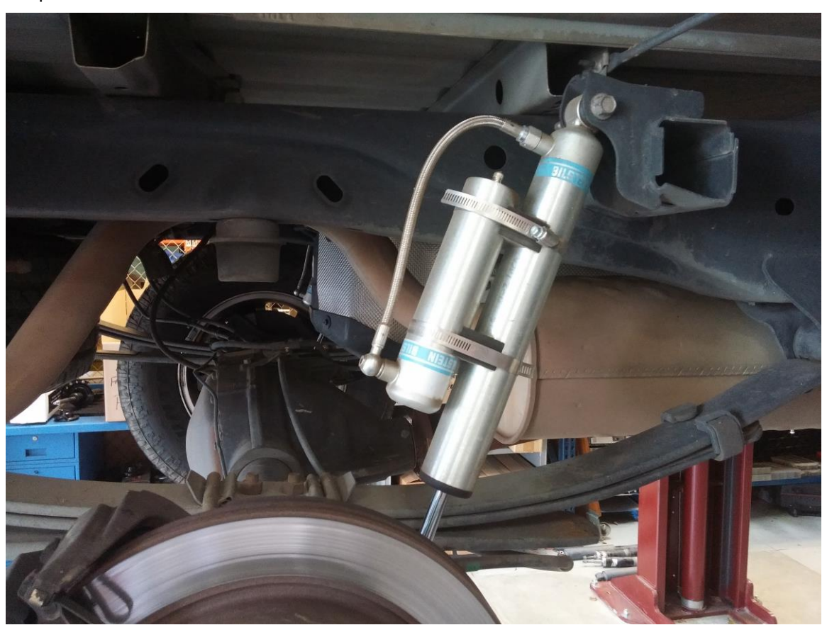
Figure 1. Reservoir placement for both sides