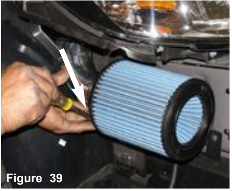
Once the filter is sitting flush over the intake end, continue to tighten the filter clamp.