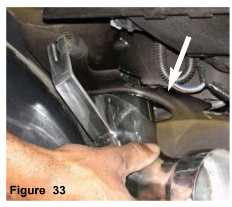
Once you have aligned the secondary intake to the vibra-mount, continue to tighten the m6 nut.