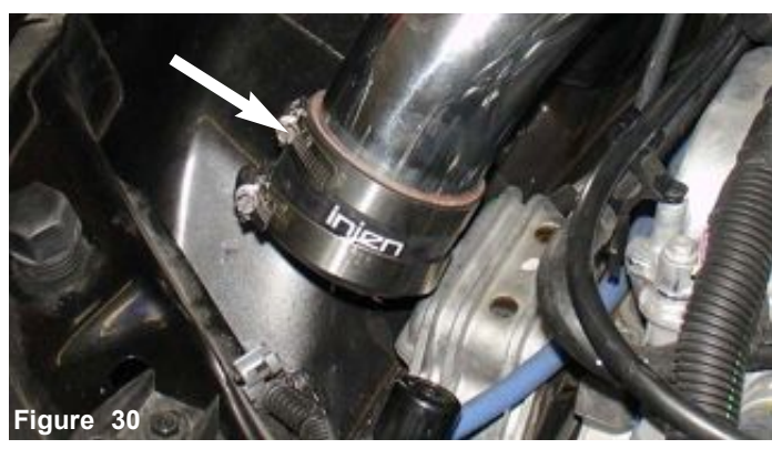
The silicone hose is pressed over the end of the primary intake, a power band is used to secure the silicone hose over the intake end.