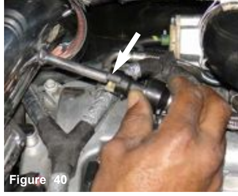
The vacuum clip is pressed over the machined vacuum port.