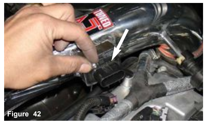
Once the sensor is secured in place, continue to use the m4 bolts in kit to fasten the sensor in place.