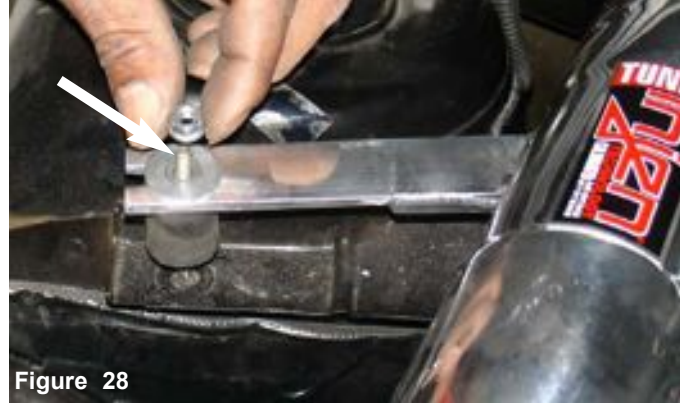
The m6 flange nut and washer are used to fasten the intake bracket to the vibra-mount stud.