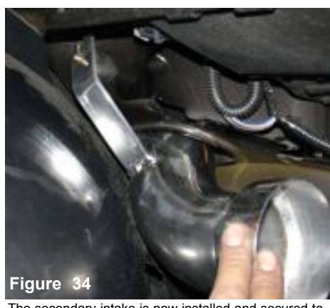
The secondary intake is now installed and secured to the vibra-mount.