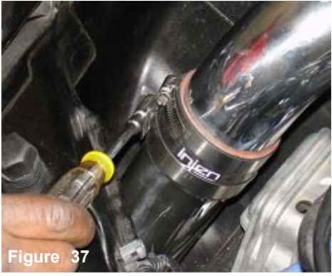
The mass air flow sensor is slowly lowered into the machined sensor adapter.