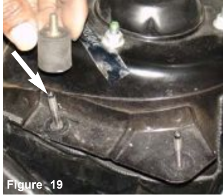
The male/female vibra-mount is aligned and screwed over the air box stud.