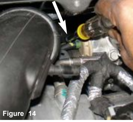
The lower turbo air inlet clamp is now loosened as shown above.