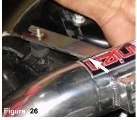
As the primary intake is aligned to the turbo inlet, the intake bracket is aligned to the male/female stud.