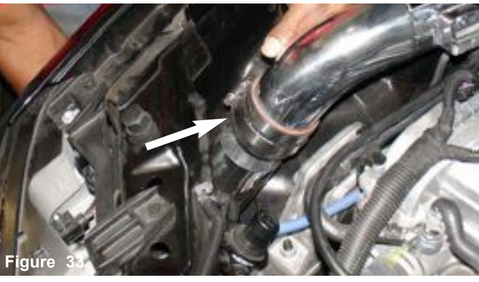
As the secondary intake is inserted into the corner bumper, the top end is aligned to the silicone hose. The intake bracket is also aligned to the vibra-mount stud.