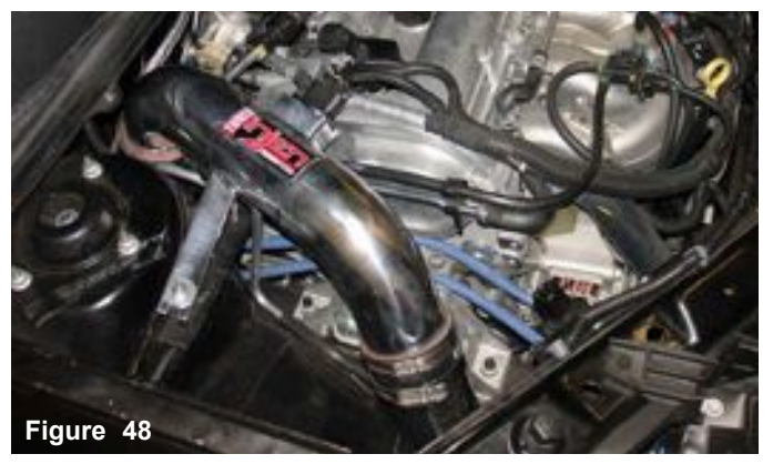
Check the connection of the intake bracket to the vibra-mount and the alignment of the primary and secondary intakes. Everything should be properly aligned to prevent damage to the cold air intake.