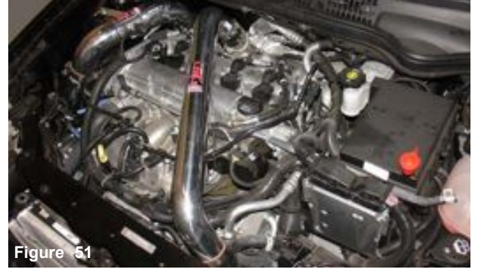
Figure 50 and 51 is shown with Injen's upper intercooler pipe (sold separately)