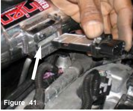
The mass air flow sensor is slowly lowered into the machined sensor adapter.