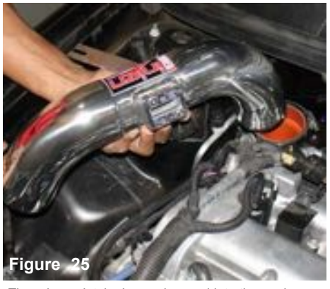
The primary intake is now lowered into the engine compartment.