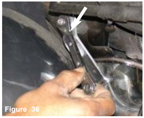
A ratchet or nut driver is used to fasten the m6 flange