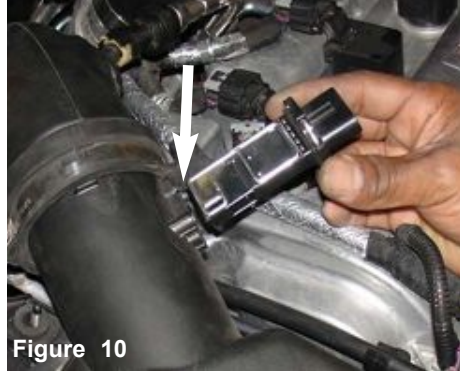
Once you have removed both bolts, continue to pull the mass air flow sensor from the sensor housing.