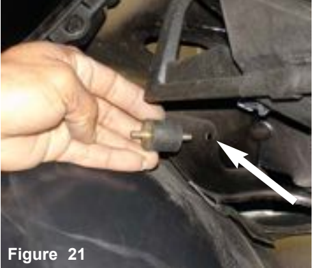
The male vibra-mount is inserted into the pre-drilled hole located on the passenger side bumper support.