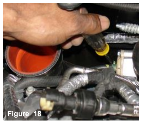
The clamp is tightened over the silicone hose.