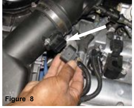
The tab is depress and the electrical sensor harness is removed from the mass air flow sensor.