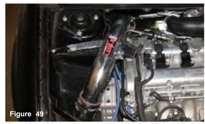
Congratulations! You have just completed the installation of the best air intake system made. Prior to driving, start the engine, and listen for any air leaks, rattling or vibration. Allow 5 to 10 minutes for the ECU to adjust to the added volume or air created by the cold air intake.