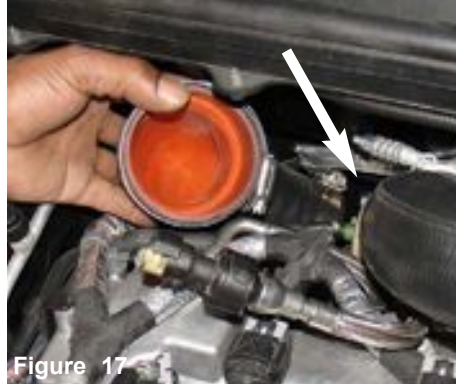
The silicone elbow is now lowered into the engine compartment and over the turbo inlet. The clamp over the turbo is now semi-tightened.