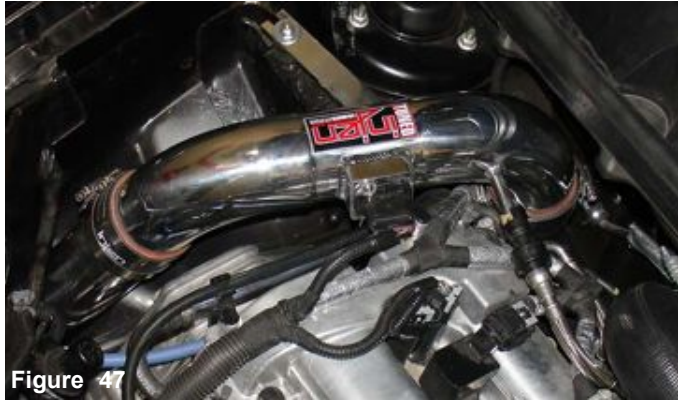
Periodically, check the fitment of both intake systems. Normal driving conditions may loosen nuts, bolts and clamps causing intakes to shift resulting in damage to automotive parts.