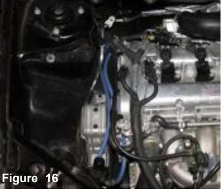
The air box cleaner and air duct is removed from the engine now removed.