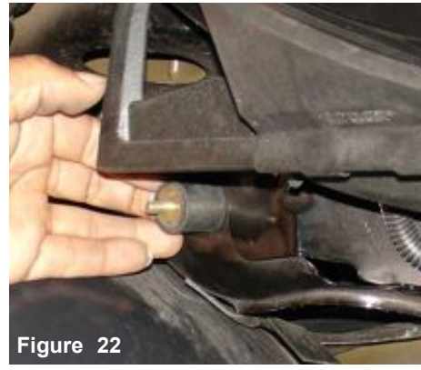
The vibra-mount is inserted into the bumper support frame. The nut and washer is lowered from the inside.