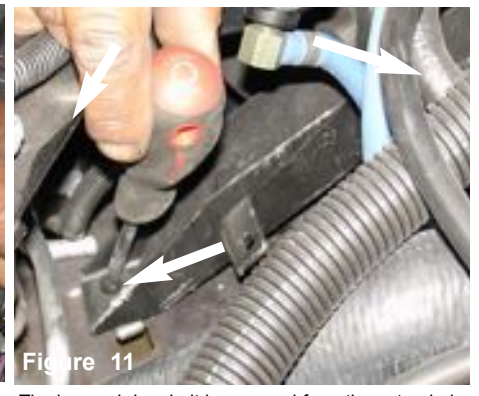
The lower air box bolt is removed from the extended brace.