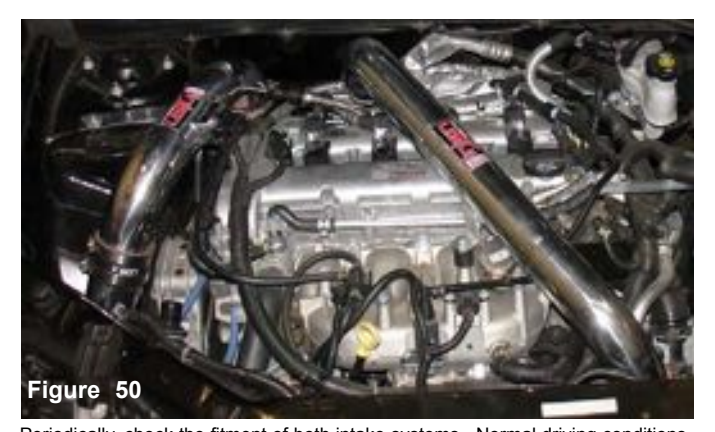
Periodically, check the fitment of both intake systems. Normal driving conditions may loosen nuts, bolts and clamps causing intakes to shift resulting in damage to automotive parts.