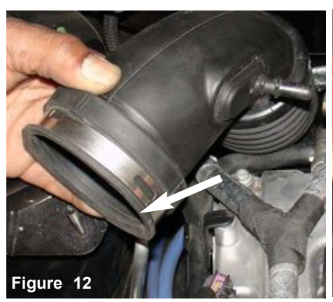
The turbo air inlet duct is disconnected from the air box cleaner