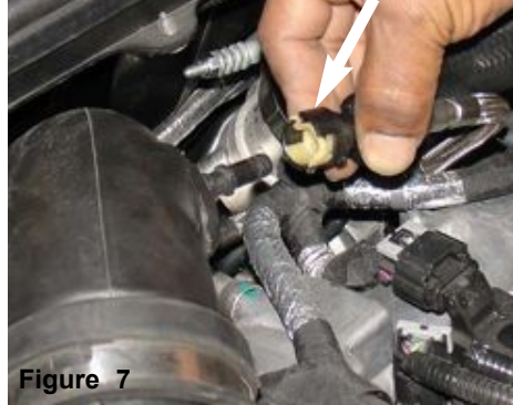
The vacuum port connector is removed from the air duct port as shown above.