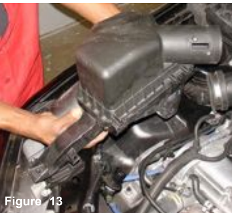
Once all three bolts and clamp has been removed or loosened, continue to pull the air box cleaner from the engine compartment.