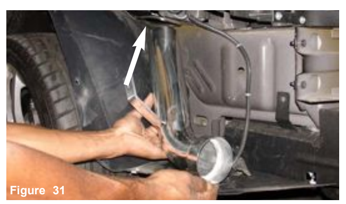
The secondary intake is inserted into the bumper corner and into the engine compartment.