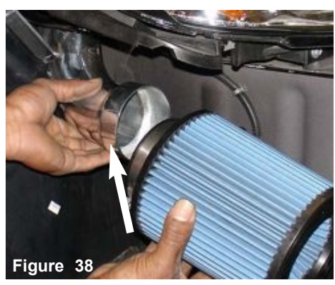
As soon as the filter stops are butted up against the filter stop, continue to tighten the filter clamp.