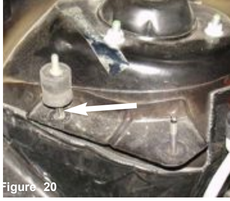
The male/female vibra-mount is now installed.