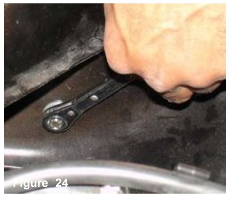
The m6 flange nut is tightened over the vibra-mount stud.