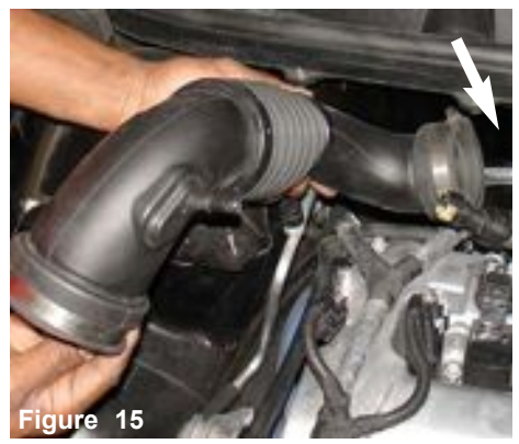
The lower air duct is now pulled out from the engine compartment.