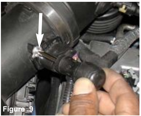
The two bolts are loosened and removed from the mass air flow sensor housing.