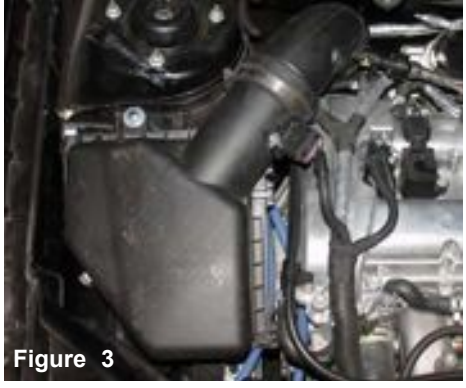
The stock air box and air duct to be removed. Prior to the installing, disconnect the negative battery terminal. The front bumper is removed prior to starting.