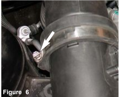
The turbo air inlet clamp is loosened in order to separate the air box from the air intake duct.