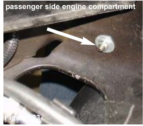
The m6 flange nut is placed over the vibra-mount stud located on the opposite side of the fender or inside of the engine compartment.