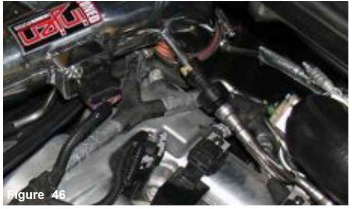
Check the harness clip and vacuum lines for proper fitment. Make sure there is good contact between the harness clip and mass air flow sensor, check for any possible vacuum leaks in the vacuum connections.