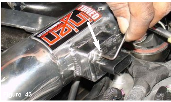
An allen wrench is used to fastened the m4 bolts to the machined adapter.