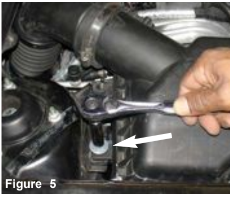
The second flange nut is loosened and removed.