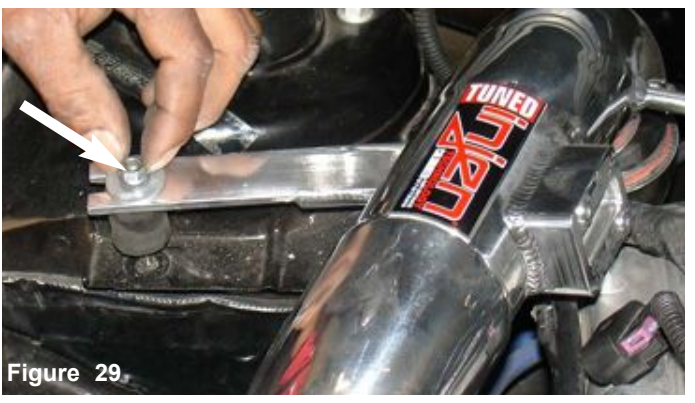
The m6 flange nut is tightened.