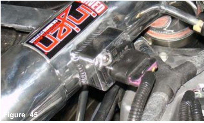
The mass air flow sensor and electrical harness clip are now installed.