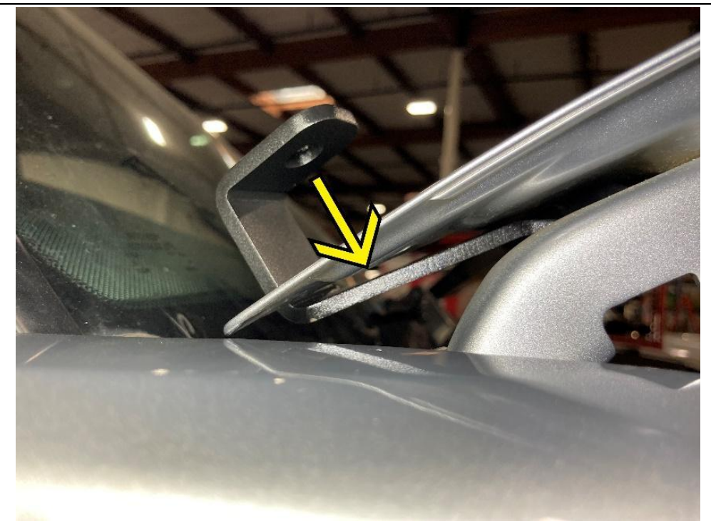
5. The ditch light brackets have slotted mounting holes to adjust for clearance. When aligning the bracket, the hood hinges, and the hood, make sure everything is aligned correctly.