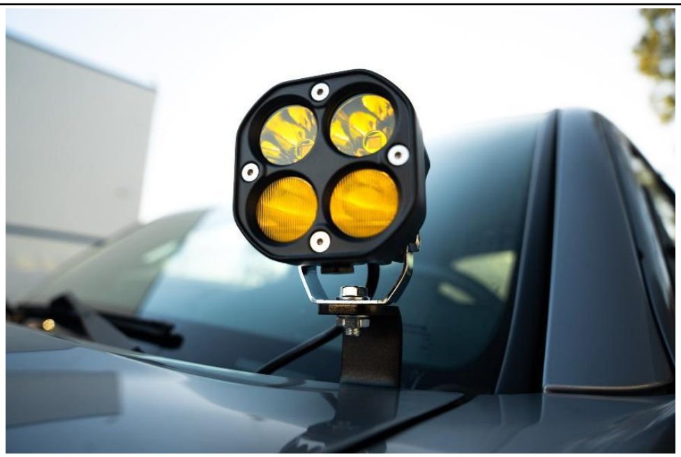
6. Repeat steps 2-5 on the driver's side. Once the brackets are installed, ditch lights can now be installed.

NOTE: Ditch lights are not included with this kit.