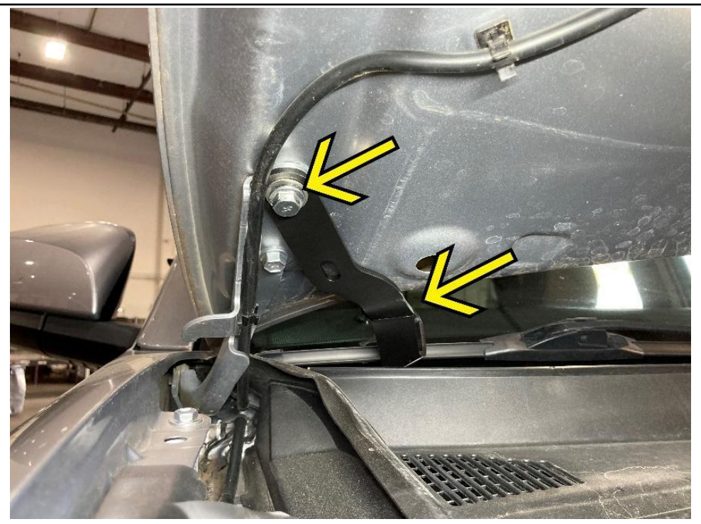
3. Install the right ditch light bracket using the provided M8 bolt and washer by hand tightening the bolt. Angle the bracket to provide clearance to remove the rear hood hinge bolt in the next step.