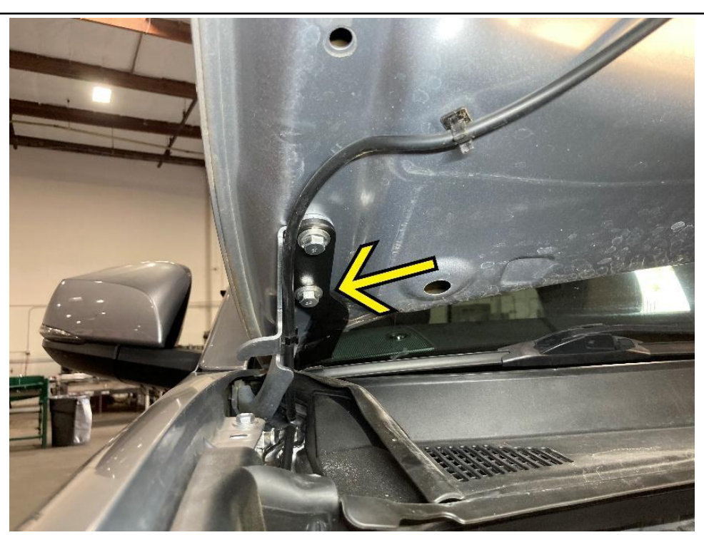
4. Remove the rear hood hinge bolt. Carefully rotate the bracket so that the rear ditch light bracket hole lines up with the rear hood hinge mounting hole. Secure the bracket with the provided M8 bolt and washer by hand tightening the bolt.