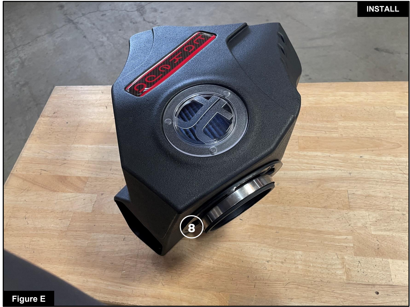
Refer to Figure E for Step 10

Step 10: Install the supplied air filter into the Takeda housing 8 by firmly pushing it into the housing until the air filter tabs lock into place. Install the clamp over the air filter flange, but do not tighten at this time.