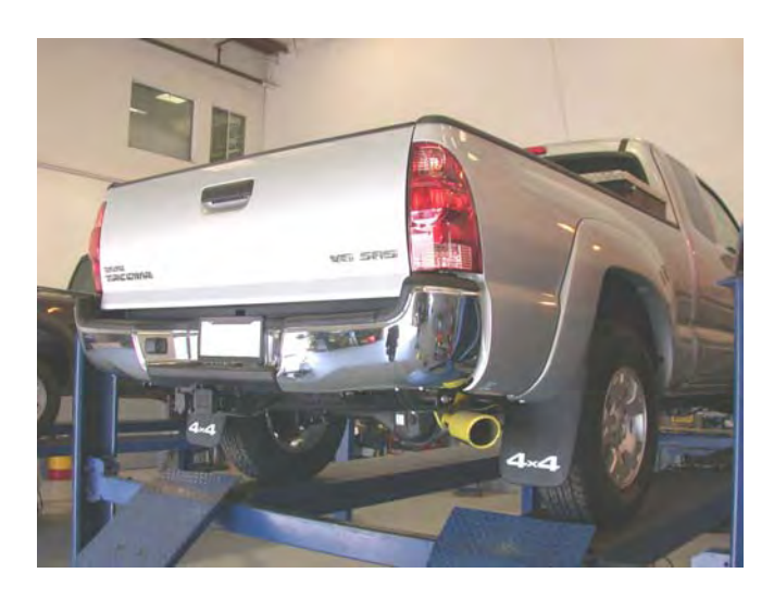
Congratulations!!! You have completed the installation of the world famous Borla Performance Stainless Steel Exhaust System.

Note: When you first start your vehicle after the installation of your new Borla Performance Exhaust System, there may be some smoke and fumes coming from the system. This is a protective oil based coating used in the manufacturing of mandrel bent performance exhaust tubing. This is not a problem and will disappear within a very short period of time after the exhaust has reached normal operating temperatures.