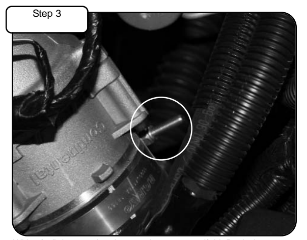
With 7/16" deep socket, loosen clamp on manifold. Push down on intercooler tube and disconnect from manifold. Remove stock intercooler tube from vehicle.