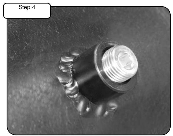
Install plugs in to 1/8" NPT ports with 3/16" hex key.