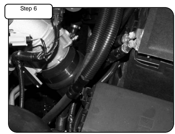
Install 3-1/2" hump coupler to manifold with clamps provided.