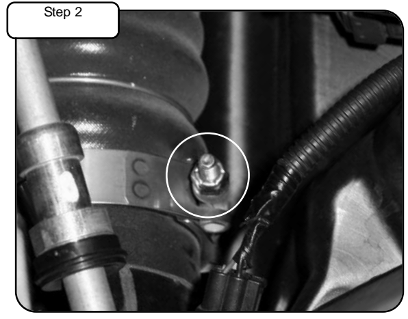
With 7/16" deep socket, loosen clamp on intercooler.