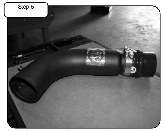
Install 3" hump coupler with clamps provided to new tube.