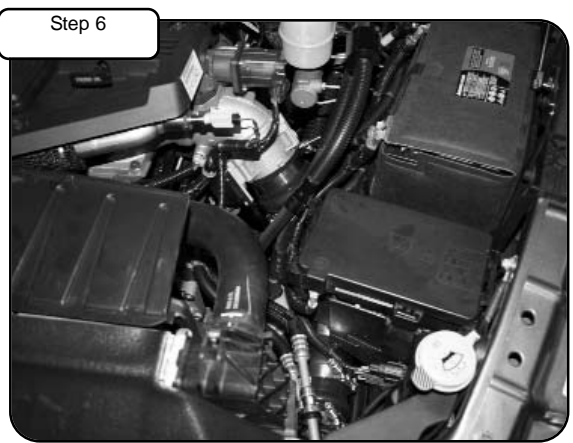
Install new tube and position into coupler on manifold. Tighten and torque all four clamps to 75 in-lbs. Check and tighten after 50 miles! Your Intercooler tube installation is now complete. Thank you for choosing aFe power!

Place the included CARB EO sticker on or near the Intercooler Tube on a smooth, clean surface. EO identification label is required to pass the Smog Check Inspection.