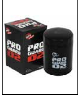
P/N: 79-12002 P/N: 44-LF001 To purchase any of the items above, view airflow charts, dyno graphs, photos, and video; please go to aFepower.com.