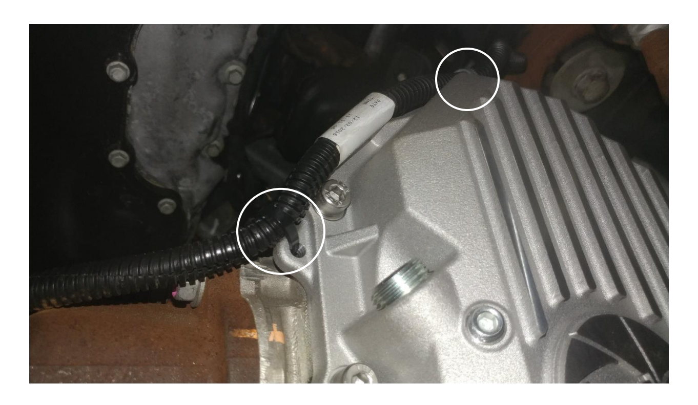
23. Reconnect the four wheel drive actuator wire to the left side and top of the aFe differential cover.

Note: If the clip broke during removal, you can use zip ties to re-secure the wire.