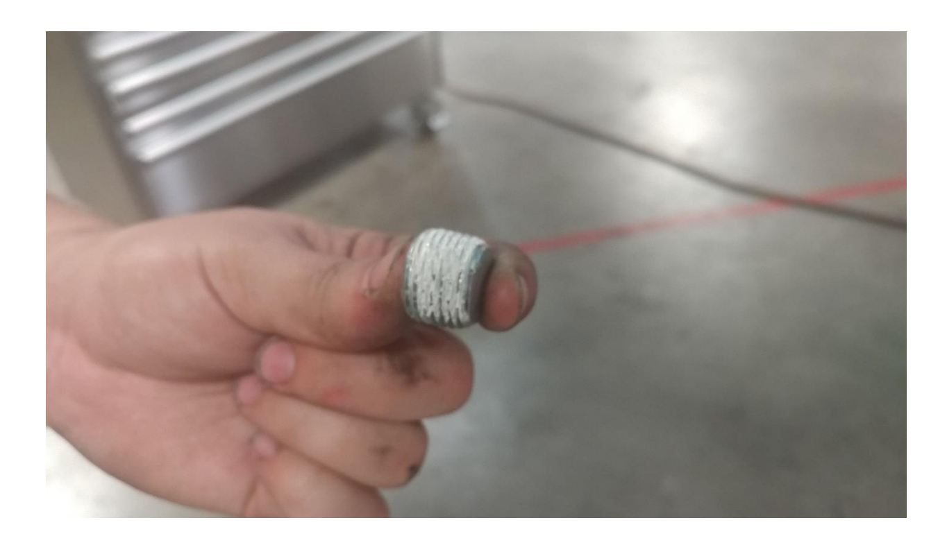
21. Apply Teflon pipe sealant to the threads of the supplied 1/2" NPT plug.