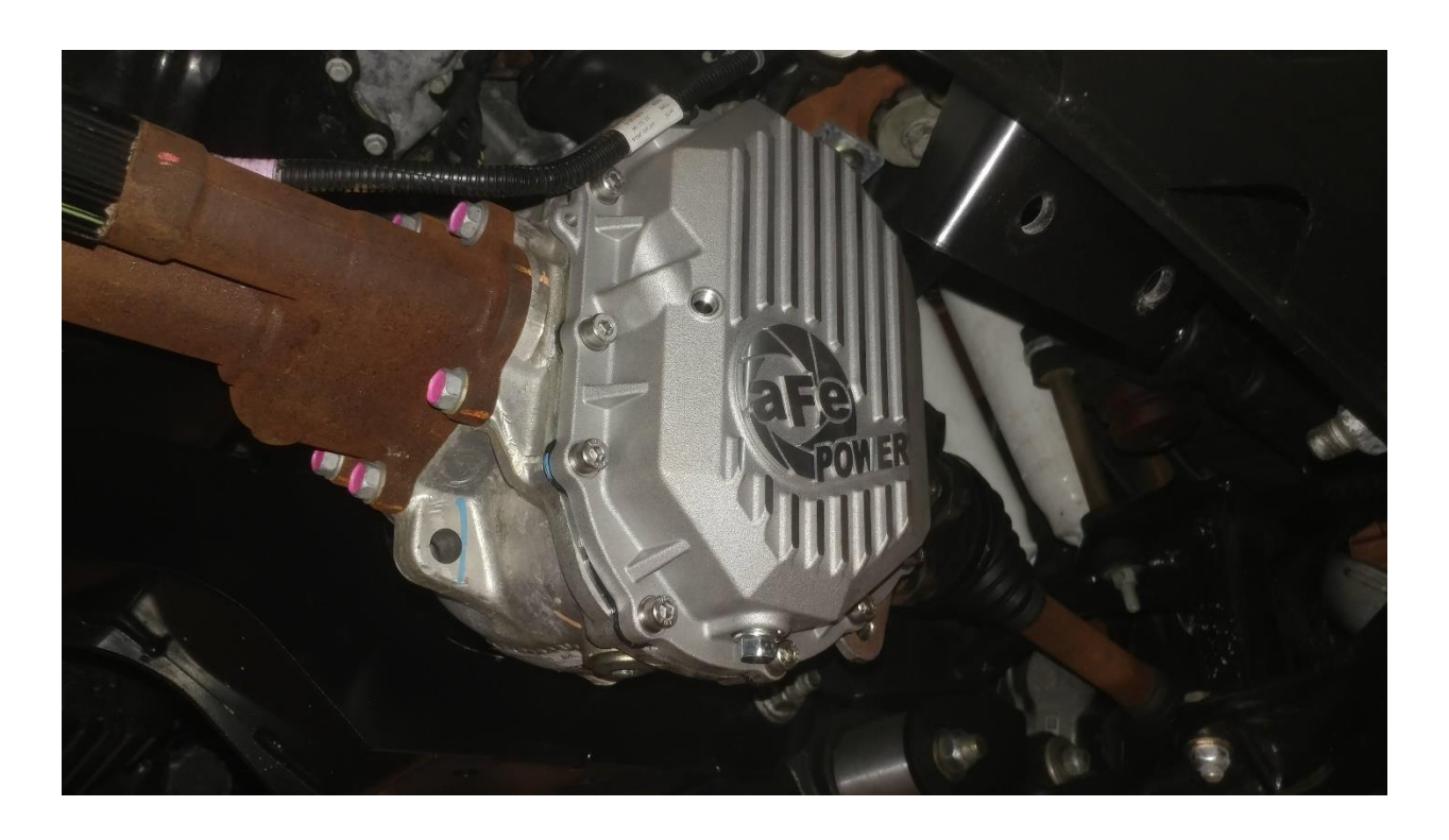
17.Install the supplied M12x1.25 drain plug and crush washer into the bottom of the cover.