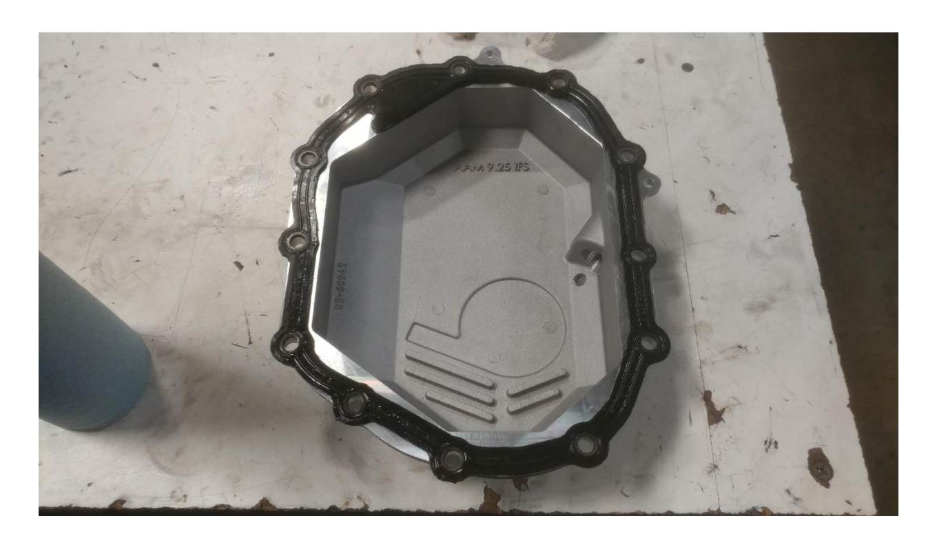
13. Align the OEM gasket and supplied aFe differential cover into position using the correct orientation shown above.