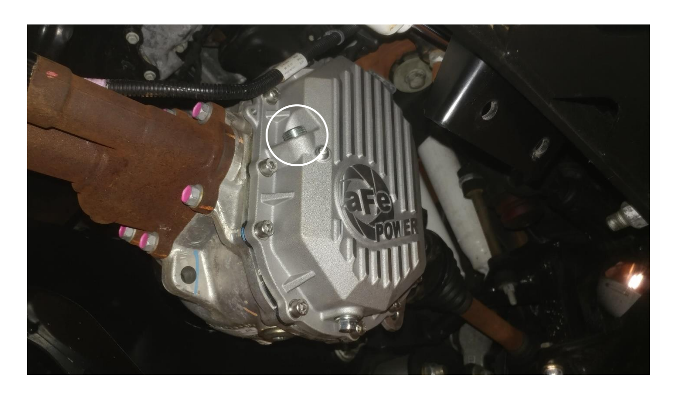
22.Install the 1/2" NPT plug into the fill port.