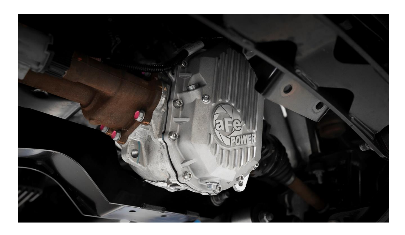
25. Your installation is complete.