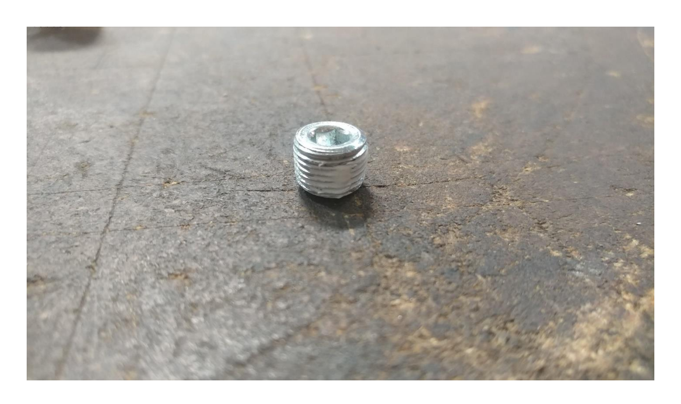
19. Apply Teflon pipe sealant to the threads of the supplied 1/8" NPT plug.