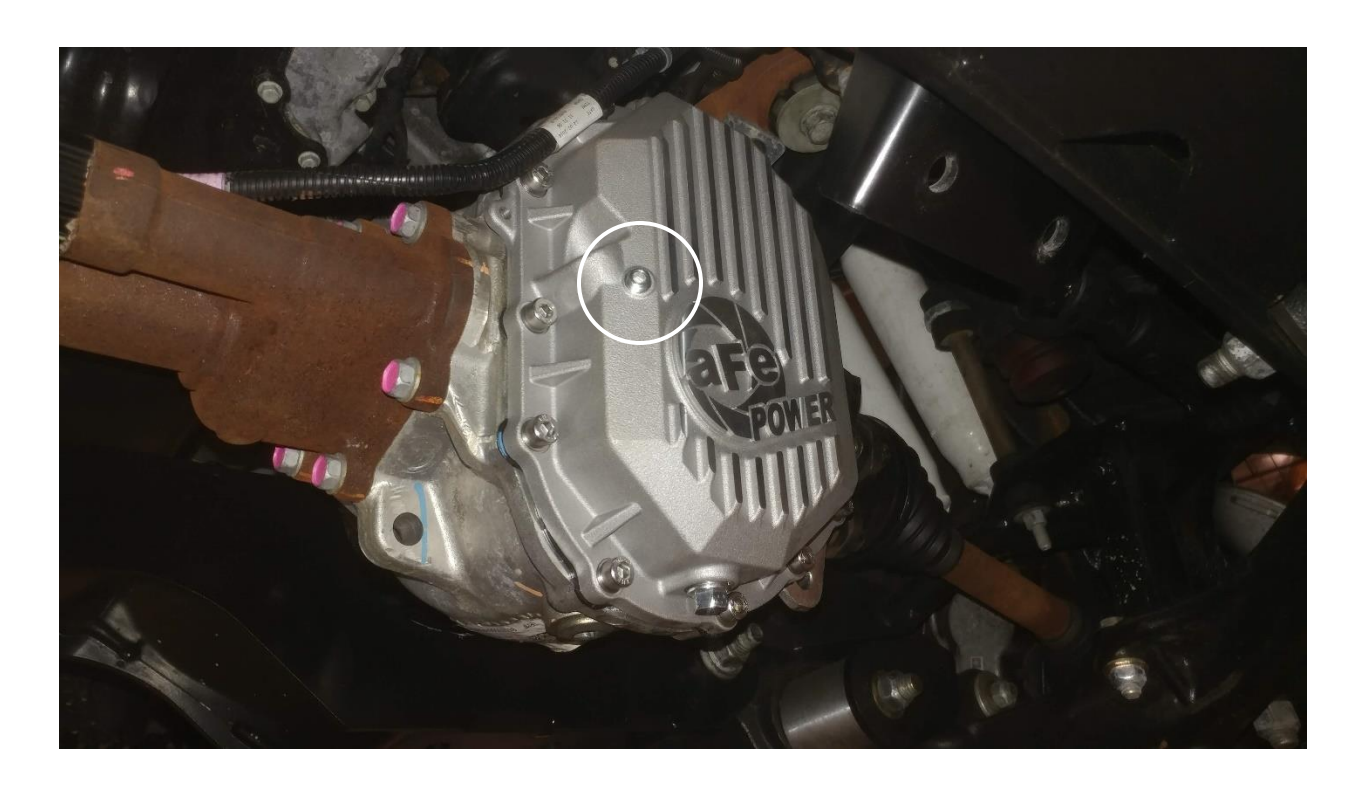
20.Install the 1/8" NPT plug into the side of the cover.