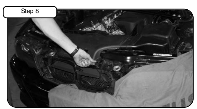
Replace inlet duct and retaining pins and enjoy your aFe DAS. NOTE: Place enclosed CARB EO sticker on or near the device on a smooth, clean surface. EO identification label is required to pass the smog test inspection.