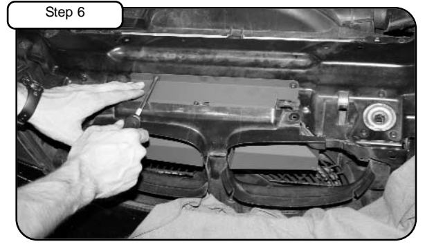
Replace the screws removed in step 3.