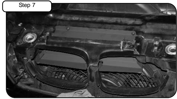
Scoops with screw installed.