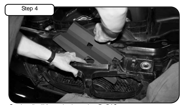
Gently pull grill forward to insert the aFe DAS.