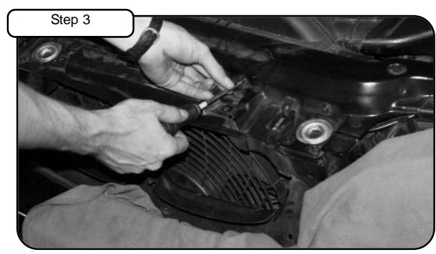
Remove retaining screws. (2)