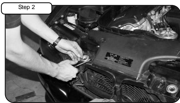
Remove inlet duct retaining pins and inlet duct.