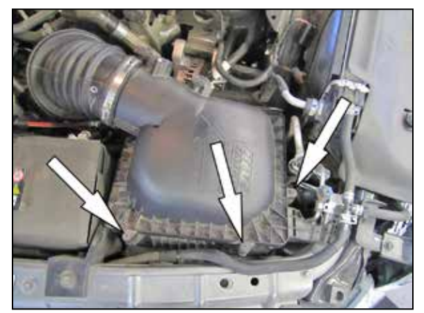
4. Remove the three screws securing air box lid.