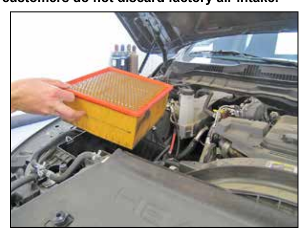
6. Remove filter from air box base.

NOTE: K&N Engineering, Inc., recommends that customers do not discard factory air intake.