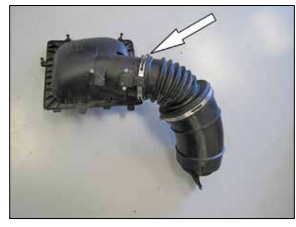
8. Loosen hose clamp securing intake resonator to air box lid and remove intake resonator from lid.