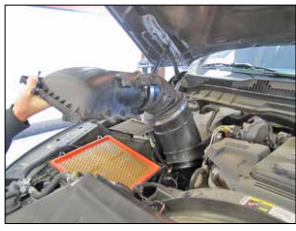
5. Remove air box lid and intake resonator from the vehicle.

NOTE: K&N Engineering, Inc., recommends that customers do not discard factory air intake.