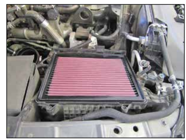
7. Install K&N® filter into air box base.