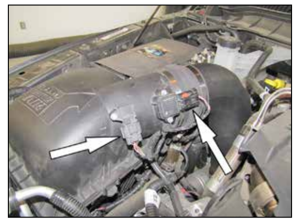
12. Reconnect the mass air sensor and temperature sensor electrical connections.