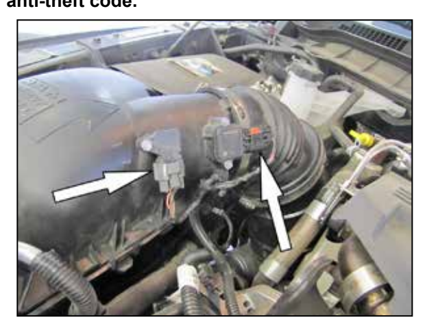
2. Disconnect mass air sensor and temperature sensor electrical connections, then unhook the wiring harness from air box.

NOTE: Disconnecting the negative battery cable erases pre-programmed electronic memories. Write down all memory settings before disconnecting the negative battery cable. Some radios will require an anti-theft code to be entered after the battery is reconnected. The anti-theft code is typically supplied with your owner's manual. In the event your vehicles anti-theft code cannot be recovered, contact an authorized dealership to obtain your vehicles anti-theft code.