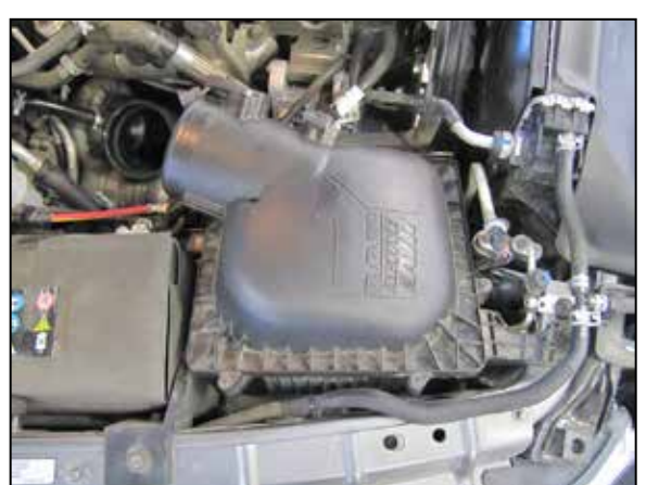
9. Reinstall air box lid onto air box base.