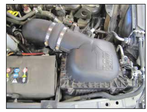
Reconnect the vehicle's negative battery cable. Double check to make sure everything is tight and properly positioned before starting the vehicle.