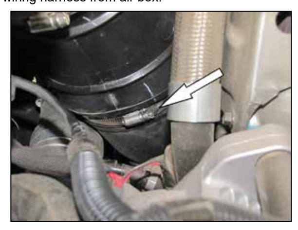
3. Loosen the hose clamp securing the intake resonator to turbo inlet hose.