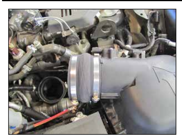
10. Install coupling hose (08695) onto air box assembly. Secure with provided hose clamp.