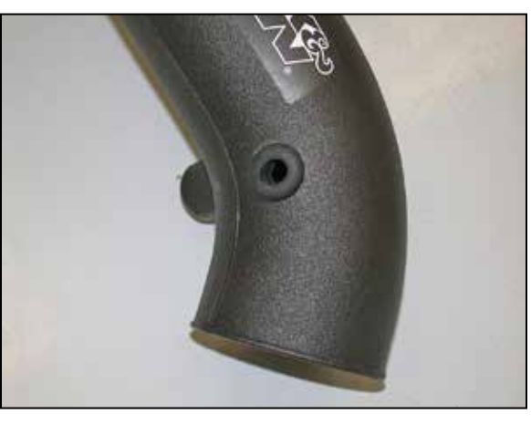
15. Install the provided rubber grommet into the K\&N^{\circledast} intake tube as shown.

14. Remove the air temperature sensor from the stock intake tube.