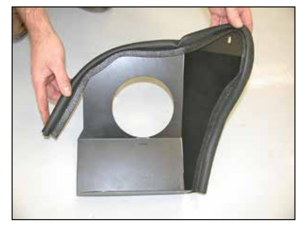
18. Install the provided edge trim onto the heatshield as shown.