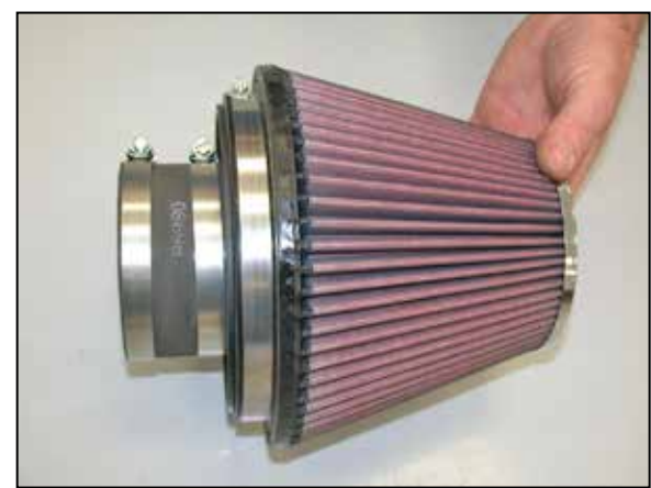
20. Install the provided silicone hose (08630) onto the filter adapter and secure with the provided hose

19. Install the radiused filter adapter into the K&N<sup>®</sup> air filter as shown. Secure with the provided hose clamp.