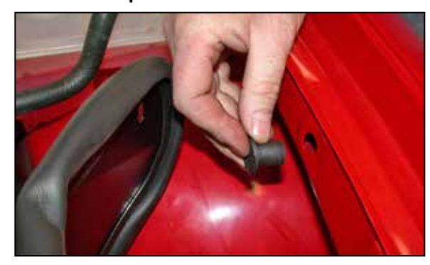
24. Install the threaded insert into inner fender as shown.

23. Secure the heatshield to the inner fender with the 6mm bolt provided. NOTE: Thread the 6mm bolt into the hole vacated in step #11.