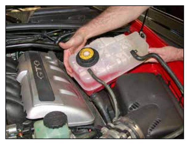
7. Pull the coolant reservoir up and away from the inner fender to release it from the retaining studs.