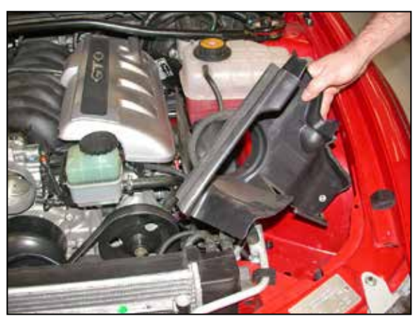
10. Lift up and pull out the air deflector from behind the head light