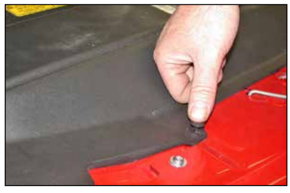
33. Reinstall the five radiator cover retaining clips removed in step #2.