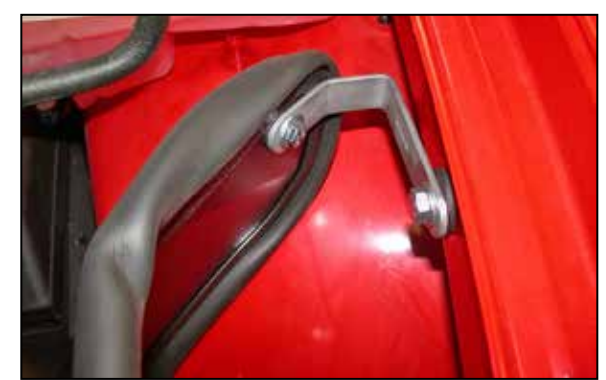
25. Install the heatshield bracket (#010062) onto the heatshield and inner fender and secure with the provided hardware.