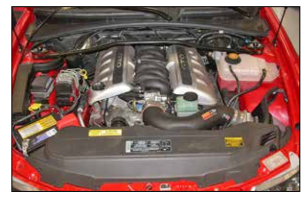
34. Reconnect the vehicle's negative battery cable. Double check to make sure everything is tight and properly positioned before starting the vehicle.

35. The C.A.R.B. exemption sticker, (attached), must be visible under the hood so that an emissions inspector can see it when the vehicle is required to be tested for emissions. California requires testing every two years, other states may vary.