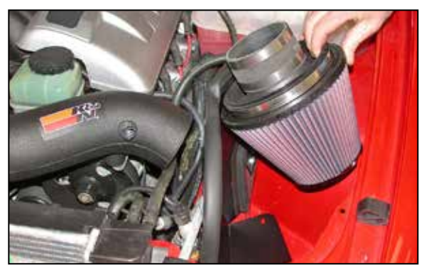
22. Set the heatshield assembly onto the inner fender, then set the air filter assembly between the heatshield and fender as shown.