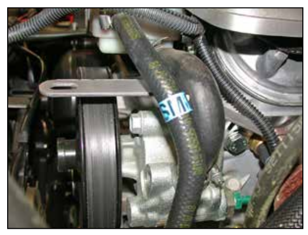
12. Install the tube bracket #010061 using the provided hardware.

NOTE: The 10mm mounting bolt threads into the threaded, unused hole in the cylinder next to coolant temperature sensor.