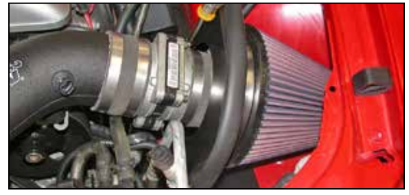
29. Install the air filter assembly onto the K&N<sup>®</sup> intake tube and secure with the provided hose clamp.