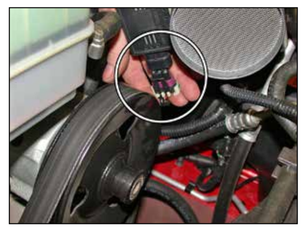
6. Release the mass air sensor electrical connection clip, then disconnect the electrical connection.

5. Loosen the two intake tube hose clamps, then remove the intake tube from the vehicle.