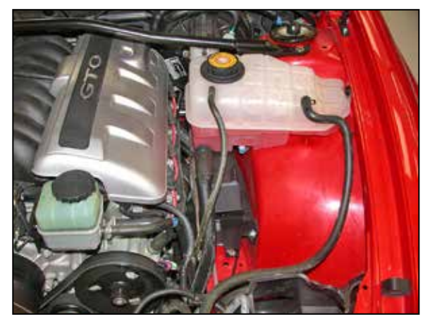
9. Reinstall the coolant reservoir onto the mounting studs as shown.

NOTE: K&N Engineering, Inc., recommends that customers do not discard factory air intake.