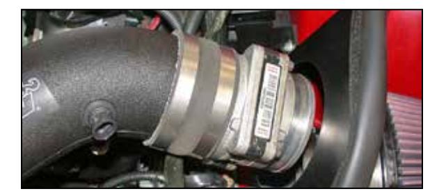
28. Install the mass air sensor assembly onto the K\&N^{\otimes} intake tube and secure with the provided hose clamp.

NOTE: There is an arrow on the side of the mass air sensor which shows direction of air flow through the sensor and points the intake tube side of the sensor.