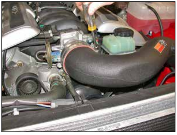
17. Install the K&N<sup>®</sup> intake tube onto the throttle body as shown and secure with the provided hose clamp, using the 8mm bolt provided. Secure the K&N<sup>®</sup> intake tube onto the mounting bracket installed in step #12.