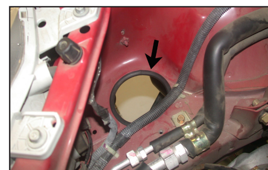
23. Install the provided edge trim onto the hole in the inner fender as shown.