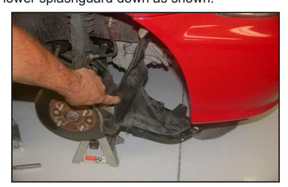
10. Remove the 2 plastic rivets and the 1 screw on the inner fender valance, then, pull the valance down as shown.