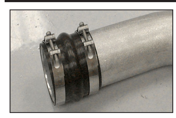
25. Install the silicone hose and hose clamps onto the K&N® cold air tube as shown, but do not tighten at this time.