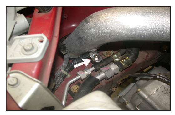
28. Secure the bracket to the rubber mounted stud using the provided hardware as shown, but do not tighten at this time.