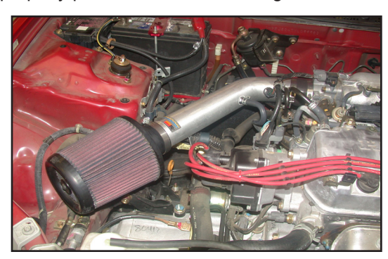
35. This K&N® Typhoon® kit has been designed to be used in two different configurations. In the case of inclement weather, the cold air tube can be removed and the air filter can be clamped onto the intake tube located in the engine compartment to avoid the possibility of ingesting water into the

NOTE: If you have any concerns, return the vehicle to stock using the factory equipment.