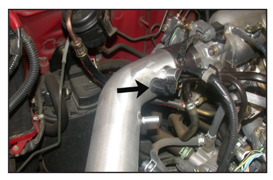
21. Insert the air temperature sensor into the grommet on the K&N® short ram tube as shown.