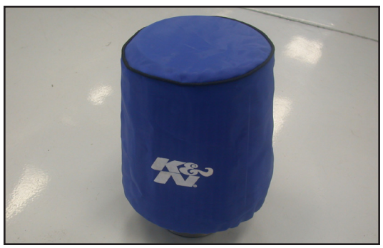
29. Install the K&N® Drycharger® onto the K&N air filter as shown.

NOTE: Please be aware the Drycharger® is water repellent, not water proof. Depending on conditions and usage the water repellent treatment is good for 1 to 2 years. See the parts list to reorder a new Drycharger® if necessary.