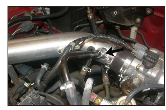
20. Insert the crankcase vent hard line into the vent on the K&N® Typhoon® short ram tube as shown.