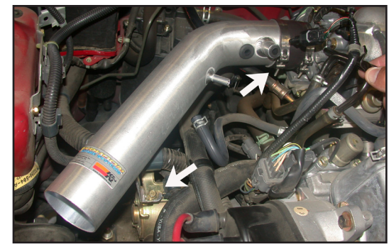
17.On automatic transmission vehicles (manual transmission vehicles go to the step 18) slide the tube into the silicone hose, then, slide the tube bracket in between the starter bracket and the wire harness bracket, then, secure it using the stock bolt from step 16.