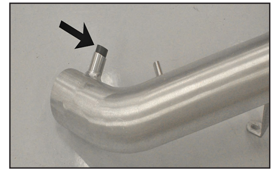
13. Install the provided silicone hose into the vent on the K&N® Typhoon® short ram tube as shown, mark, the excess hose and trim to fit.

NOTE: Before installing the silicone hose, inspect the inside of the tube for any debris, then clean the inside out with water and a towel. Inspect the tube one more time before proceeding to the next step.