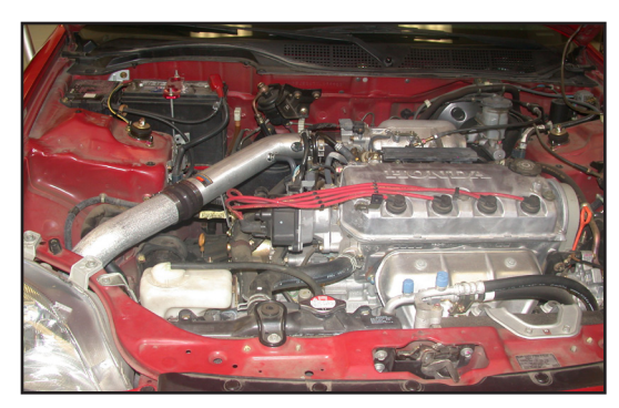
34. Reconnect the vehicle's negative battery cable. Double check to make sure everything is tight and properly positioned before starting the vehicle.