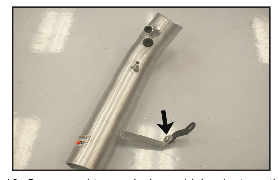
18. On manual transmission vehicles (automatic transmission vehicle go to step 20) install the provided "Z" bracket onto the tube bracket using the provided hardware as shown.