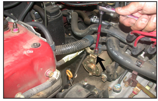
16. Remove the bolt that secures the wire harness bracket to the starter as shown.