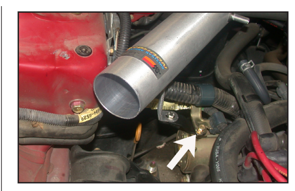
19. Slide the intake tube into the silicone hose on the throttle body, then, slide the "Z" bracket in between the starter bracket and the wire harness bracket, then, secure it using the stock bolt removed in step 16.