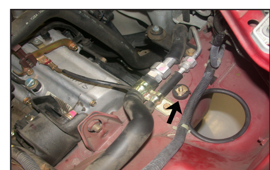
24. Insert the rubber mounted stud into the threaded hole on the inner fender as shown.