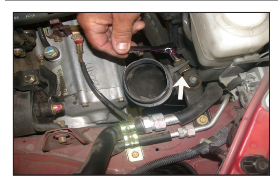
7. Remove the bolt that secures the air inlet tube to the inner fender as shown.