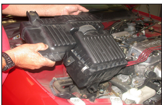
6. Pull firmly upwards to release the air cleaner from the lower grommet, then, remove the air cleaner assembly as shown.

NOTE: K&N Engineering, Inc., recommends that customers do not discard factory air intake.