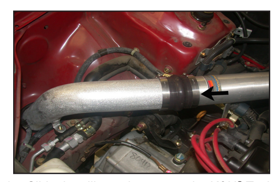
27. Slide the silicone hose over the K&N® Typhoon® short ram tube as shown, but do not tighten at this time.