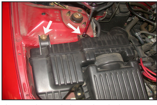
5. Loosen the two bolts on the air cleaner assembly as shown.