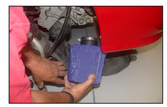
30. From underneath the vehicle install the air filter onto the cold air tube and secure using the provided hose clamp.

NOTE: Please be aware the Drycharger® is water repellent, not water proof. Depending on conditions and usage the water repellent treatment is good for 1 to 2 years. See the parts list to reorder a new Drycharger® if necessary.