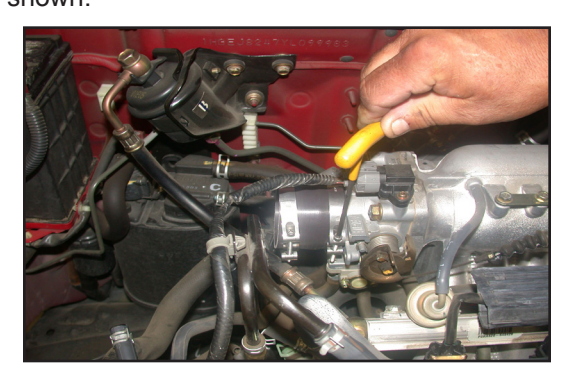
12. Install the silicone hose and hose clamps onto the throttle body and tighten as shown.