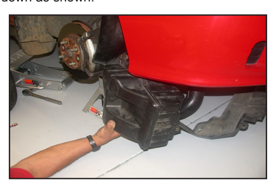
11. Remove the two bolts that secure the resonator to the inner fender, then, remove the resonator as