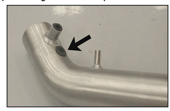
14. Install the provided grommet into the hole on the K&N® Typhoon® short ram tube as shown.

NOTE: Before installing the silicone hose, inspect the inside of the tube for any debris, then clean the inside out with water and a towel. Inspect the tube one more time before proceeding to the next step.