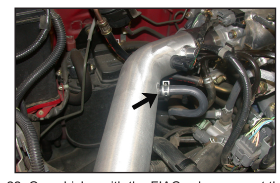
22. On vehicles with the FIAC valve connect the hose to the vent on the K&N® Typhoon® short ram tube as shown.