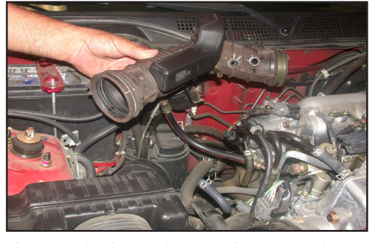
4. Loosen the hose clamp at the throttle body, then, remove the stock intake hose from the vehicle as shown.