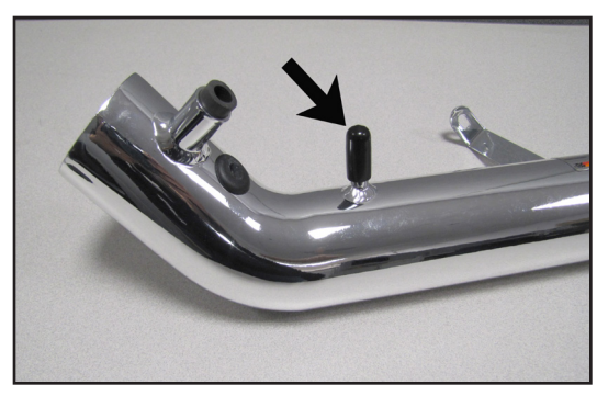
15. On models without the FIAC valve, plug the vent on the K&N® Typhoon® short ram tube with the provided cap plug.