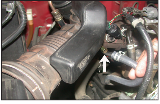
3. On vehicles with the FIAC valve disconnect the hose from the stock intake tube as shown.