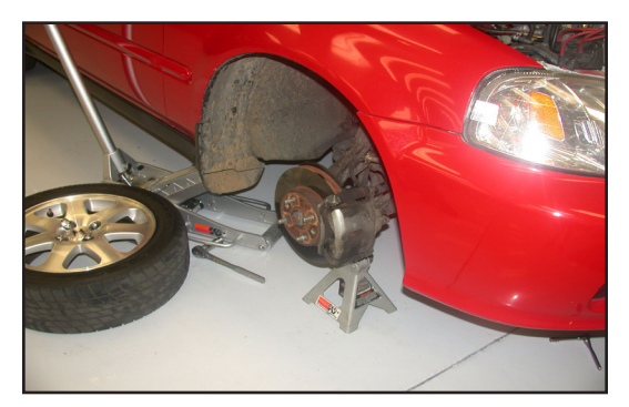
8. Raise the vehicle up and support it with jack stands, then, remove the passenger side tire as shown.