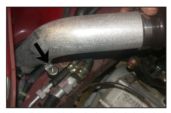
26.Install the cold air tube into the hole in the inner fender, then, line up the bracket with the rubber mounted stud as shown.