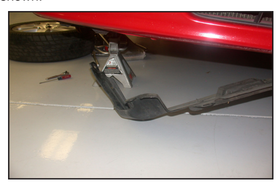
9. Remove the four plastic rivets/bolts, then, pull the lower splashquard down as shown.