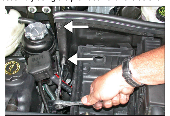
14. Remove the two stock bolts on the bulkhead as shown.

NOTE: Some models may contain two, T30 Torx screws.