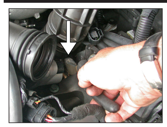
10. Using a pair of dikes or pliers, unclip the stock hose clamp on the stock intake tube at the throttle body as shown.