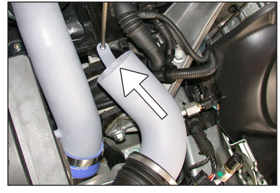
28. Install the new air inlet tube into the stock air inlet duct, then, line up the bracket with the hole on the lower air cleaner assembly and secure with the provided screw as shown.

NOTE: Before installing the inlet tube, inspect the inside of the tube for any debris, then clean the inside out with water and a towel. Inspect the tube one more time before proceeding to the next step.