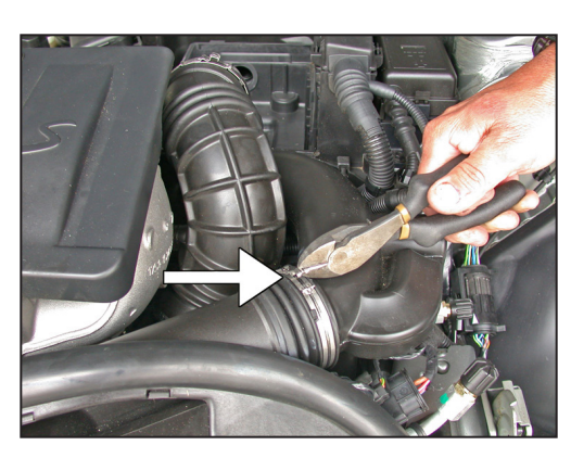
7. Using a pair of dikes or pliers unclip the hose clamp on the air inlet duct as shown.