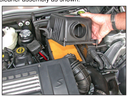
6. Slide the upper air cleaner assembly backwards, then, pull upward to remove the upper air cleaner assembly as shown.