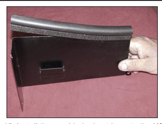
15. Install the provided edge trim onto the K&N<sup>®</sup> heat shield as shown.

NOTE: Some models may contain two, T30 Torx screws.