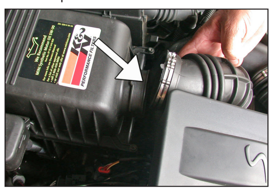
3. Pull the stock intake tube off the air cleaner as