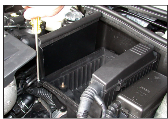
18. Tighten all hardware on the heat shield as shown.