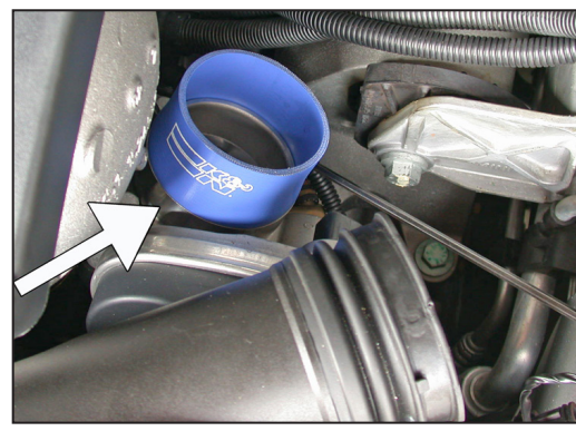
19. Install the silicone hose and the provided hose clamp onto the throttle body and tighten as shown.