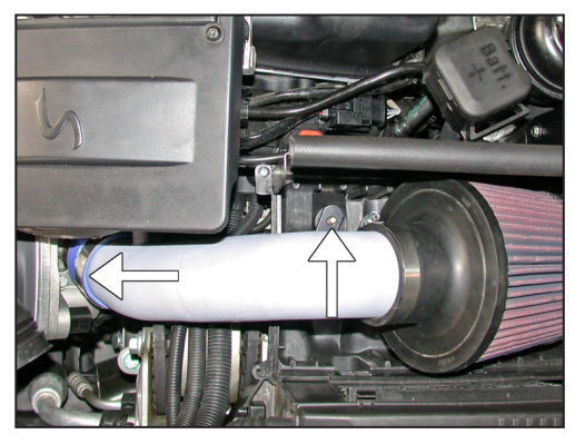
23. Install the intake tube assembly into the silicone hose at the throttle body, then, line up the bracket with the rubber mounted stud as shown.