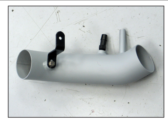
20. Secure the provided "Z" bracket onto the threaded boss on the K&N® intake tube using the provided hardware as shown.

NOTE: Plastic NPT fittings are easy to cross thread. Install the vent fitting "hand" tight, then turn it two complete turns with a wrench.