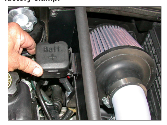
26. Slide the battery terminal onto the locating tab on the heat shield as shown.

NOTE: On vehicles equipped with the second vent line, connect the vent line to the fitting installed during step #19A. and secure with the factory clamp.