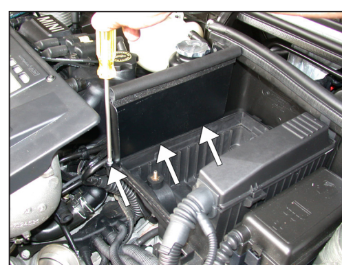
16. Install the heat shield onto the top edge of the lower air cleaner assembly, then, secure the front tab of the heat shield to the lower air cleaner assembly using the provided screw as shown.