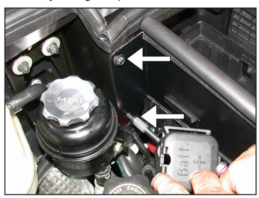
17. Using the two screws from step 14, secure the heat shield to the bulkhead as shown.