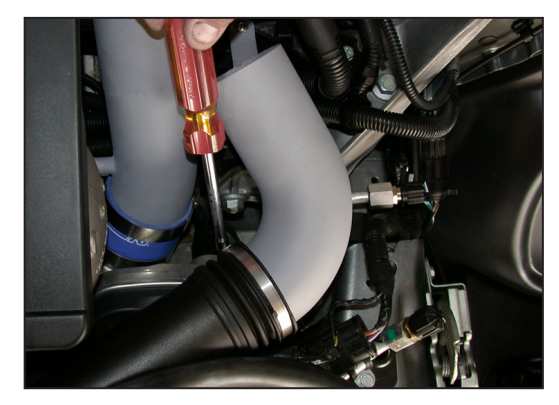
29. Tighten the provided hose clamp on the air inlet duct as shown.

NOTE: Before installing the inlet tube, inspect the inside of the tube for any debris, then clean the inside out with water and a towel. Inspect the tube one more time before proceeding to the next step.