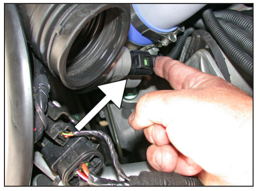
27. Reconnect the throttle body electrical connection as shown.