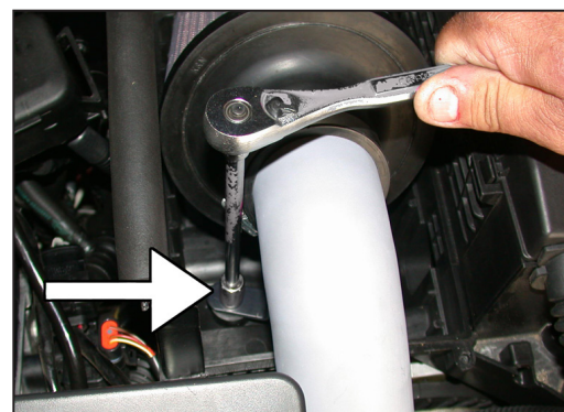
24. Using the provided hardware secure the "Z" bracket to the rubber mounted stud as shown. NOTE: Adjust for best fit and clearance, then, tighten all hose clamps and hardware.