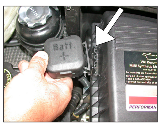
4. Pull upward to remove the battery terminal from the side of the air cleaner as shown.