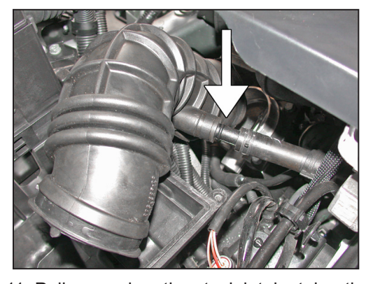
11. Pull upward on the stock intake tube, then, using a pair of pliers disconnect the stock crank case vent hose from the stock intake tube as shown.

NOTE: Some models may be equipped with a second vent line, which will also need to be disconnected.