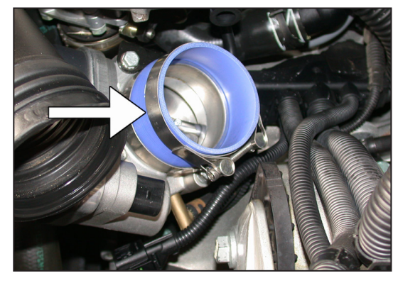
22. Install the hose clamp onto the silicone hose as shown.

NOTE: Drycharger® air filter wrap; part # RX-4990DK is available to purchase separately. To learn more about Drycharger® filter wraps or look up color availability please visit http://www.knfilters.com®.