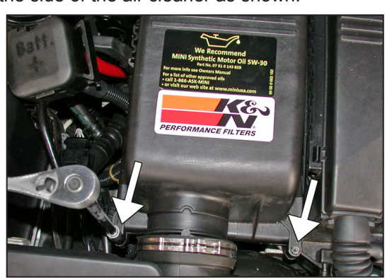
5. Loosen the two bolts on the front of the air cleaner assembly as shown.