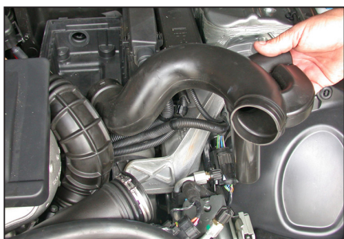
8. Remove the air cleaner inlet duct as shown.