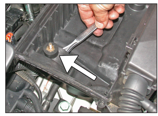
13. Secure the provided rubber mounted stud to the air inlet flange on the lower air cleaner assembly using the provided hardware as shown.