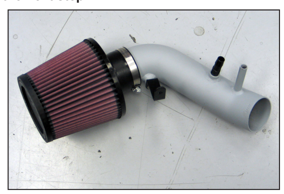
21. Install the K&N® air filter onto the K&N® intake tube and tighten with the provided hose clamp as shown.

NOTE: Before installing the "Z" bracket, inspect the inside of the tube for any debris, then clean the inside out with water and a towel. Inspect the tube one more time before proceeding to the next step.