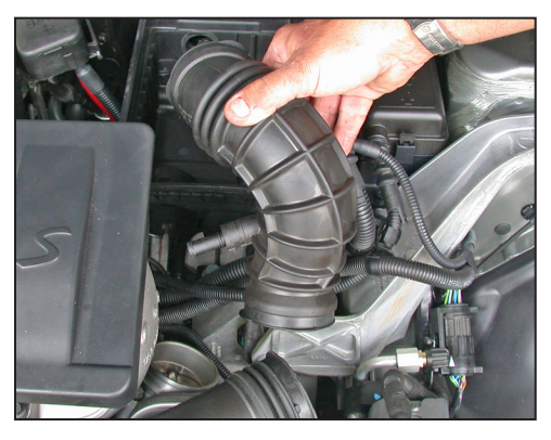
12. Remove the stock intake tube as shown. NOTE: K&N Engineering, Inc., recommends that customers do not discard factory air intake.

NOTE: Some models may be equipped with a second vent line, which will also need to be disconnected.