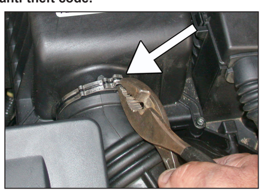
2. Using a pair of dikes or pliers unclip the stock hose clamp at the air cleaner as shown.

NOTE: Disconnecting the negative battery cable erases pre-programmed electronic memories. Write down all memory settings before disconnecting the negative battery cable. Some radios will require an anti-theft code to be entered after the battery is reconnected. The anti-theft code is typically supplied with your owner's manual. In the event your vehicles' anti-theft code cannot be recovered, contact an authorized dealership to obtain your vehicles anti-theft code.