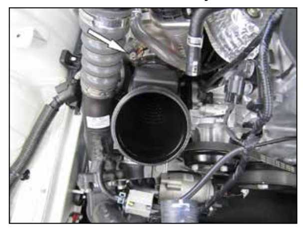
6. Loosen the hose clamp that secures the turbo inlet tube to the turbo and then remove the tube from the vehicle.

5. Remove the three bolts that secure the factory lower air filter housing to the inner fender and then remove the housing from the vehicle. NOTE: K&N Engineering, Inc., recommends that customers do not discard factory air intake.