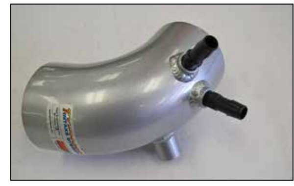
13. Install the two provided NPT fittings into the intake tube as shown.

NOTE: Some trimming of the edge trim will be necessary.