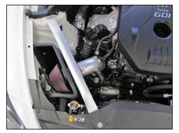
16. Reinstall the chassis brace and secure with the factory hardware.

15. Connect the vent lines to the K&N<sup>®</sup> intake tube as shown.