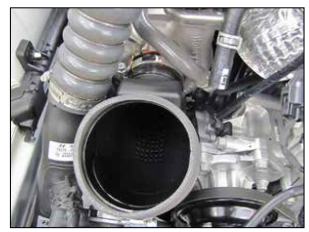
8. Reinstall the turbo inlet tube clocked slightly left from the factory location (The locating tab will be positioned just left on the turbo from factory) and secure with the provided hose clamp. Do not completely tighten the hose clamp at this time.