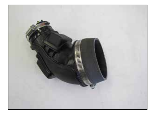
7. Install the provided coupler (08615) onto the turbo inlet tube and secure with the provided hardware.