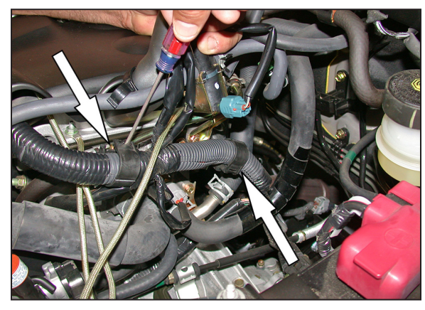
12. Unclip the two plastic wire harness clips and slide the wire harness forward to gain more slack for the mass air sensor electrical connection as shown.