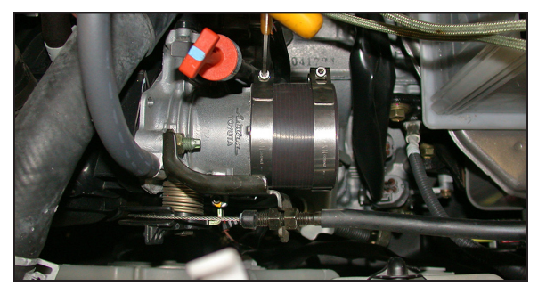
16. Install the silicone hose and hose clamps onto the throttle body and tighten as shown.

15. Remove the plastic rivet from the inner fender valance as shown.