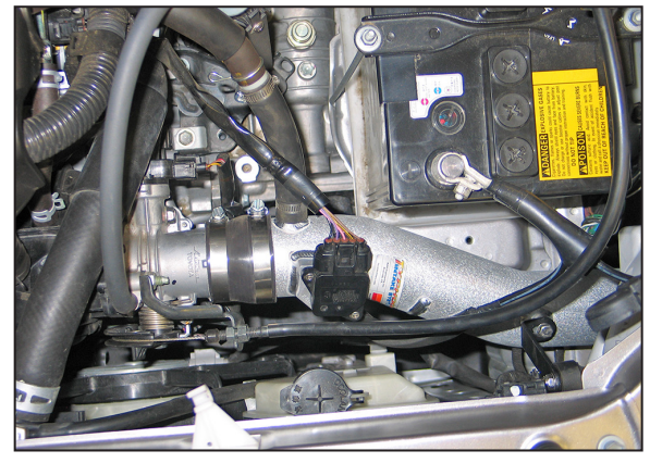
33. Reconnect the vehicle's negative battery cable. Double check to make sure everything is tight and properly positioned before starting the vehicle.

34. The C.A.R.B. exemption sticker, (attached), must be visible under the hood so that an emissions inspector can see it when the vehicle is required to be tested for emissions. California requires testing every two years, other states may vary.