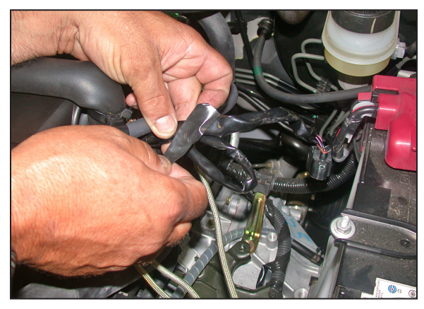
11. Remove the tape that binds the three wire harnesses together.