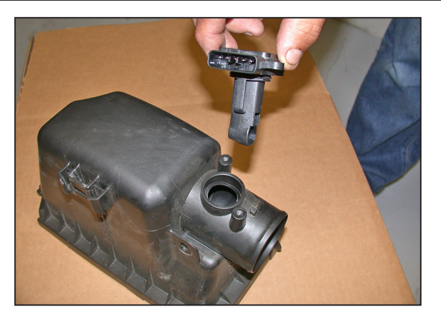
21. Remove the mass air sensor from the upper air cleaner assembly as shown.