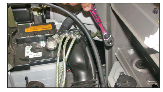
8. Loosen and remove the bolt that secures the air inlet tube to the radiator core support as shown.

7. Remove the three screws that secure the lower air cleaner assembly as shown.