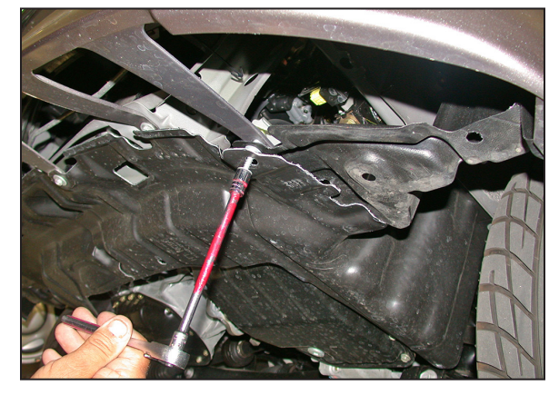
14. Remove the two screws that secure the inner fender valance.