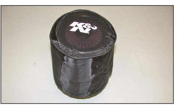
30. Install the K&N<sup>®</sup> Drycharger onto the K&N<sup>®</sup> Air filter as shown.