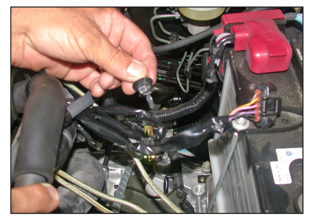
10. Remove the plastic wire harness clip that secures the mass air wire to other miscellaneous wires as shown.

NOTE: K&N Engineering, Inc., recommends that customers do not discard factory air intake.