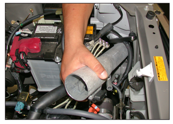
23. Slide the K&N<sup>®</sup> Typhoon<sup>®</sup> cold air tube into the area directly below the headlight as shown.

NOTE: Before installing the mass air sensor, inspect the inside of the tube for any debris, then clean the inside out with water and a towel. Inspect the tube one more time before proceeding to the next step.