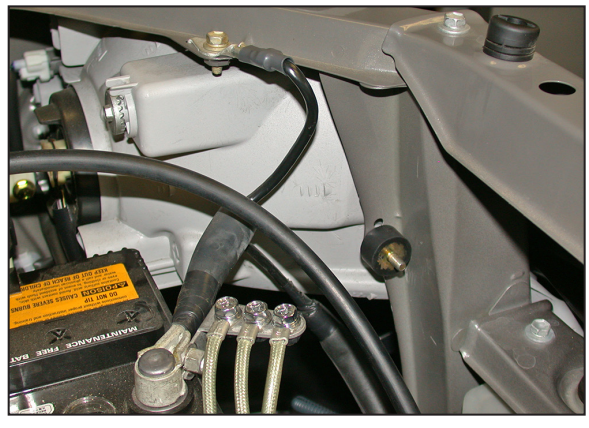
19. Install the provided rubber mounted stud into threaded hole on the radiator core support from step 8.