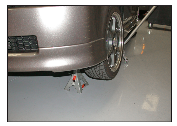
13. Raise the vehicle up and support it with jack stands as shown.