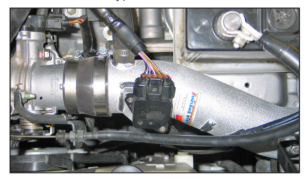
29. Reconnect the mass air sensor electrical connection as shown.

28. Slide the hose mender into the stock crank case vent hose, then, connect the other end to the vent on the K&N<sup>®</sup> Typhoon<sup>®</sup> cold air tube as shown.