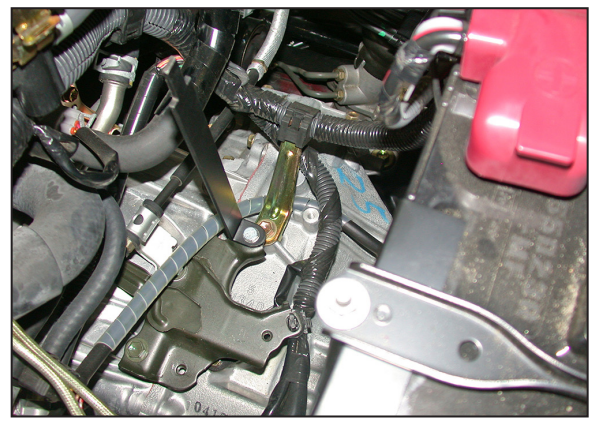
17. Using the provided hardware secure the provided large "L" bracket to the original air cleaner mounting bracket as shown.