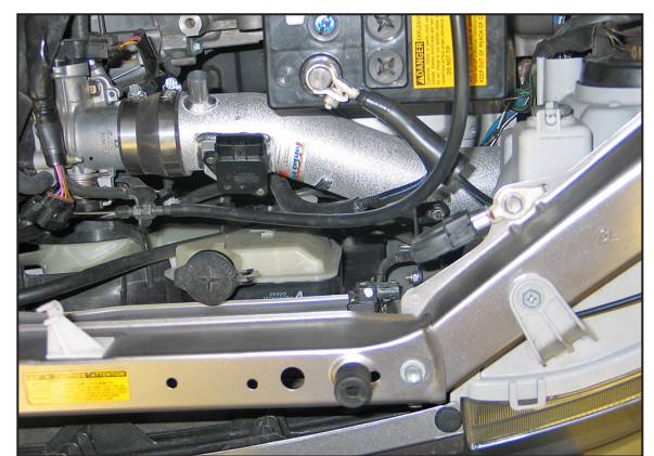
24. Rotate the end of the K&N<sup>®</sup> Typhoon<sup>®</sup> intake tube downward, then slide the other end of the tube into the silicone hose on the throttle body as shown