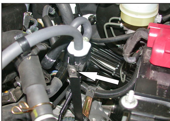
18. Slide the PWM vacuum switching valve onto the "L" bracket from the previous step. NOTE: On the '06 & later models, using the supplied washer and bolt, secure the PWM vacuum switching valve to the "L" bracket as shown.