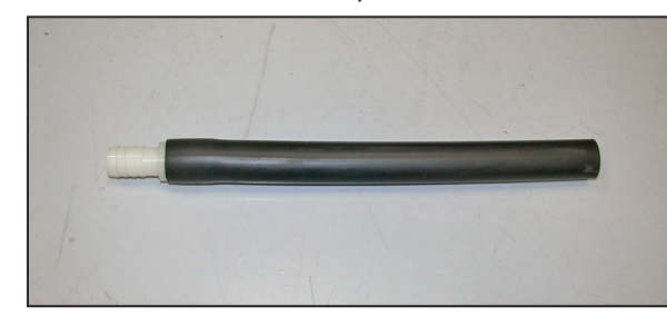
27. Install the provided hose mender into the provided silicone hose as shown.