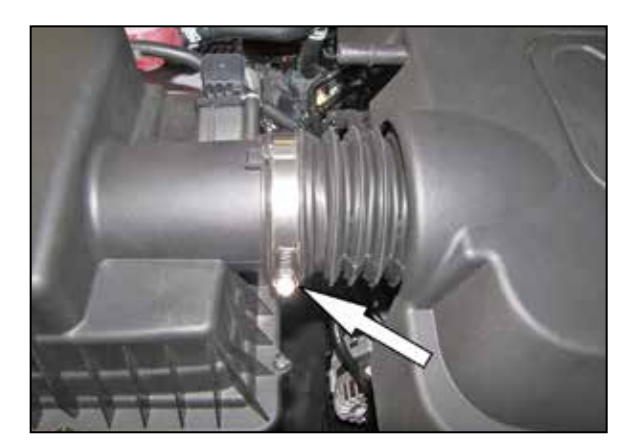
4. Loosen the hose clamp that secures the intake tube to the air filter housing.