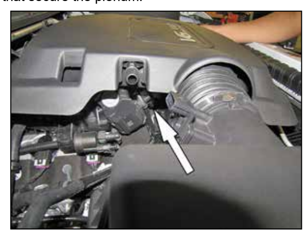
7. Loosen the hose clamp securing the intake plenum to the throttle body.

NOTE: This clamp is under the cover and accessed from the passenger side of the vehicle.