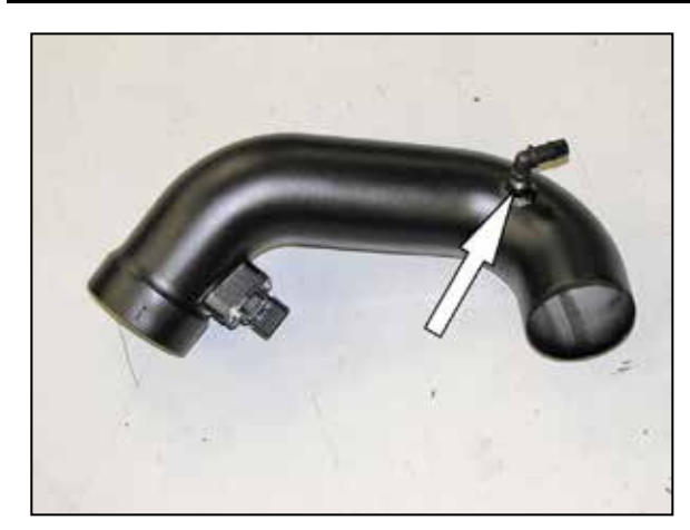
20. Install the provided 90° vent fitting into the K&N® intake tube as shown.

NOTE: Plastic NPT fittings are easy to cross thread. Install the vent fitting "hand" tight, then turn it two complete turns with a wrench.