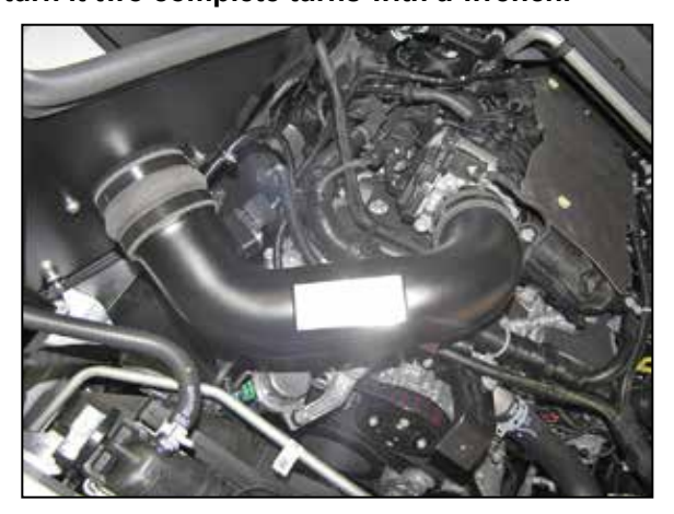
21. Install the K&N® intake tube into the hump coupler and then into the step coupler at the throttle body, adjust the tube for best fit and then secure with the provided hose clamps.

NOTE: Plastic NPT fittings are easy to cross thread. Install the vent fitting "hand" tight, then turn it two complete turns with a wrench.