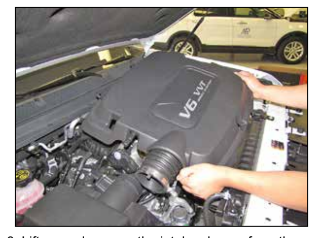
8. Lift up and remove the intake plenum from the engine.

NOTE: This clamp is under the cover and accessed from the passenger side of the vehicle.