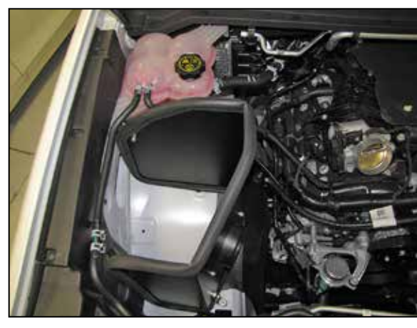
15. Install the heat shield so that the brackets set onto the coolant reservoir stud and the air filter housing mounting stud then secure the heat shield with the factory mounting nuts removed earlier.

NOTE: This nut will be reused in the next step.