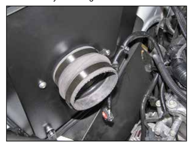
16. Install the provided hump coupler (06899) onto the filter adapter and secure with the provided hose clamp.