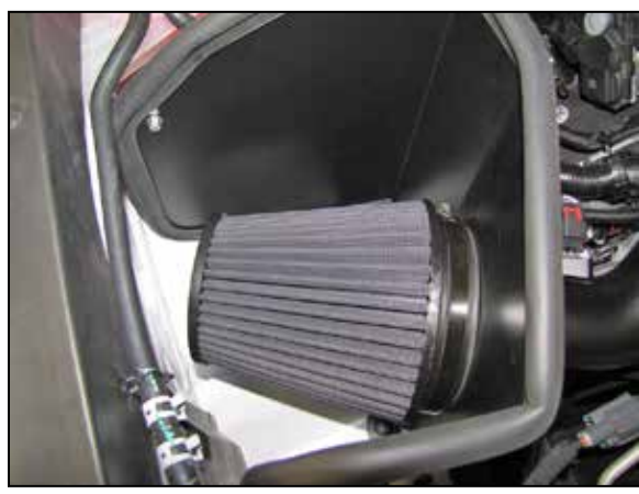
25. Install the K&N® air filter and secure with the provided hose clamp.

NOTE: Drycharger® air filter wrap; part # RF-1042DK is available to purchase separately. To learn more about Drycharger® filter wraps or look up color availability please visit http://www.knfilters.com®.