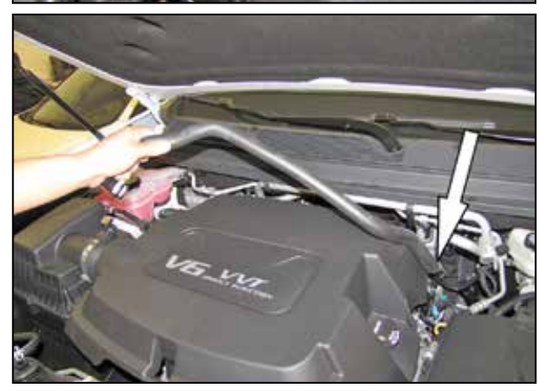
3. Disconnect the crank case vent hose from the intake plenum and then disconnect it from fitting on the valve cover and then remove it from the vehicle.