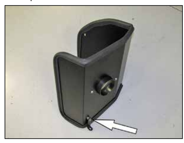
12. Install the provided heat shield mounting bracket (070015) onto the heat shield as shown using the provided hardware.

NOTE: be sure to place one of the provided spacers between the heat shield and bracket.