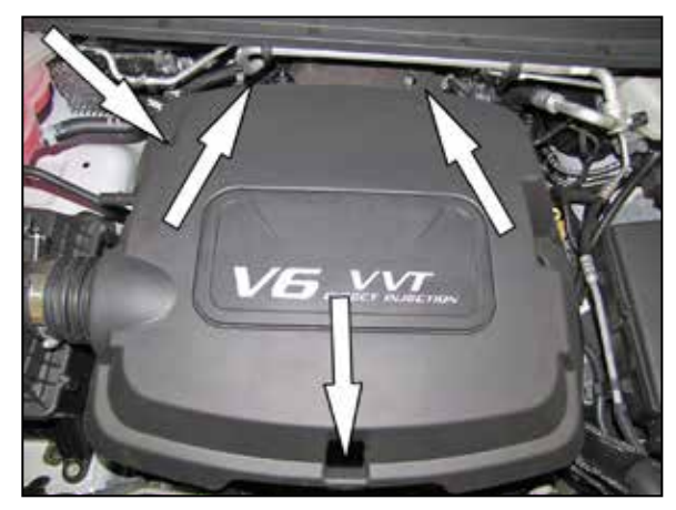
6. Loosen the two bolts that secure the rear off the intake plenum and remove the two forward bolts that secure the plenum.