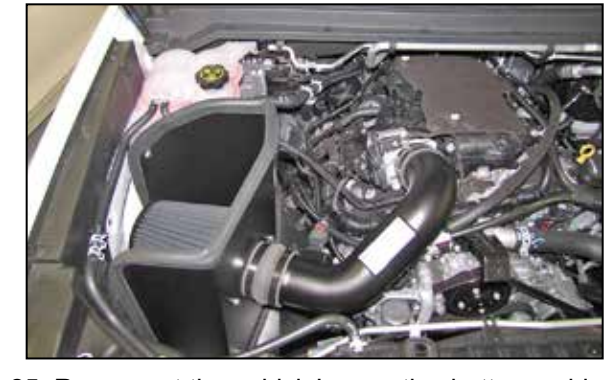
25. Reconnect the vehicle's negative battery cable. Double check to make sure everything is tight and properly positioned before starting the vehicle.

NOTE: Drycharger® air filter wrap; part # RF-1042DK is available to purchase separately. To learn more about Drycharger® filter wraps or look up color availability please visit http://www.knfilters.com®.