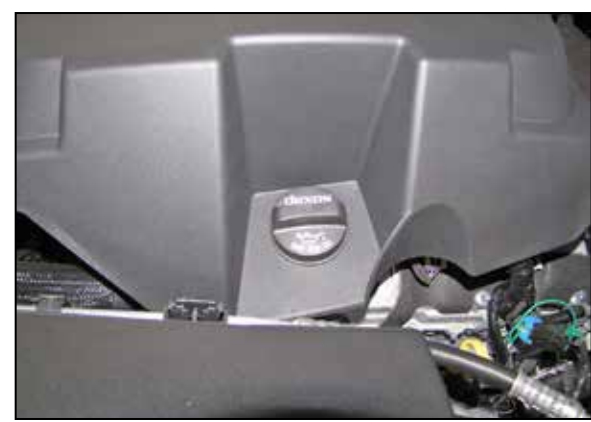
5. Remove the oil cap.