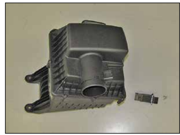
18. Remove the mass air sensor from the factory air filter housing.