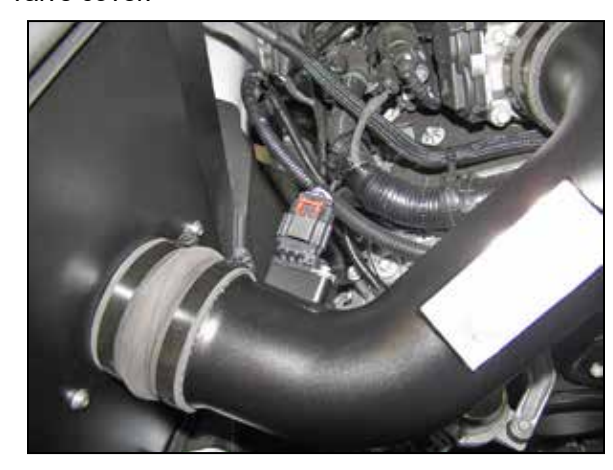
24. Reconnect the mass air sensor electrical connection.