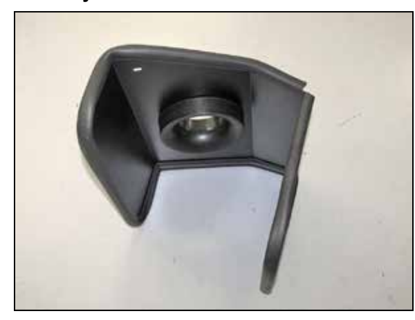
11. Install the provided filter adapter and secure with the provided hardware.

NOTE: Some trimming of the edge trim will be necessary.