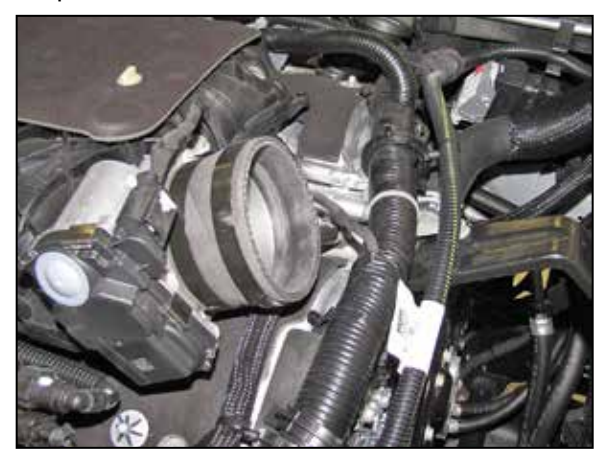
17. Install the provided step coupler (08186) onto the throttle body and secure with the provided hose clamp.