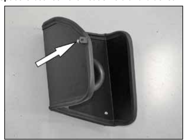
13.Install the provided heat shield mounting bracket (07805) onto the heat shield as shown using the provided hardware.

NOTE: be sure to place one of the provided spacers between the heat shield and bracket.