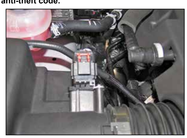
2. Disconnect the mass air sensor electrical connection.

NOTE: Disconnecting the negative battery cable erases pre-programmed electronic memories. Write down all memory settings before disconnecting the negative battery cable. Some radios will require an anti-theft code to be entered after the battery is reconnected. The anti-theft code is typically supplied with your owner's manual. In the event your vehicles anti-theft code cannot be recovered, contact an authorized dealership to obtain your vehicles anti-theft code.