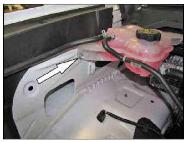
14. Remove the nut that secures the front of the coolant reservoir.

NOTE: be sure to place one of the provided spacers between the heat shield and bracket.