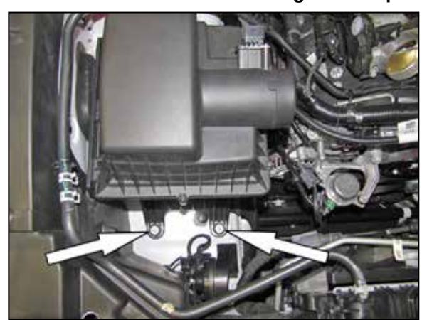
9. Remove the two nuts that secure the air filter housing to the inner fender and lift up the housing and remove it from the vehicle.

NOTE: Be sure to reinstall the engine oil cap.