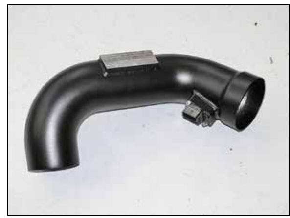
19. Install the mass air sensor into the K&N<sup>®</sup> intake tube and secure with the provided hardware.