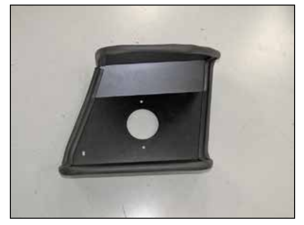
10. Install the provided edge trim onto the heat shield as shown.

NOTE: The housing is also held by a mounting grommet in the rear. One of the air box mounting nuts will be reused in a later step.