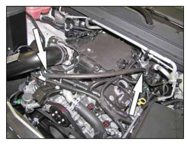
23. Install the crank case vent hose onto the fitting installed into the K&N® intake tube and then connect the hose mender into the fitting on the valve cover.