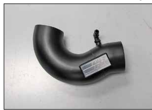
23. Install the provided 90° NPT fitting into the K\&N^{\mbox{\tiny B}} intake tube as shown.

NOTE: The larger side of the coupler will be stretched onto the mass air sensor housing.