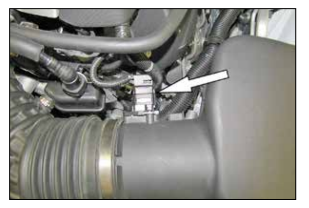
2. Disconnect the mass air sensor electrical connection.

3. Disconnect the crank case vent quick connect fitting from the intake tube.