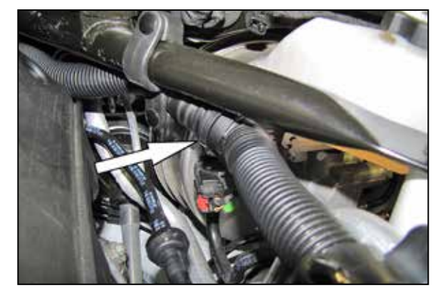
9. Disconnect the sound tube quick disconnect fitting and remove the complete sound tube system.