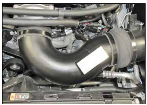
24. Install the K&N<sup>®</sup> intake tube into the hump coupler and then into the coupler at the throttle body, adjust the tube for best fit and then secure with the provided hose clamps.

NOTE: Plastic NPT fittings are easy to cross thread. Install the vent fitting "hand" tight, then turn it two complete turns with a wrench.