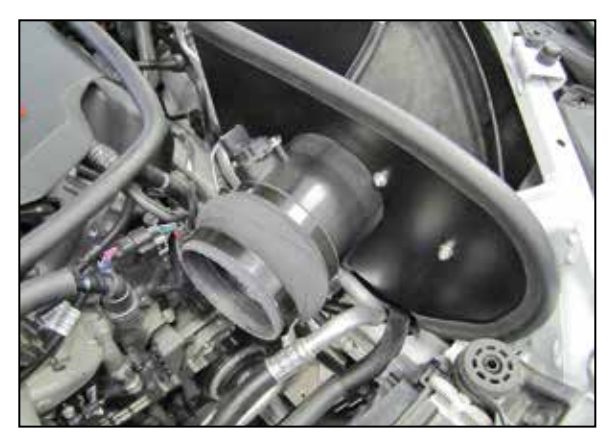
22. Install the provided step hump coupler (08633) onto the filter adapter and secure with the provided hose clamp.

NOTE: The larger side of the coupler will be stretched onto the mass air sensor housing.