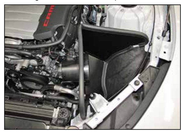
20. Install the K&N<sup>®</sup> heat shield assembly onto the air filter housing mounting grommets.

19. Install the mass air sensor into the K&N<sup>®</sup> mass air housing and secure with the provided hardware.