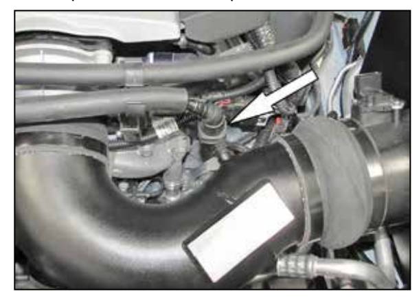
25. Connect the crank case vent hose to the quick