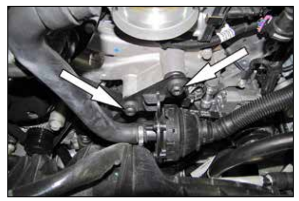
6. Remove the two bolts securing the sound drum to the front of the engine.