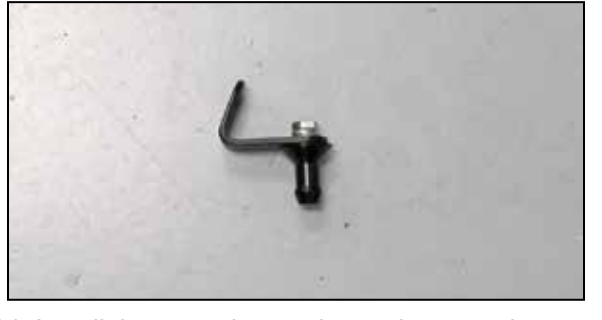
14. Install the mounting stud onto the mounting bracket using the provided hardware.