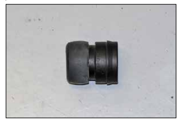
10. Install the provided cap onto the quick disconnect union.