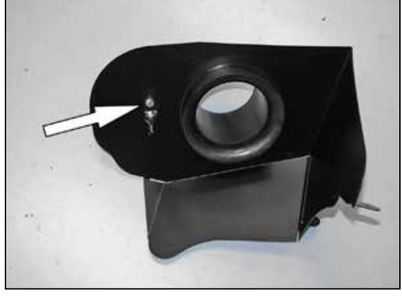
15. Install the provided mounting bracket assembly onto the heat shield using the provided hardware.