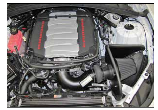
28. Reconnect the vehicle's negative battery cable. Double check to make sure everything is tight and properly positioned before starting the vehicle.

29. It will be necessary for all K&N<sup>®</sup> high flow intake systems to be checked periodically for realignment, clearance and tightening of all connections. Failure to follow the above instructions or proper maintenance may void warranty.