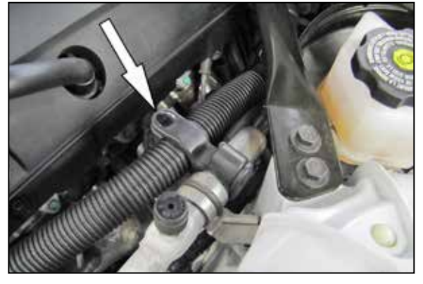
8. Disconnect the mount securing the sound tube to the A/C line.