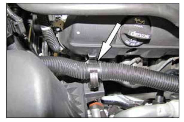
7. Open the clamp securing the sound tube to the air filter housing.