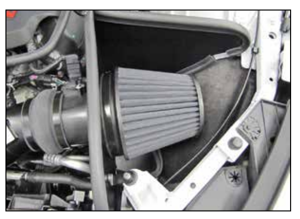
27. Install the K&N<sup>®</sup> air filter and secure with the provided hose clamp.