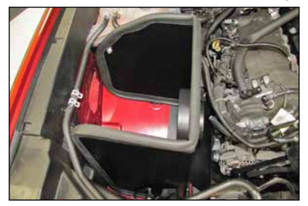
12. Install the heat shield assembly into the vehicle and secure with the factory coolant reservoir nut and air box mounting nut.

11. Remove the nut that secures the coolant reservoir to the inner fender. NOTE: This nut will be reused in the next step.