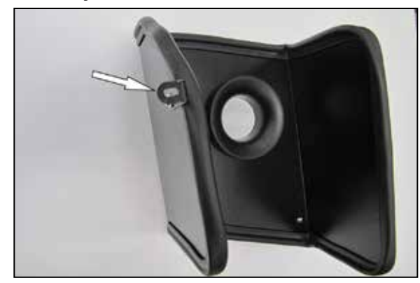
9. Install the provided heat shield mounting bracket (07805) onto the heat shield using the provided hardware and spacer.

NOTE: Some trimming of the edge trim will be necessary.