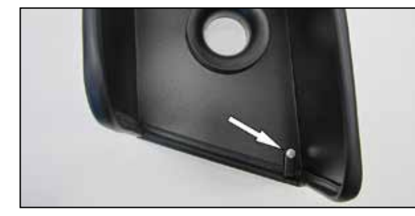
10. Install the provided heat shield mounting bracket (070015) onto the heat shield using the provided hardware and spacer.