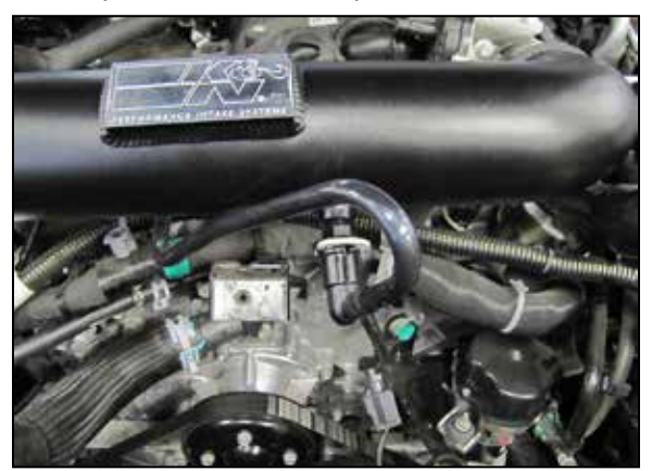
19. Rotate the crank case vent line and fitting so it aligns with the quick connect fitting and then connect.

18. Install the intake tube assembly into the coupler at the filter adapter and then into the coupler on the throttle body. Adjust the tube for best fit and secure with the provided hose clamps.