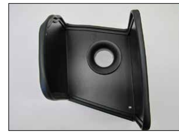
8. Install the edge trim onto the heat shield as shown.

NOTE: Some trimming of the edge trim will be necessary.