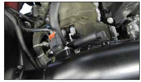
20. Using the provided vent hose, connect the factory vent to the 90° fitting installed into the K&N<sup>®</sup> intake tube. Reconnect the mass air sensor electrical connection.