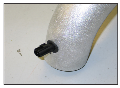
19. Install the sensor into the grommet installed in step #17.

NOTE: Take care installing the air temperature sensor, as it is very fragile.