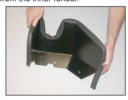
8. Install the provided edge trim onto the heat shield as shown.

NOTE: Some trimming of the edge trim may be necessary.