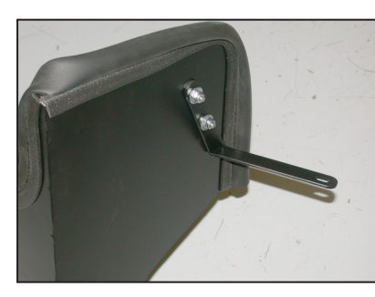
9. Install the "L" bracket (010124) onto the heat shield with the provided hardware as shown.

NOTE: Some trimming of the edge trim may be necessary.