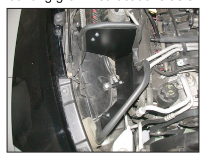
14. Install the heat shield assembly and secure with the provided hardware and the factory airbox mounting nut.

NOTE: Due to manufacturer tolerances, the A/C line may require slight clearance adjustment. Carefully pull the A/C line to obtain approximately 3/4" clearance to the heatsheild.