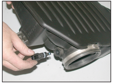
16. Twist the air temperature sensor counter clockwise and remove it from the stock intake

NOTE: Take care, as the air temperature sensor is very fragile.