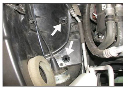
7. Pull the two airbox mounting grommets shown from the inner fender.