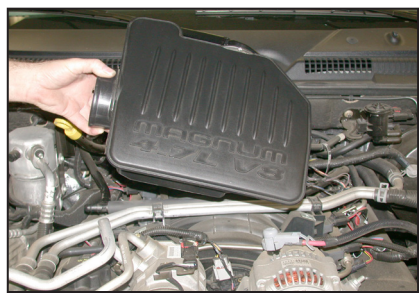
6.Lift and remove the intake plenum from the vehicle as shown.