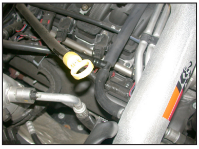
23. Install the provided crankcase vent hose onto the factory crankcase vent fitting and then onto the K&N® intake tube as shown.

NOTE: It may be necessary to use the provided temperature sensor wiring harness extension on some models due to factory wiring harness changes.