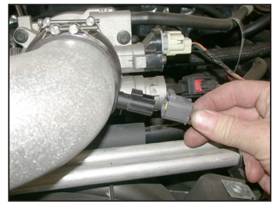
22. Reconnect the air temperature sensor electrical connection as shown.

NOTE: It may be necessary to use the provided temperature sensor wiring harness extension on some models due to factory wiring harness changes.