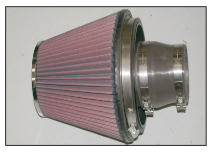
25. Install the silicone hose (084055) onto air filter adapter as shown and secure with the provided hose clamp as shown.