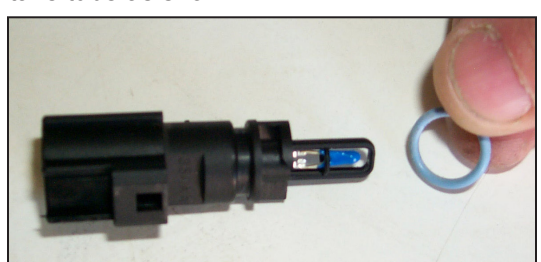
18. Remove the O-ring from the air temp. sensor as shown.