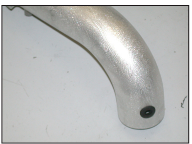
17. Install the provided grommet into the K\&N^{\circledcirc} intake tube as shown.

NOTE: Take care, as the air temperature sensor is very fragile.