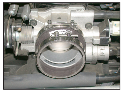
15. Install the provided silicone hose (084031) onto the throttle body and secure with the provided hose clamp as shown.

NOTE: Due to manufacturer tolerances, the A/C line may require slight clearance adjustment. Carefully pull the A/C line to obtain approximately 3/4" clearance to the heatsheild.