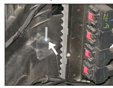
12. Install the provided 5/16" washer onto the airbox mounting stud as shown.