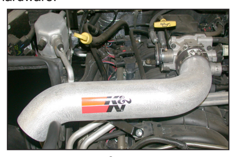
21. Install the K&N® intake tube into the silicone hose at the throttle body and position so that the mounting bracket aligns with the plenum mounting location. Then secure with the provided hardware.