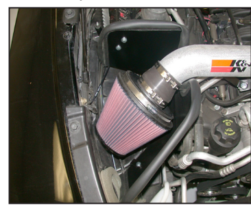
26. Install the air filter assembly onto the K&N® intake tube and secure with the provided hose clamp as shown.