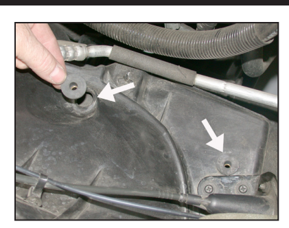
13. Install the two threaded inserts into the airbox mounting grommet locations as shown.