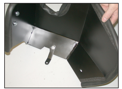
10. Install the "L" bracket (010122) onto the heat shield with the provided hardware as shown.