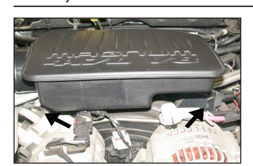
5. Loosen and remove the two intake plenum mounting bolts indicated.