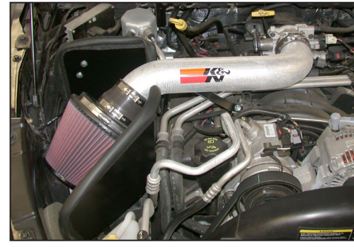
27. Reconnect the vehicle's negative battery cable. Double check to make sure everything is tight and properly positioned before starting the vehicle.