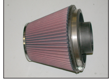
24. Install the air filter adapter into the K&N® air filter as shown and secure with the provided hose clamp.

NOTE: Some trimming of the vent hose may be required.