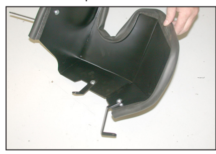
11. Install the "C" bracket (010123) onto the heat shield with the provided hardware as shown.