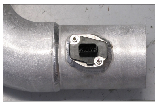
17. Install the mass air sensor into the K&N® intake tube and secure with the provided screws.