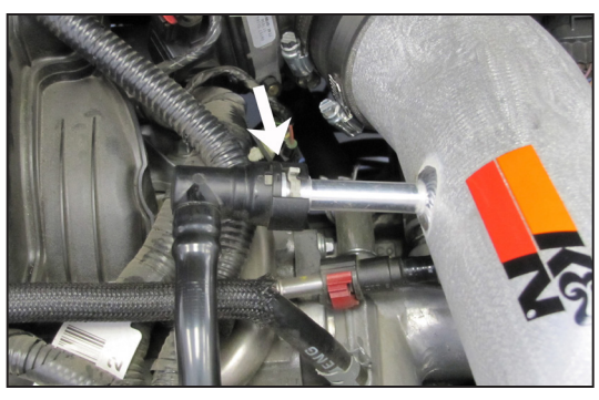
21. Connect the crankcase vent hose to the quick connect fitting on the K&N® intake tube as shown.