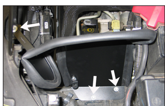
14. Install the heat shield into position on the inner fender and secure with the factory airbox mounting bracket bolts removed in step #8. Secure the heat shield mounting bracket to the airbox mounting bracket location on the core support using the factory bolt removed in step #5.

NOTE: On 2007 and 2008 model year vehicles, secure the wiring harness to the "L" bracket installed during step #12.