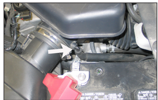
3. Disconnect the EVAP hose shown from the intake tube.

2. Release the red locking tab and then disconnect the mass air sensor electrical connection.