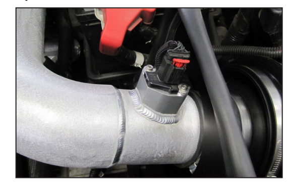
25. Using the provided mass air sensor extension harness, reconnect the mass air sensor electrical connection.

NOTE: Drycharger® air filter wrap; part # RF-1042DK is available to purchase separately. To learn more about Drycharger® filter wraps or look up color availability please visit http://www.knfilters.com®.