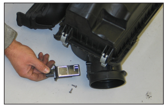
16. Remove the two screws securing the mass air sensor to the airbox and then remove the mass air sensor from the airbox.