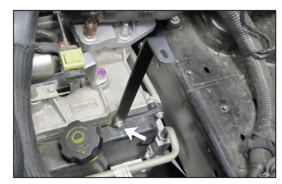
10. Install the intake tube mounting bracket (070095) onto the transmission pan and secure with the factory bolt removed in step #9.