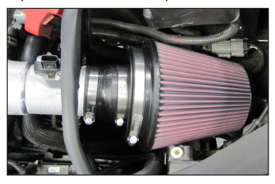
24. Install the filter assembly onto the intake tube and secure with the provided hose clamp.

NOTE: Drycharger® air filter wrap; part # RF-1042DK is available to purchase separately. To learn more about Drycharger® filter wraps or look up color availability please visit http://www.knfilters.com®.