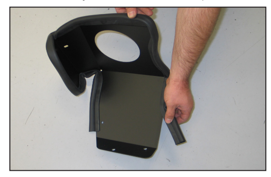
11. Install the provided edge trim onto the heat shield as shown.