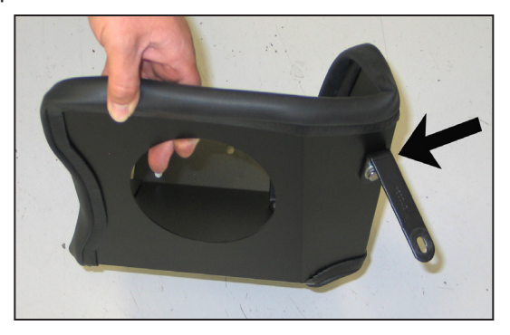
13. Install the provided "L" bracket (070094) onto the heat shield using the provided hardware as shown.