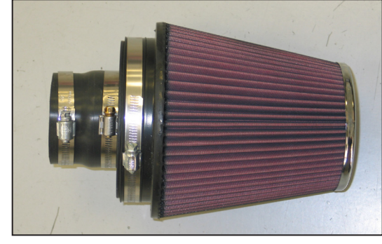
23. Install the silicone (084091) hose onto the filter adapter and secure with the provided hose clamp.