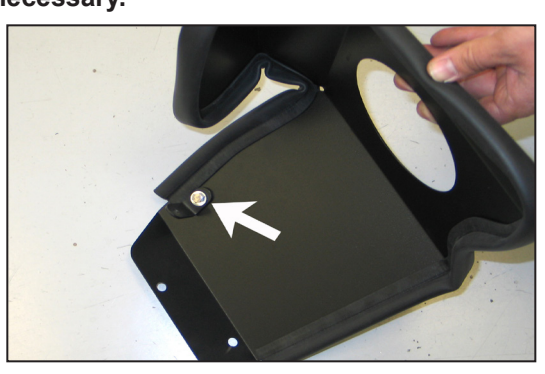
12. On 2007 and 2008 model vehicles, install the "L" bracket (070066) onto the heat shield using the provided hardware as shown.