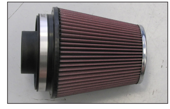
22. Install the filter adapter into the K&N® air filter and secure with the provided hose clamp.