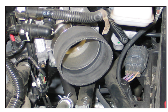
15. Install the silicone hose (08051) onto the throttle body and secure with the provided hose clamp.

NOTE: On 2007 and 2008 model year vehicles, secure the wiring harness to the "L" bracket installed during step #12.