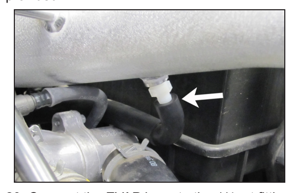
20. Connect the EVAP hose to the 1/4npt fitting as shown.