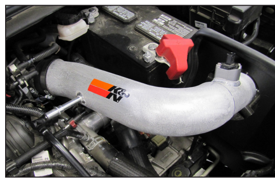
19. Install the K&N® intake tube into the silicone hose at the throttle body and align with the mounting bracket installed in step #10. Secure the intake tube with hose clamp and hardware provided.

NOTE: Plastic NPT fittings are easy to cross thread. Install the vent fitting "hand" tight, then turn it two complete turns with a wrench.