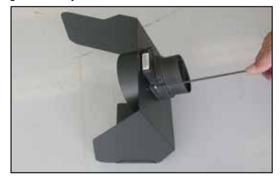
10. Using the provided hardware assemble the mass air adapter, heat shield, gaskets, and the stock mass air sensor as shown.