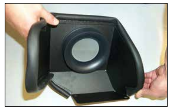
11. Install the edge trim onto the heat shield as shown.