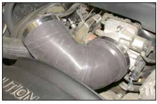
14. Install the silicone angled hose and hose clamps onto the throttle body but do not tighten at this time.