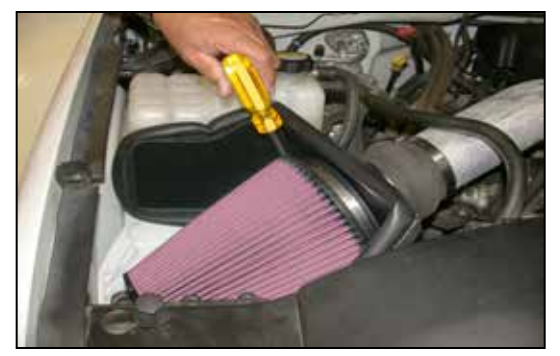
18. Install the K&N<sup>®</sup> air filter onto the mass air adapter and secure with the provided hose clamp as shown.