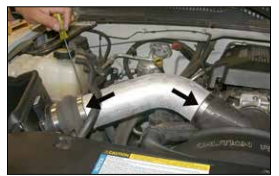
16. Install the K&N<sup>®</sup> intake tube into the angled hose, then, slide the other end into the hump hose. Adjust everything for best fit and clearance then tighten the hose clamps as shown.

15. Install the silicone step hump hose and hose clamps onto the mass air sensor and tighten as shown.