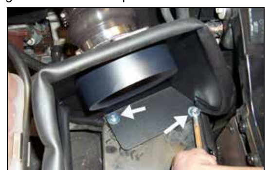
17. Tighten the hardware on the heat shield as shown.