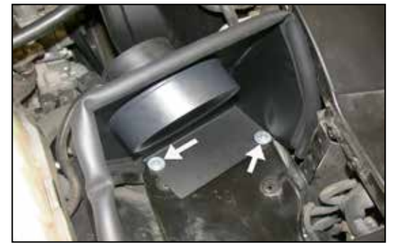
13. Secure the heat shield to the rubber mounted studs using the provided hardware but do not tighten at this time.