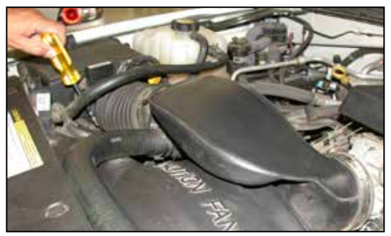
3. Loosen the hose clamps at the throttle body and at the mass air sensor.

2. Disconnect the mass air sensor electrical connection as shown.