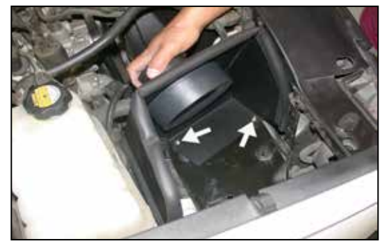
12. Install the heat shield onto the rubber mounted studs as shown.