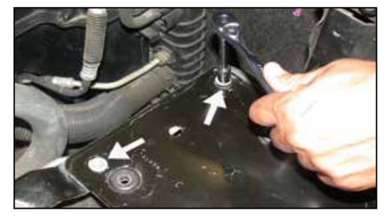
8. Remove the two stock air cleaner support tray bolts as shown.

7. Loosen the hose clamp on the air cleaner then remove the mass air sensor as shown.