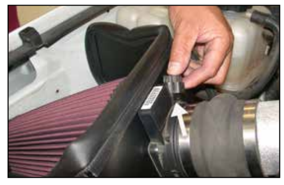
19. Reconnect the mass air sensor electrical connection as shown.