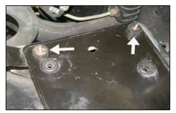
9. Install the rubber mounted studs as shown and tighten firmly.