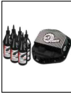
Front Differential Cover

P/N: 46-70082-WL (w/ Oil) 46-70082 (BIK) 46-70080 (RAW)