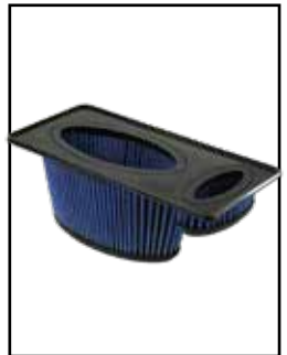
OER Air Filter

P/N: 10-10107 (P5R) 11-10107 (PDS) 71-10107 (PG7)