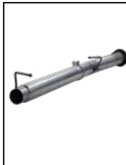
Exhaust Race Pipe