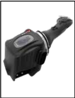
Air Intake System

P/N: 46-70022-WL (w/ Oil) 46-70022 (BIK) 46-70020 (RAW)