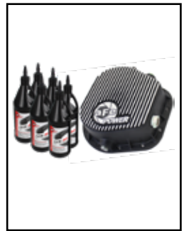
Rear Differential Cover

P/N: 46-70022-WL (w/ Oil) 46-70022 (BIK) 46-70020 (RAW)