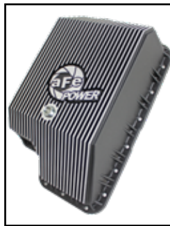
Transmission Pan Cover

P/N: 46-70082-WL (w/ Oil) 46-70082 (BIK) 46-70080 (RAW)