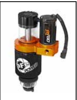
Diesel Fuel System

P/N: 42-13031 (Full-time) 42-13032 (Part-time)