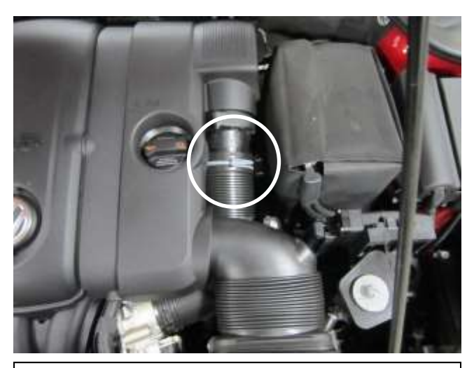
b) Release the pressure clamp at the engine cover outlet as shown and disconnect the stock intake hose from the engine cover.

a) With a T-20 Torx, remove the two bolts securing the stock air scoop to the front support. These bolts will be reused.