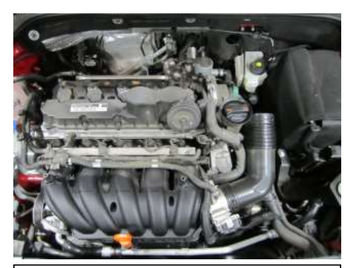
c) Remove the engine cover from the vehicle. Note: Pull up on the back corners of the cover first then the front two.