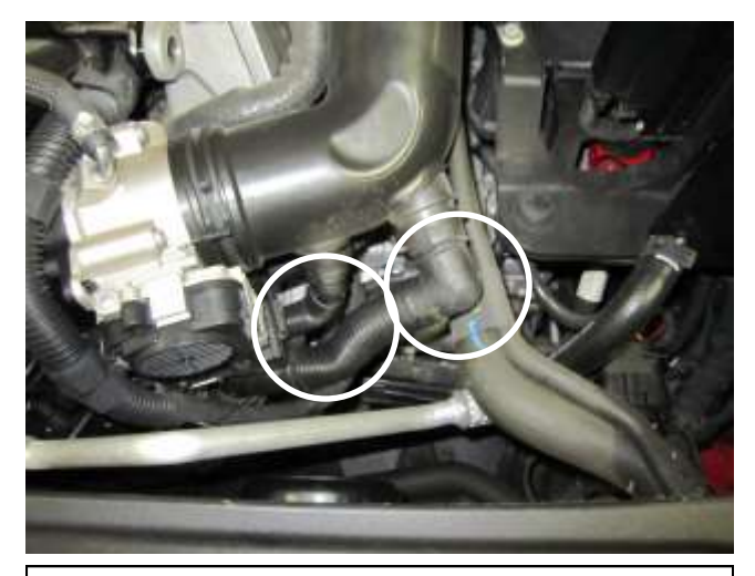
d) Detach both of the air injection connectors by squeezing the knurled area and pulling away from the stock intake tube. Note: Some models have only one vent.

Tools Needed: T-20 Torx (Locking) Pliers