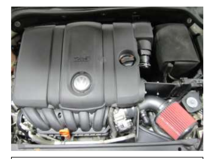
AEM<sup>®</sup> intake system installed