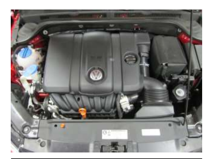
Factory air box system installed

I) Re-install the engine cover onto the engine and push down to secure it.