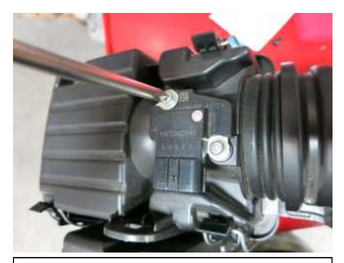
f. Use a phillips screwdriver to remove the MAF sensor. Set aside the stock screws for use with the AEM tube.