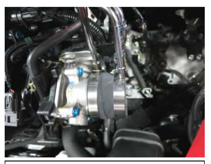
b. Install the transition coupler(08476) and fasten the hose clamp(AEM-9440) over the throttle. Slide loose hose clamp(AEM-9436) over the other coupler end.

a. Use the stock screws removed in step 2f to fasten the MAF sensor into the AEM tube.