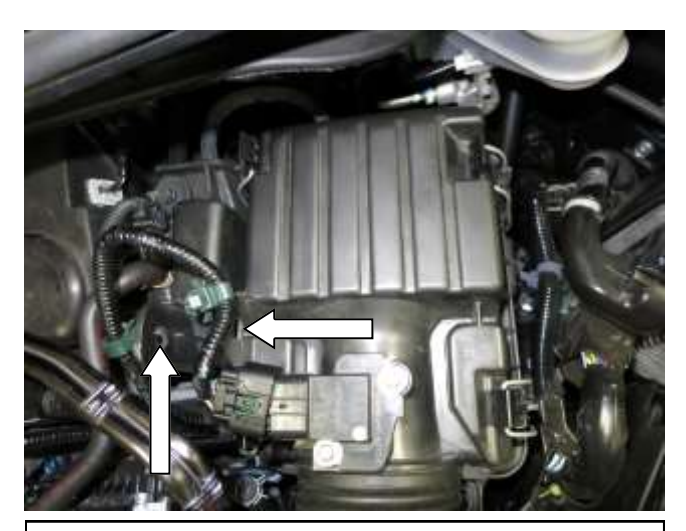
c. Disconnect the MAF harness from the connector. Unclip the two green tree-mount ties from upper airbox.