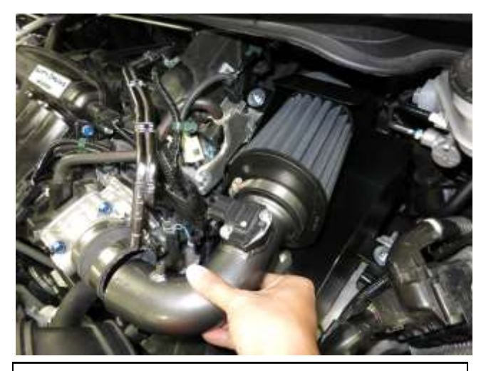
g. Insert the intake tube into the coupler and align the lower rubber mount to the lower bracket.

e. Install the heat shield and align locating tabs over the rubber mounts. Fasten tabs down with the provided nuts(AEM-444.460.04) and washers(08160).