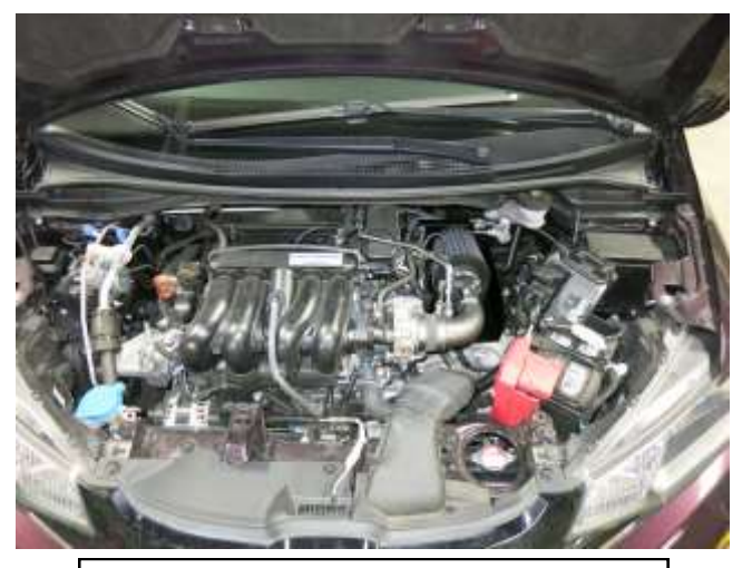
p. Finished installation of AEM Intake System.