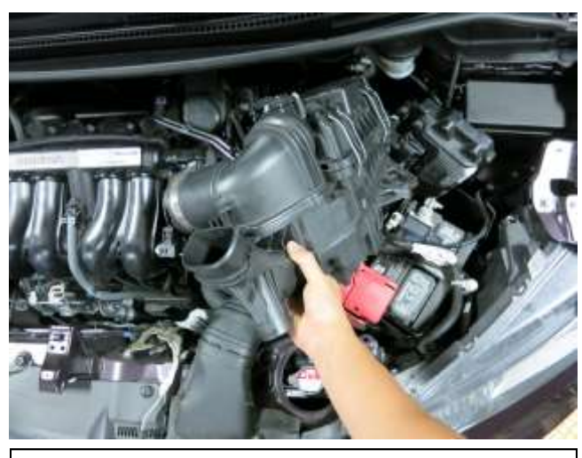
e. Carefully remove the stock intake assembly from the engine bay.