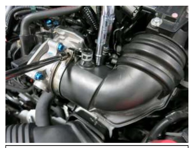
d. Loosen the hose clamp securing the intake tube to the throttle using a 8mm socket.

b. Depress the spring clamp on the intake tube to disconnect the hard breather line as shown.