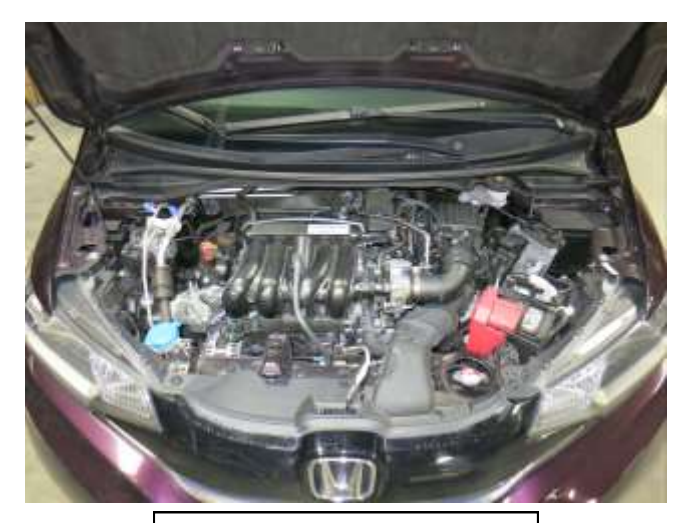
o. Factory air induction system.

I. Reconnect the MAF harness to the sensor.