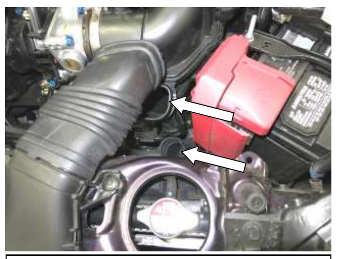
a. Disconnect the upper and lower air inlet ducts from the lower intake box.