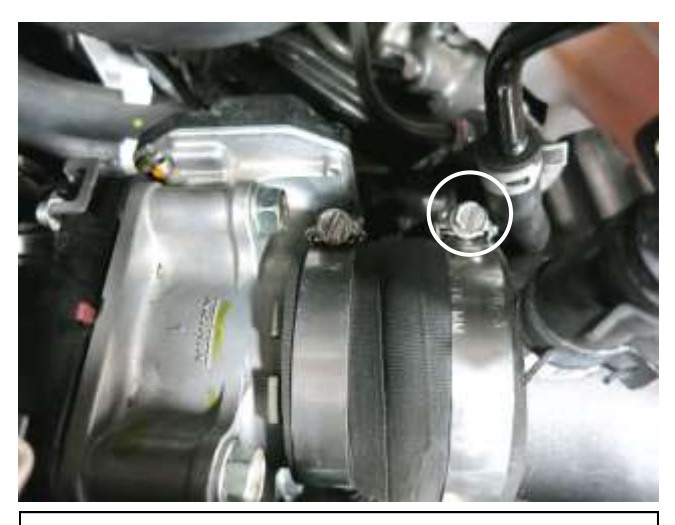
o. Once the AEM intake tube is properly aligned with the coupler and the heat shield, tighten the circled hose clamp (30 in. lb.).