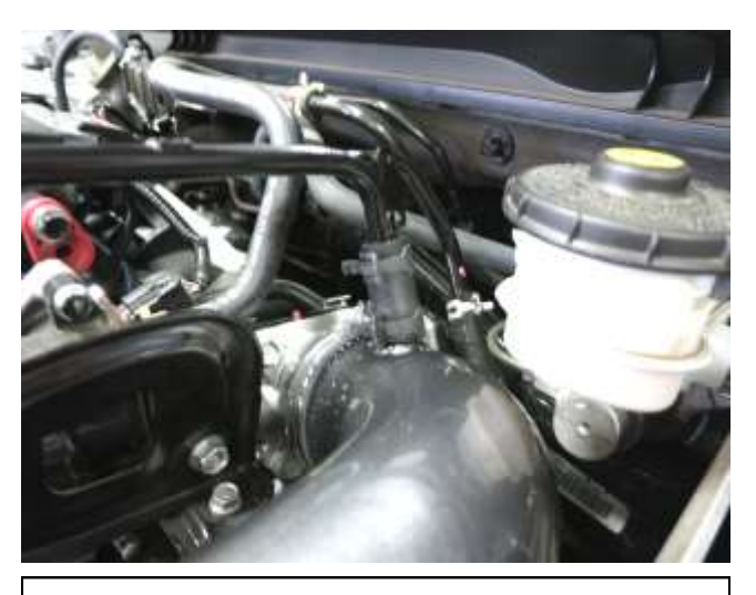
I. Align the previously installed hose on the AEM intake to the factory vent hard line and secure with the spring clamp.