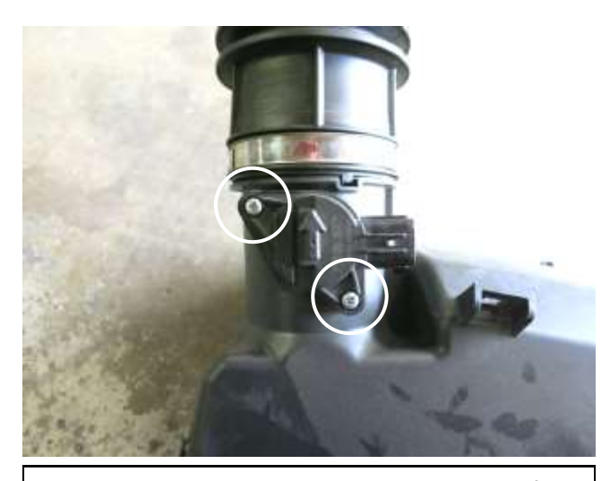
I. Remove the two screws and pull the MAF sensor from the stock upper air box. They will be reused in step 3c.