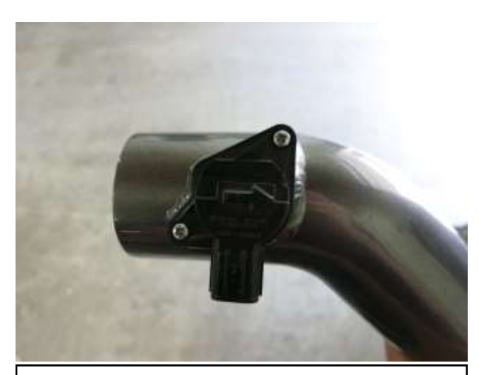
c. Install the MAF sensor into the AEM tube with the hardware that was removed in step 2l.