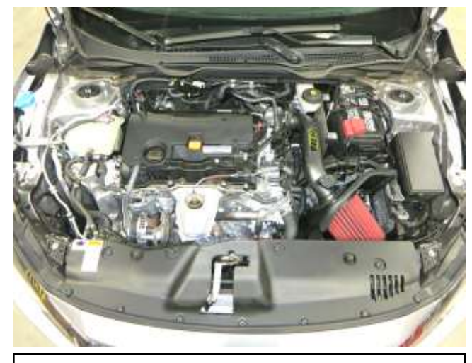
AEM INTAKE INSTALLED