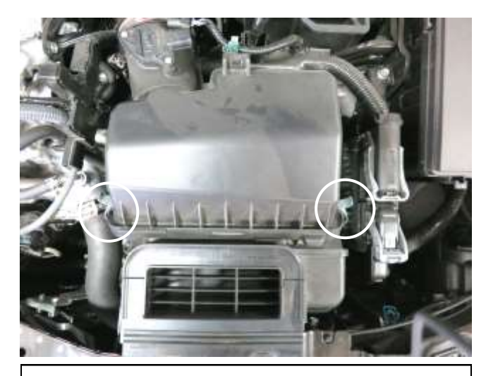
e. Unlatch the two clips on the stock air box.