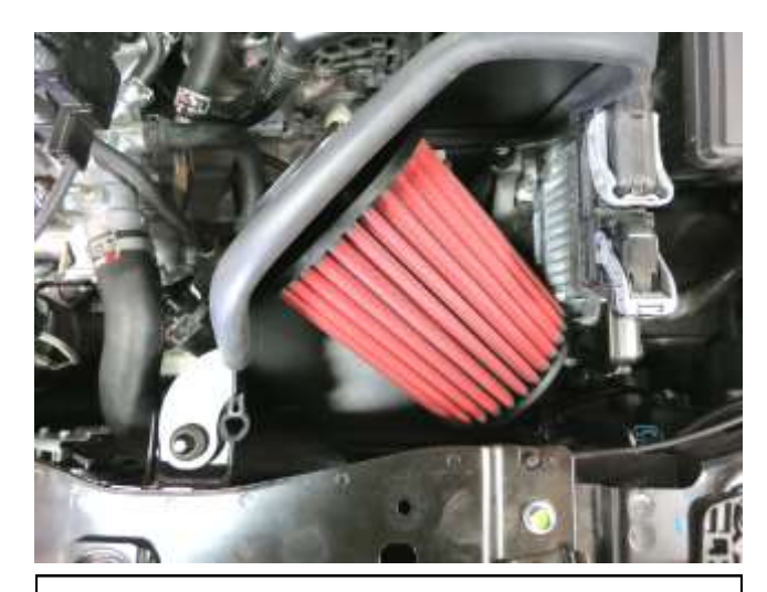
k. Lower the AEM filter with hose clamp into the AEM heat shield as shown.