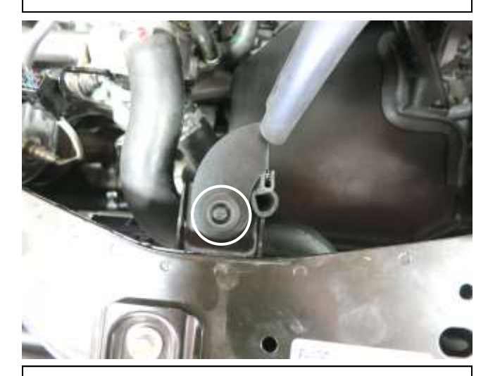
h. Seat the grommet onto the air box post as shown.