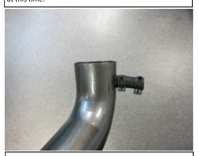
d. Install the provided hose and spring clamps onto the AEM intake tube. Trimming to 1.5" may be necessary.