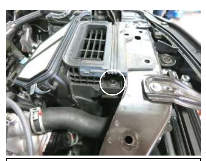
i. Lift the lower air box out of the vehicle making sure to disconnect the grommet from the vehicle.