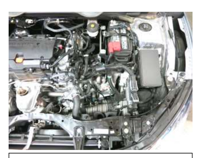
j. Lower air box removed.