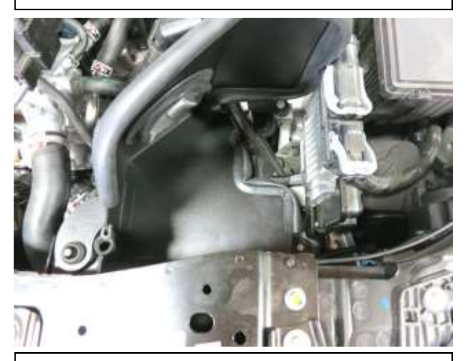
g. Install the AEM heat shield into the vehicle as shown, routing it around the electrical harness.