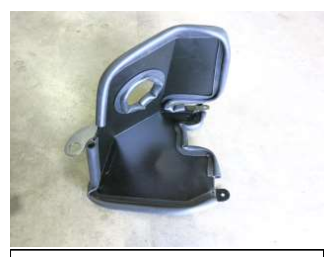
e. Install the provided edge trim as shown. Trimming the edge trim will be necessary.