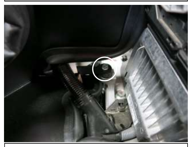
i. With the provided hardware, secure the AEM heat shield to the previously installed rubber mount towards the rear of the vehicle.