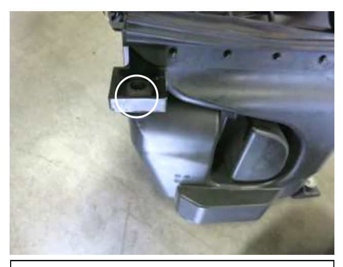
k. Remove the grommet from the lower air box. This will be reused in step 3f.