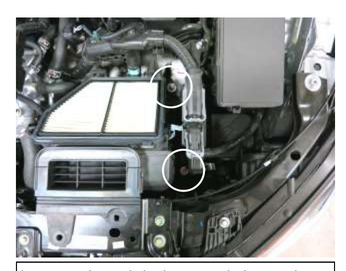
h. Remove the two bolts that secure the lower air box to the vehicle.