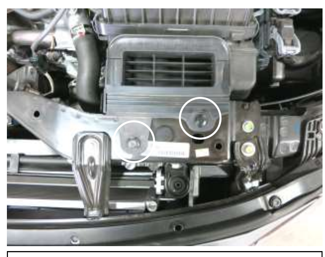
b. Remove the two push-in clips that secure the air box to the core support.