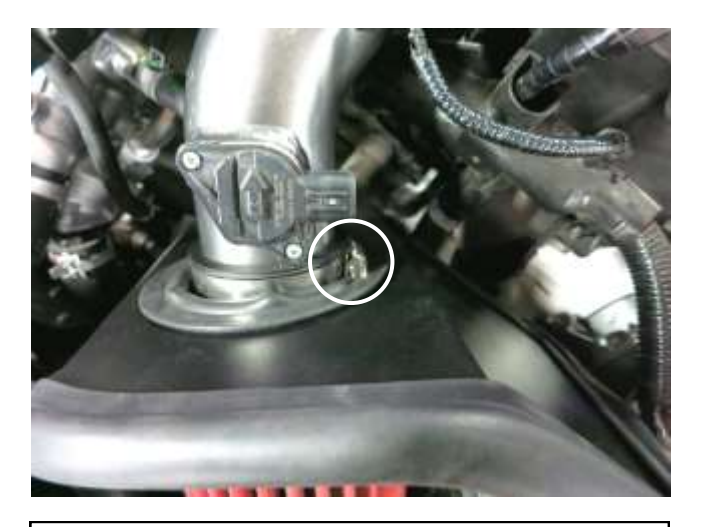
m. Connect the AEM intake tube to the AEM filter, and tighten the hose clamp (30 in. lb.) to secure the filter to the tube. Connect the MAF sensor connector.