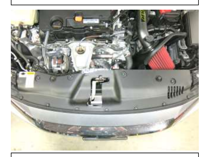
p. Re-install the front shroud cover on to the vehicle with the nine push-in clips removed in step 2a.