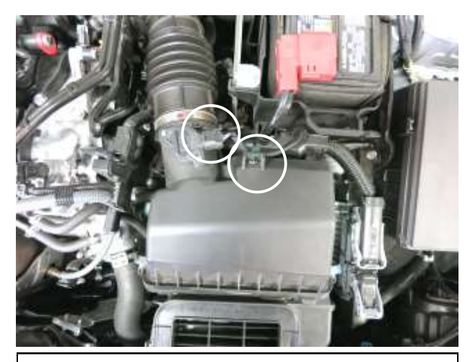
c. Depress the MAF (Mass Air Flow ) sensor connector tab and remove the connector from the sensor. Then, disconnect the green zip tie from the harness.