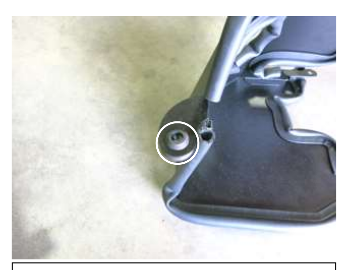
f. Install the grommet that was removed in step 2k. as shown.