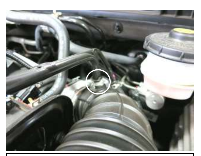
d. Squeeze the spring clamp on the vent line and remove the vent line from the stock intake tube.