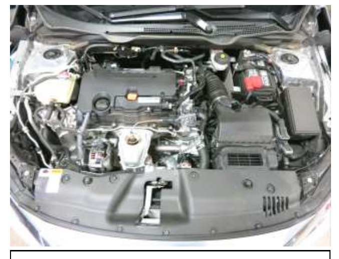
STOCK INTAKE INSTALLED