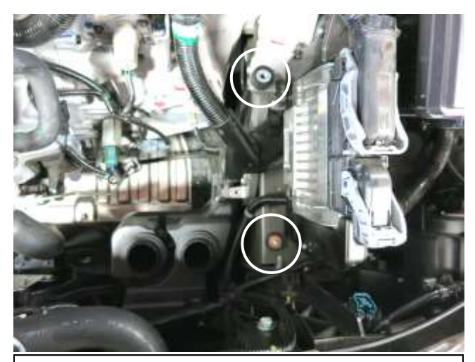
a. Install the two rubber mounts into the vehicle as shown.

a. When installing the intake system, do not completely tighten the hose clamps or mounting hardware until instructed to do so.