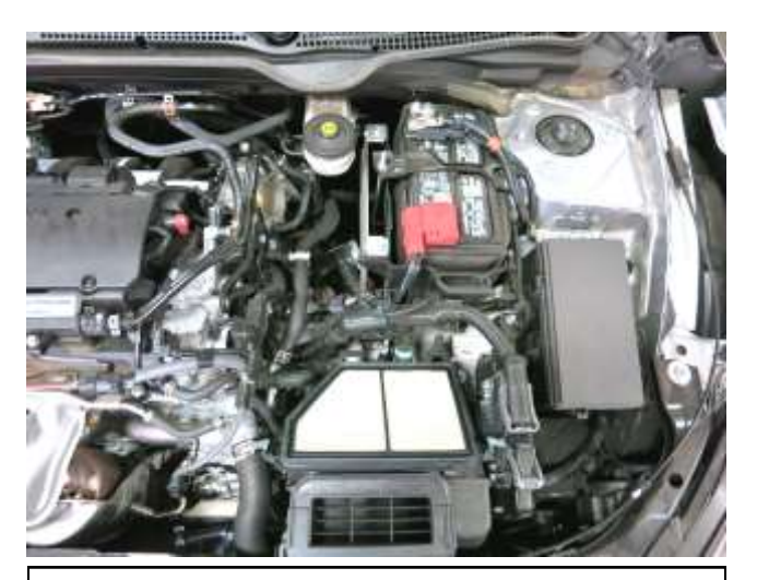
g. Remove the upper air box with the intake arm.