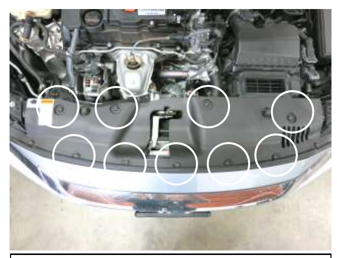
a. Remove the nine push-in clips, and remove the front shroud cover.