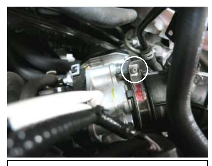
f. Loosen the hose clamp at the throttle body.