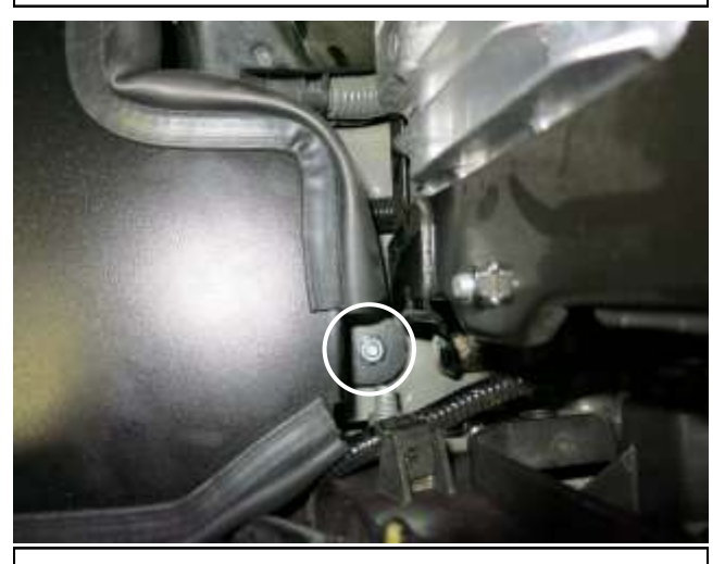
j. With the provided hardware, secure the AEM heat shield to the previously installed rubber mount on the frame rail.