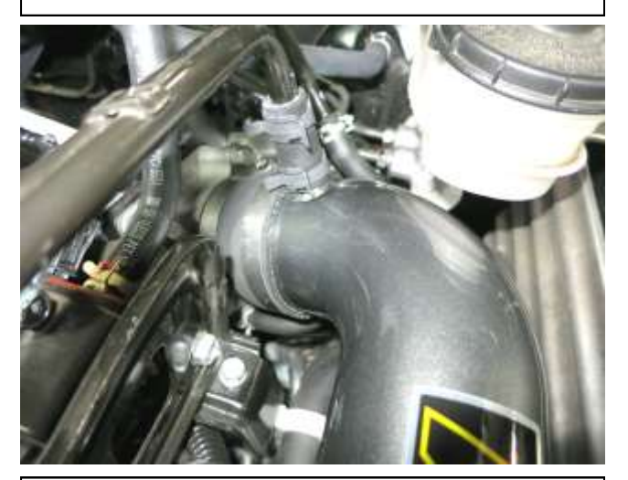
n. Connect the other end of the AEM intake tube into the coupler that was installed on the throttle body.