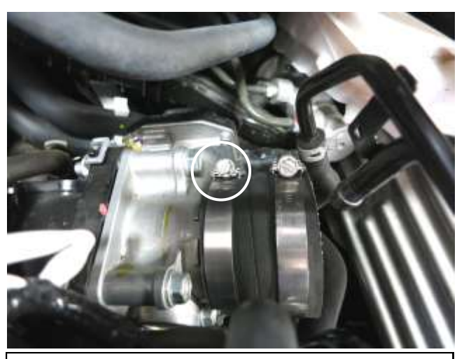
b. Install the provided coupler and hose clamps onto the throttle body. Tighten the circled hose clamp (30 in. lb.) at this time.