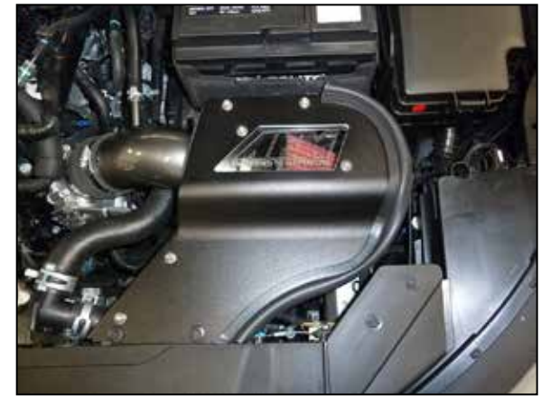
15. Install the lid onto the heat shield and secure with the provided hardware.