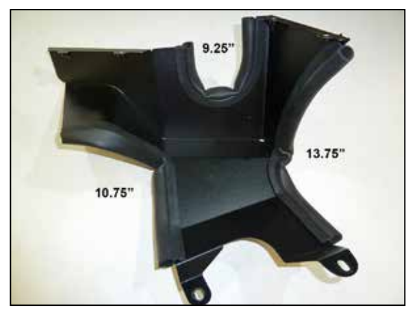
9. Install the three sections of edge trim onto the heat shield as shown.