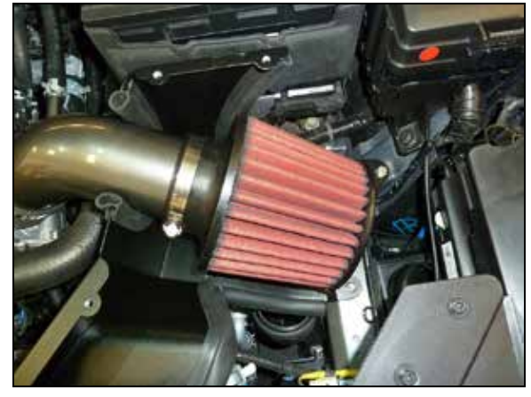
12. Install the AEM<sup>®</sup> air filter and secure with the provided hose clamp.