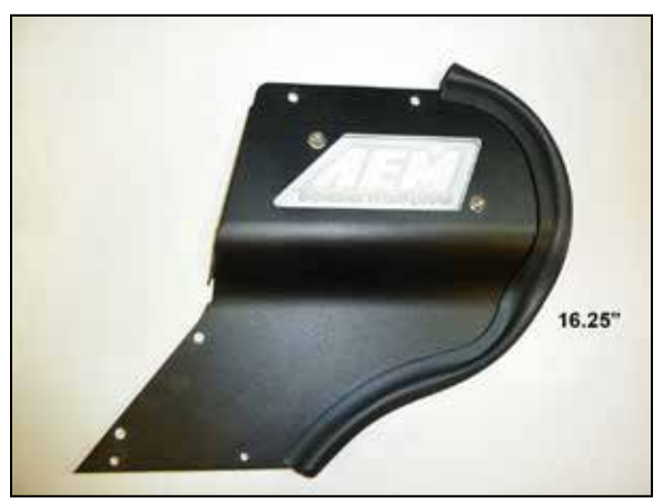
13. Install the AEM<sup>®</sup> logo into the heat shield and secure with the provided hardware. Install the edge trim onto the heat shield as shown.