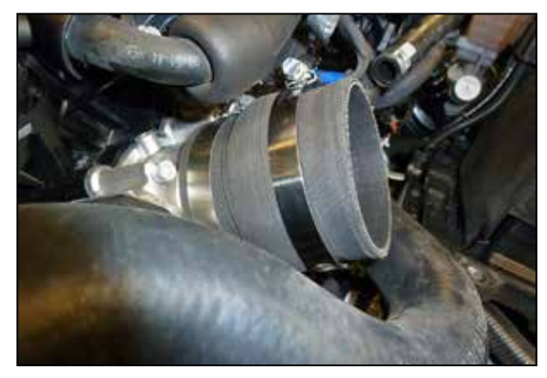
7. Install the provided coupler (#08421) onto the throttle body and secure with the provided hose clamp.