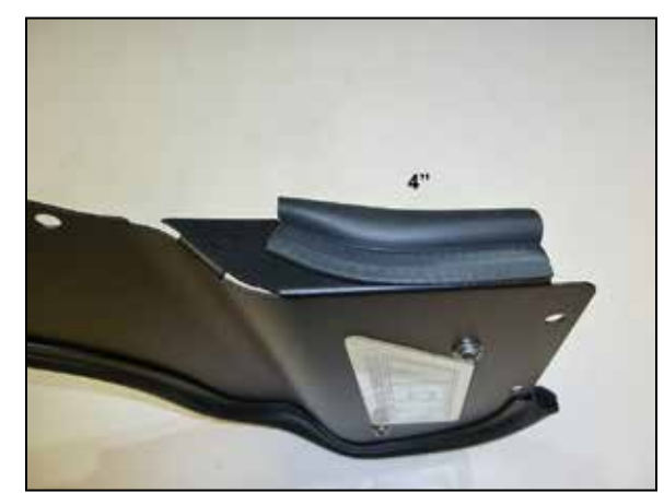
14. Install the remaining edge trim onto the heat shield as shown.