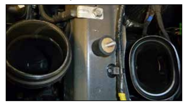
6. Install the provided rubber mounted stud onto the frame rail as shown.

NOTE: AEM recommends that customers do not discard factory air intake.