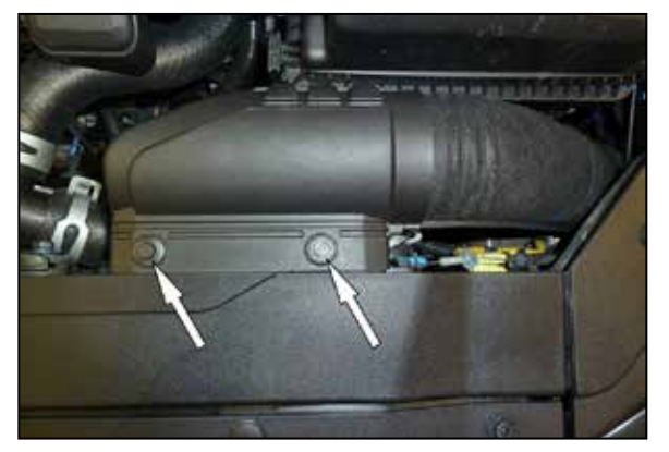
2. Remove the two push pins that secure the fresh air intake duct and then remove the fresh air intake duct from the vehicle.

3. Loosen the clamp that secures the factory intake hose to the throttle body. Release the spring clamp that secures the crank case vent line and disconnect the crank case vent from the factory intake hose.