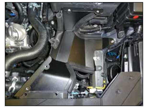
10. Install the heat shield assembly into the vehicle and secure with the provided hardware.