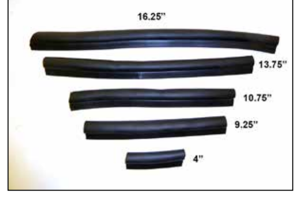
8. Cut the provided edge trim into five sections as shown.