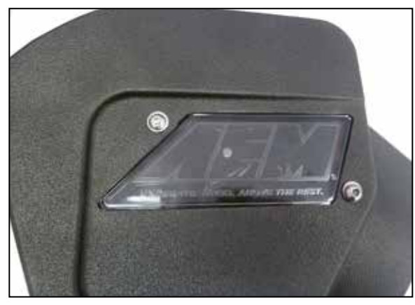
6. Install the AEM window into the air filter housing using the provided hardware.

5. Install the provided mounting studs onto the AEM air filter housing using the provided hardware.