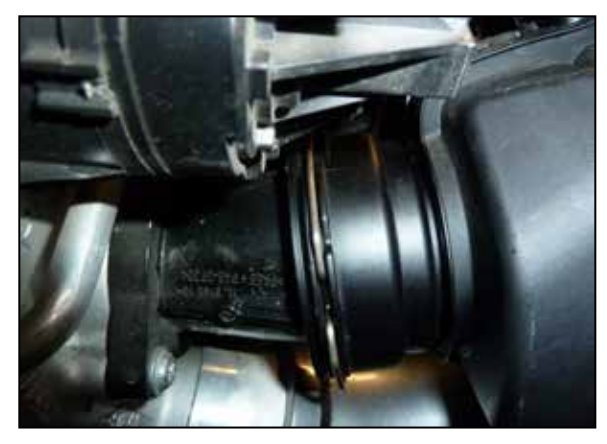
4. Remove the clip the locks the intake tube to the turbo inlet and then disconnect the tube from the turbo and remove it from the vehicle.