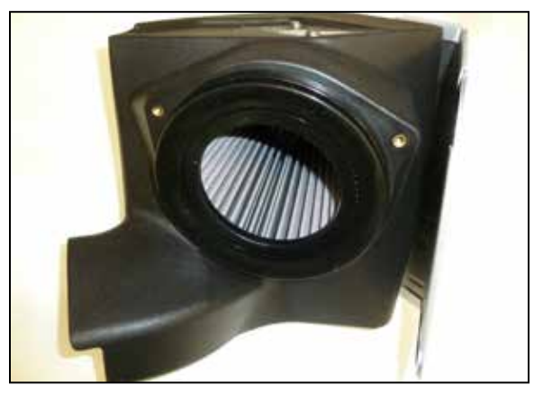
11. Place the air filter into the AEM air filter housing.