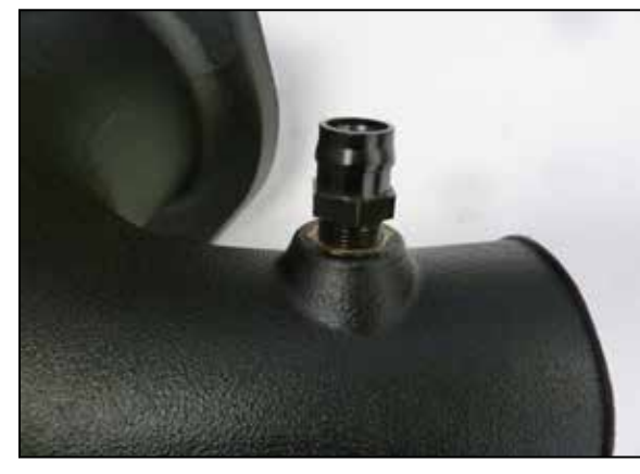
9. Install the provided CCV fitting into the AEM intake tube. Be sure to apply thread sealer before installing the fitting into the intake tube.