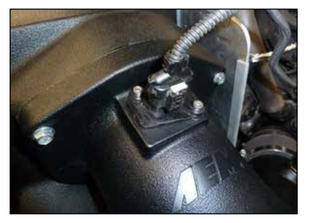
16. Reconnect the sensor electrical connection.