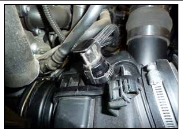
3. Pinch the locking tab s on the CCV hose connection and then disconnect the CCV hose from the factory intake tube.