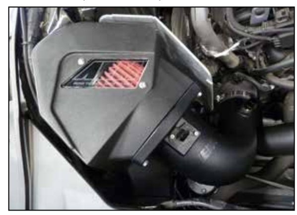
14. Install the assembly into the vehicle so the intake tube engages the coupler and the mounting studs engage the mounting grommets. Tighten hose clamp.