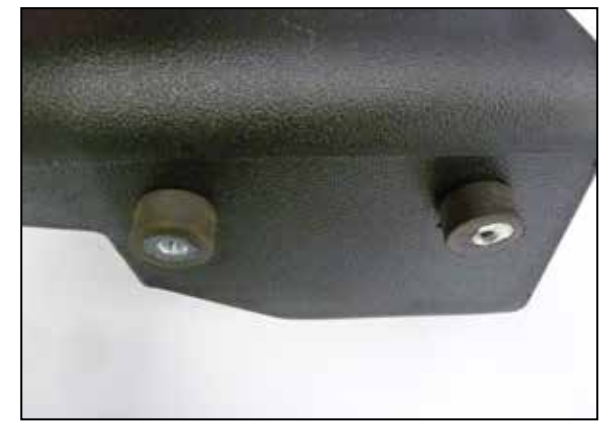
7. Install the two rubber mounted studs onto the AEM air filter housing using the provided hardware.