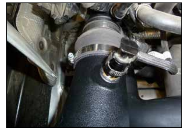
15. Connect the CCV hose to the fitting installed into the intake tube.