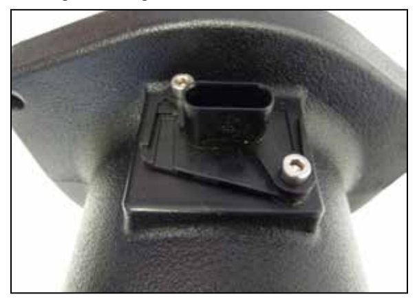
10. Remove the sensor from the factory intake tube. Install the sensor into the intake tube using the provided hardware.