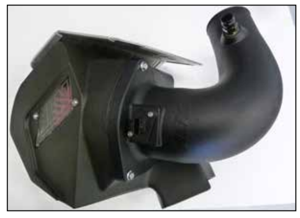
12. Install the AEM tube onto the filter housing and secure with the provided hardware.