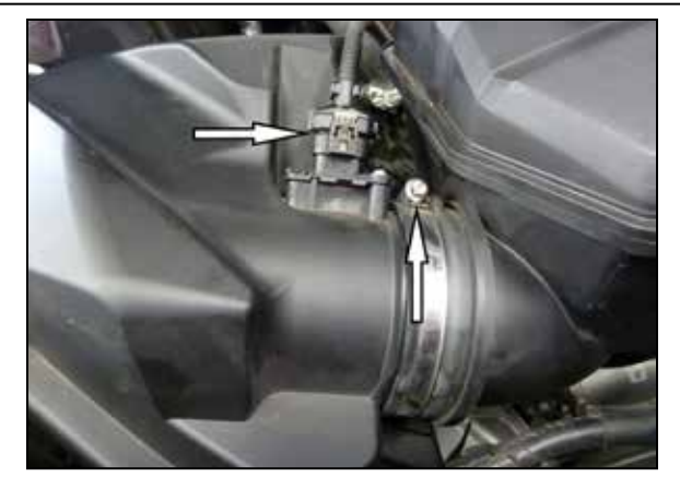
2. Disconnect the temperature sensor electrical connection. Loosen the hose clamp connecting the intake tube to the factory air filter housing, separate the tube from the housing. Lift the air filter housing up and remove it from the vehicle.

NOTE: Disconnecting the negative battery cable erases pre-programmed electronic memories. Write down all memory settings before disconnecting the negative battery cable. Some radios will require an anti-theft code to be entered after the battery is reconnected. The anti-theft code is typically supplied with your owner's manual. In the event your vehicles anti-theft code cannot be recovered, contact an authorized dealership to obtain your vehicles anti-theft code.