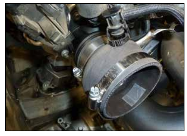
13. Install the provided coupler onto the turbo inlet.