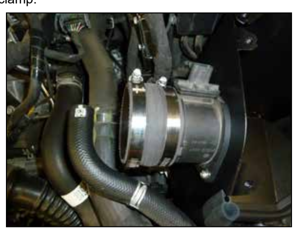
13. Install the provided straight coupler onto the mass air sensor and secure with the provided hose clamp.