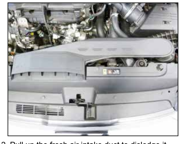
2. Pull up the fresh air intake duct to dislodge it from the mounting brackets and then remove it from the vehicle.

NOTE: Disconnecting the negative battery cable erases pre-programmed electronic memories. Write down all memory settings before disconnecting the negative battery cable. Some radios will require an anti-theft code to be entered after the battery is reconnected. The anti-theft code is typically supplied with your owner's manual. In the event your vehicles anti-theft code cannot be recovered, contact an authorized dealership to obtain your vehicles anti-theft code.