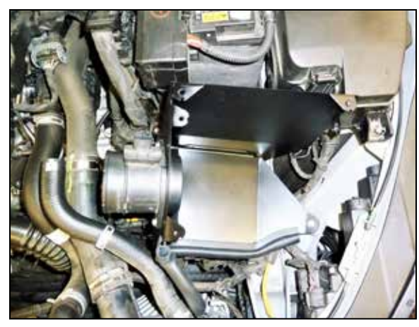
11. Install the heat shield assembly into the vehicle so the mounting stud inserts into the mounting grommet, then secure with the provided hardware.