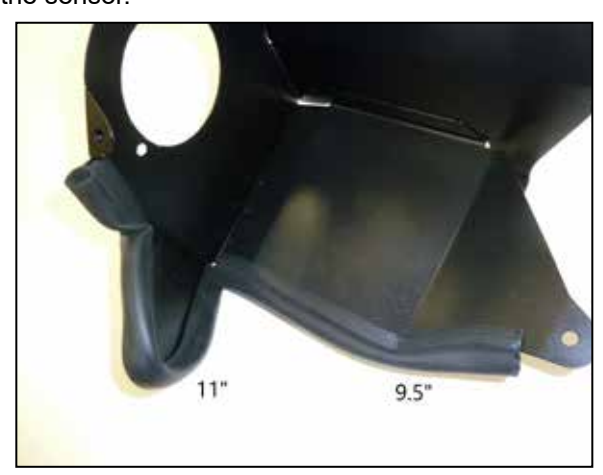
8. Cut the provided edge trim into sections of 11.5", 11"and 9.5". Then install the 9.5" and 11" sections of edge trim onto the heat shield as shown.