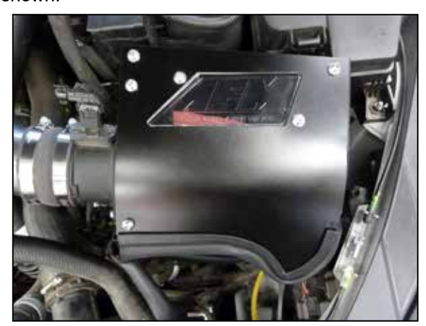
20. Install the lid onto the lid and secure with the provided hardware.