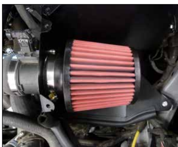
18. Install the air filter onto the mass air sensor and secure with the provided hose clamp.