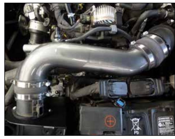
15. Install the intake tube into the hump coupler and then into the straight coupler, adjust for best fit and then secure with the provided hose clamps.