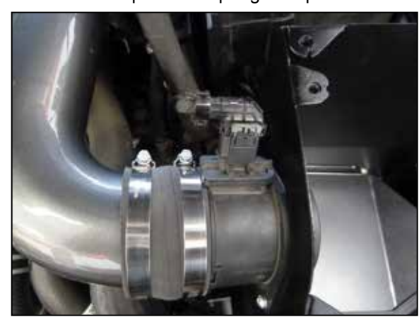
17. Reconnect the mass air sensor electrical connection.