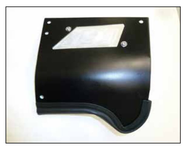
19. Install the AEM window into the heat shield lid with the spacer between the window and the lid. Secure the assembly with the provided hardware. Install the 11.5 section of edge trim onto the lid as shown.