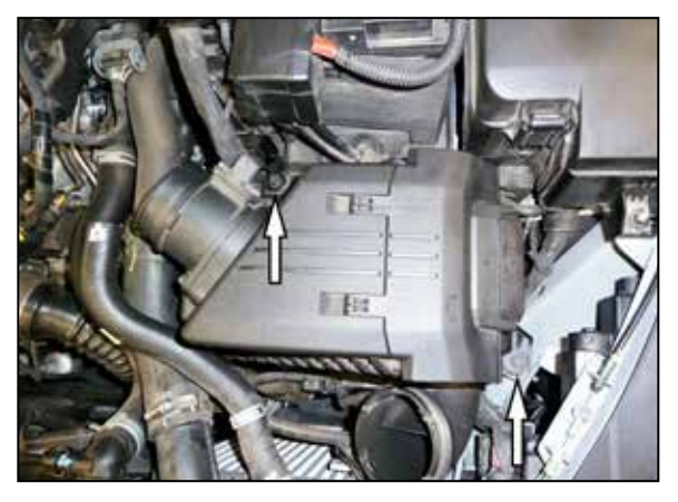
6. Remove the two bolts that secures the air filter housing and then remove the filter housing from the vehicle.