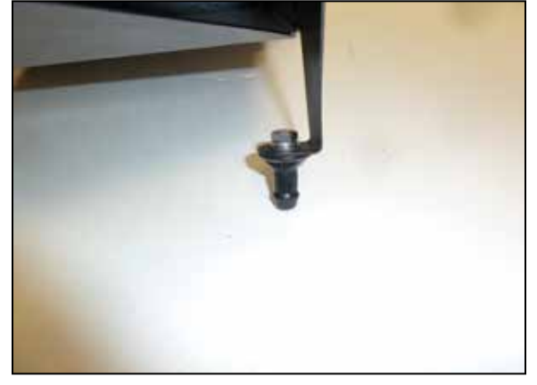
9. Install the mounting post to the heat shield using the provided hardware.