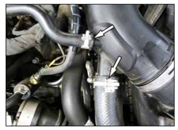
4. Release the spring clamps that secure the BOV hose and vent line, then disconnect the lines rom the factory intake tube.