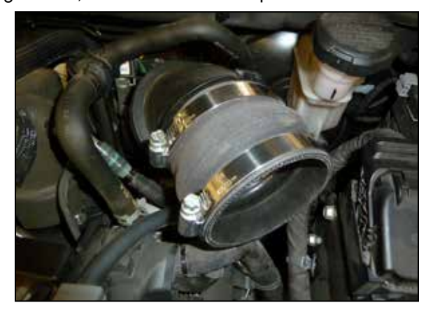
12. Install the provided hump coupler onto the turbo inlet and secure with the provided hose clamp.