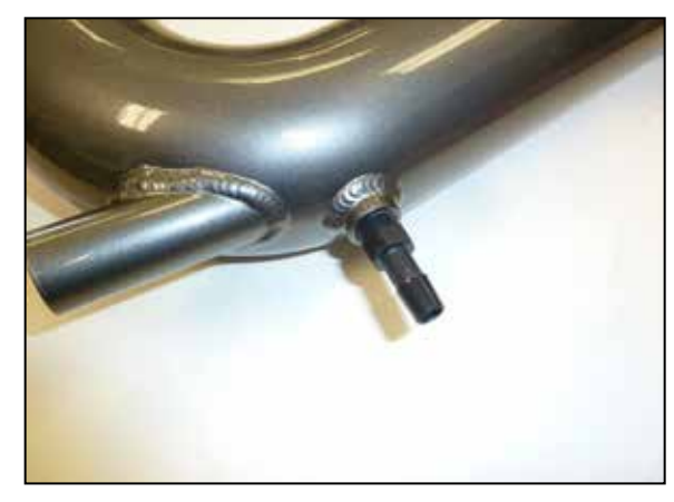
14. Install the provided vent fitting into the K&N intake tube as shown.