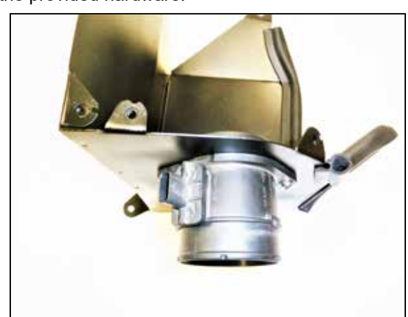
10. Using the provided hardware attach the mass air sensor to the heat shield as shown.