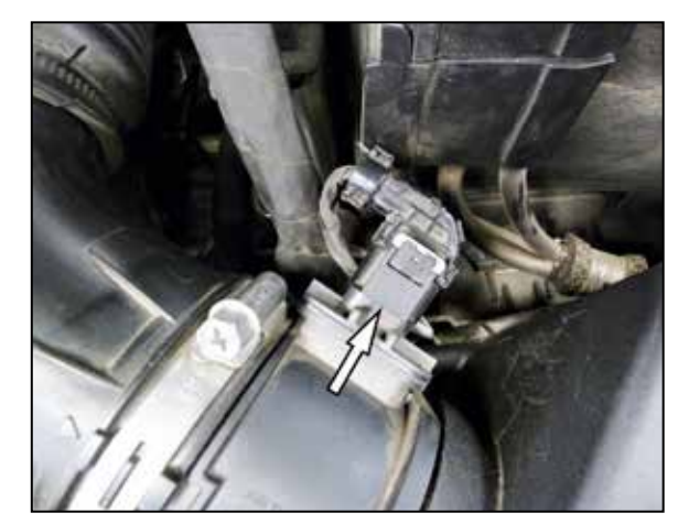
3. Disconnect the mass air sensor electrical connection.