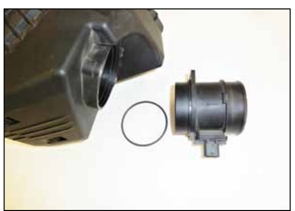
7. Remove the mass air filter from the factory air filter housing and then remove the O-ring seal from the sensor.