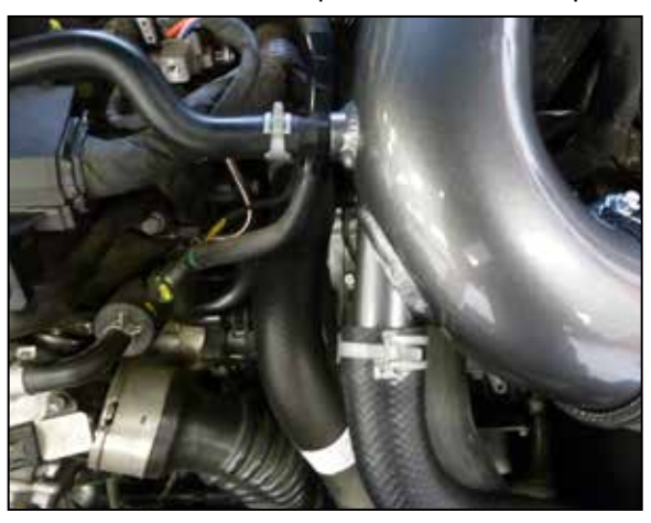
16. Connect the BOV hose and the vent line and secure with the provided spring clamp.