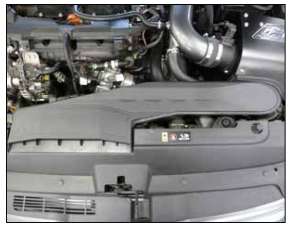
21. Reinstall the Fresh air intake duct.