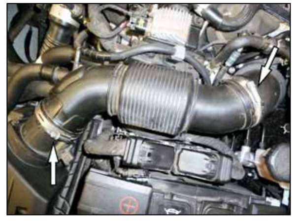
5. Loosen the two hose clamps that secure the factory intake tube and then remove the tube from the vehicle.