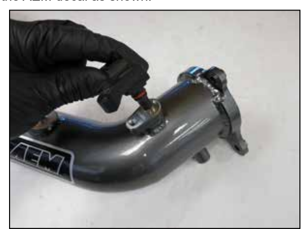
12. Install the pressure sensor into the AEM charge tube and secure with the provided hardware.