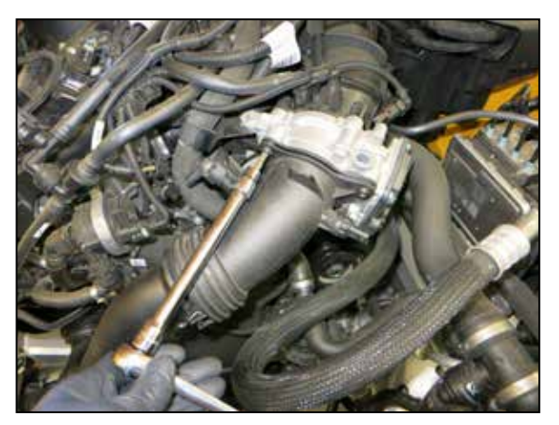
4. Remove the three bolts that secure the factory charge tube to the throttle body.