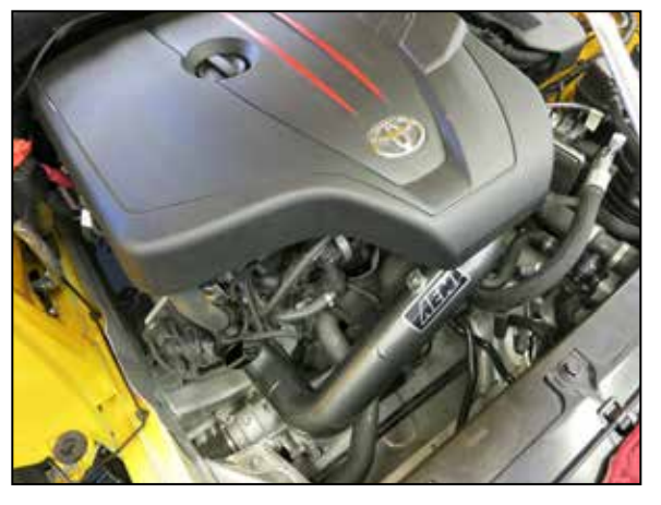
18. Reinstall the engine cover.