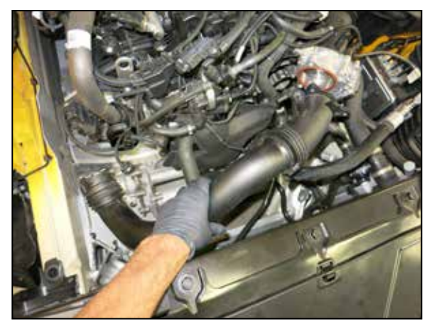
6. Separate the charge pipe from the turbo charger and then remove it from the vehicle.