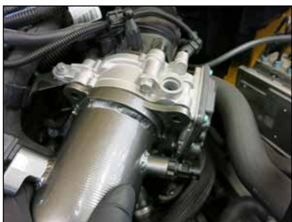
15. Install the AEM charge pipe onto the turbo inlet and throttle body. Push the tube onto the turbo until the retaining ring locks it into position while also aligning the top of the pipe with the throttle body.