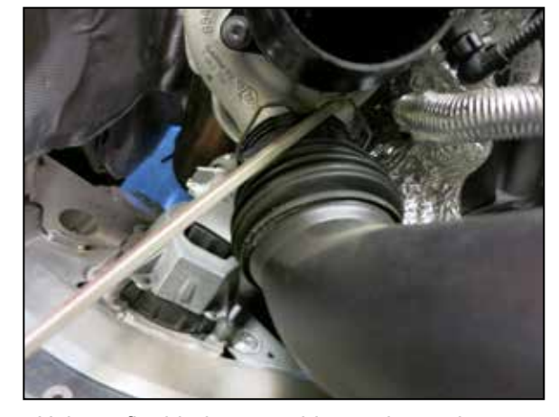
5. Using a flat blade screwdriver, release the retaining clip from lower factory charge pipes lower connection.