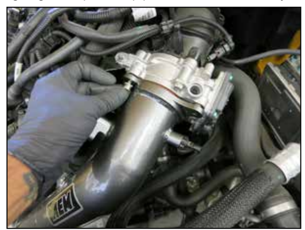
16. Secure the pipe to the throttle body with the hardware provided.