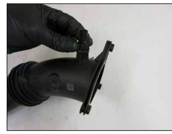
10. Remove the inlet temperature sensor from the factory charge pipe.