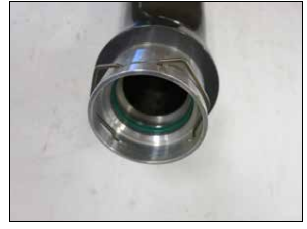
14. Install the factory O-ring and retaining clip into the AEM charge pipe as shown.