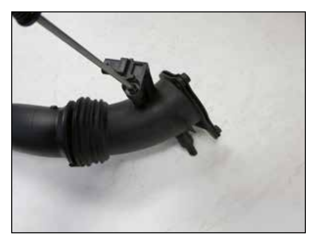
9. Remove the screw that secures the pressure sensor into the factory charge pipe and then remove the sensor from the pipe.