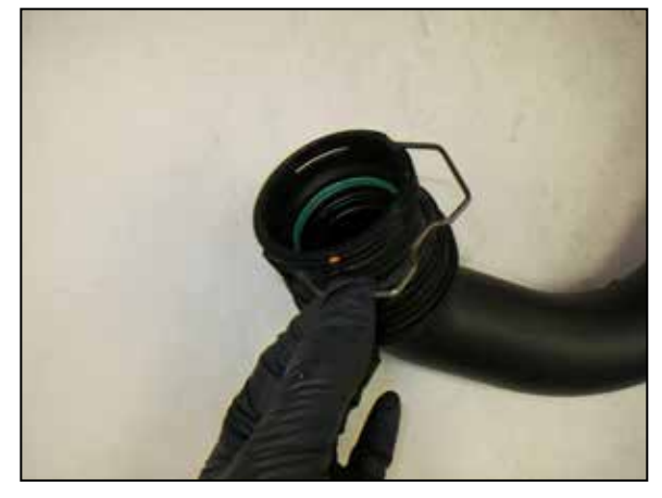
7. Remove the retaining clip from the stock charge pipe and set aside to be used with the AEM charge pipe in a later step.