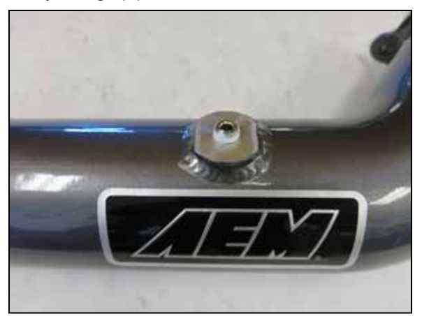
11. Install the 1/8npt pipe plug into the accessory port of the AEM charge pipe. Be sure to apply thread sealer to the plug before installation. Install the AEM decal as shown.