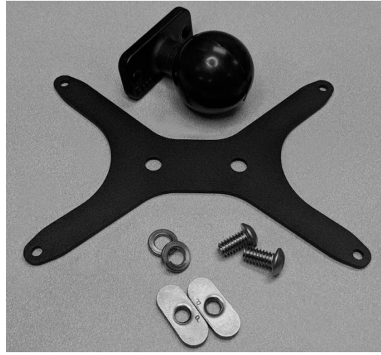
30-5545, CD-5 RAM MOUNT KIT