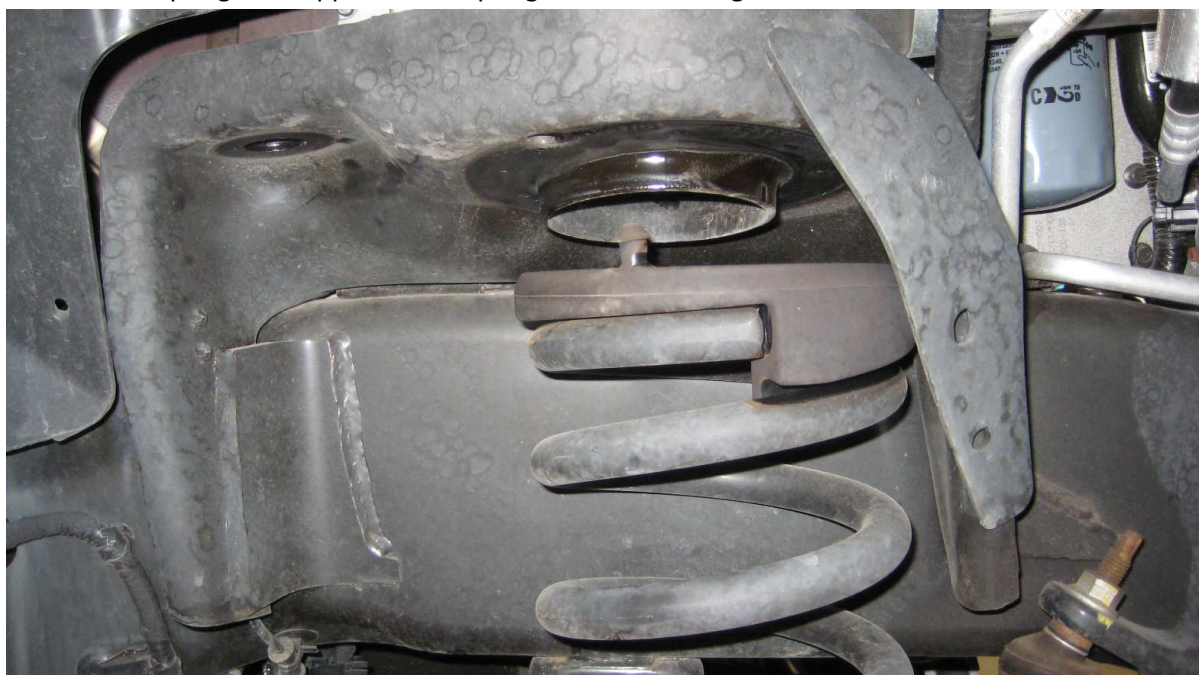
Figure 3. Passenger side