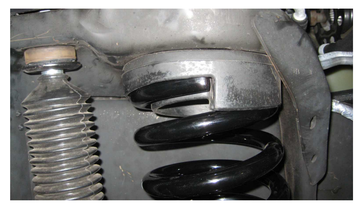
Figure 4. Passenger side (pictured with 5112 kit)