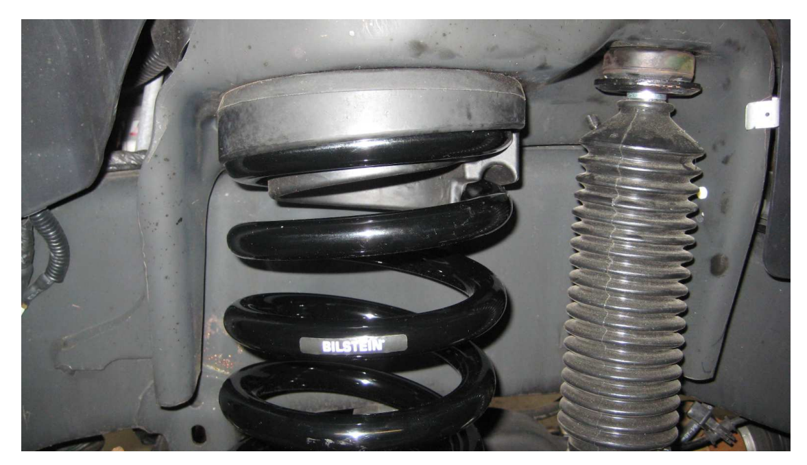
Figure 6. Driver side (pictured with 5112 kit)