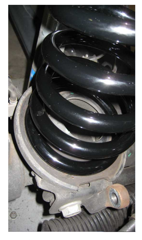
Figure 5. Passenger side (pictured with 5112 kit)