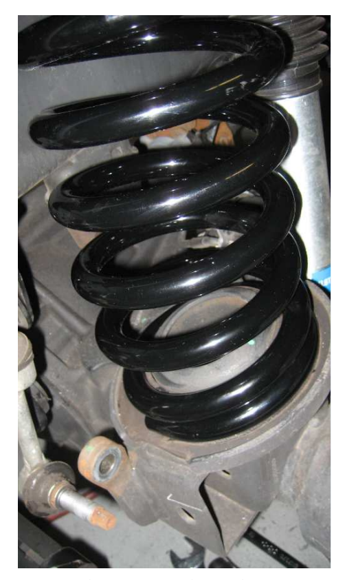
Figure 7. Driver side (pictured with 5112 kit)