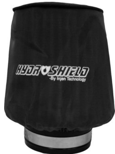
Hydro Shield Sold Separately

Now available, Hydro Shield by Injen Part Number X-1035