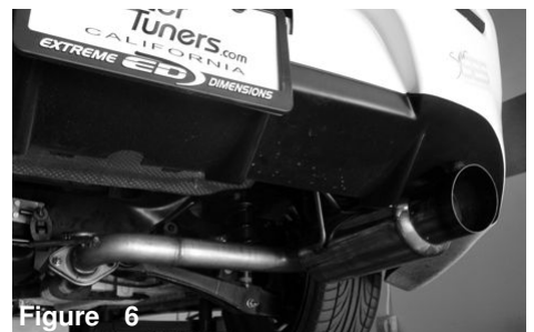
Figure 6 Align the entire axle-back for best fit and tighten the nuts and bolts, keep tip away from the bumper.