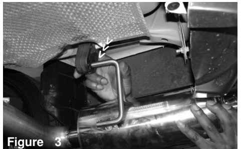
Figure 3 Raise the axle-back in place and insert the first hanger on the existing rear grommet.