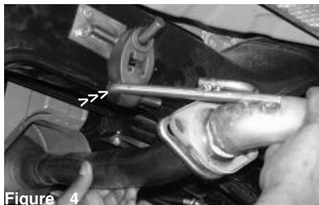
Figure 4 Push the second hanger near the flange into the second grommet as shown above.