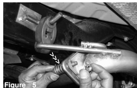
Figure 5 align the flange to the stock donut flange and use the stock spring loaded bolts and m10 nuts supplied.