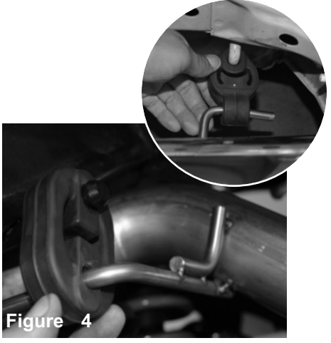
Install and secure the hangars. Secure and tighten using factory springs/bolts. Secure using provided M8 nuts. Tighten and secure the exhaust. Your installtion is now complete. Check for clearance and positon for best possible fit. Thank you for choosing Injen Technology!