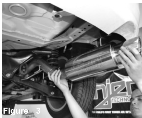
Install the Injen axle back exhaust, and position to the factory flange.