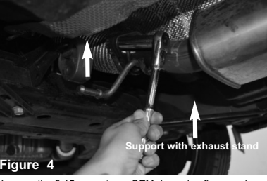
Loosen the 2 15mm nuts on OEM downpipe flange using ratchet and socket. Save nuts and gasker for later use. Remove the factory front section.